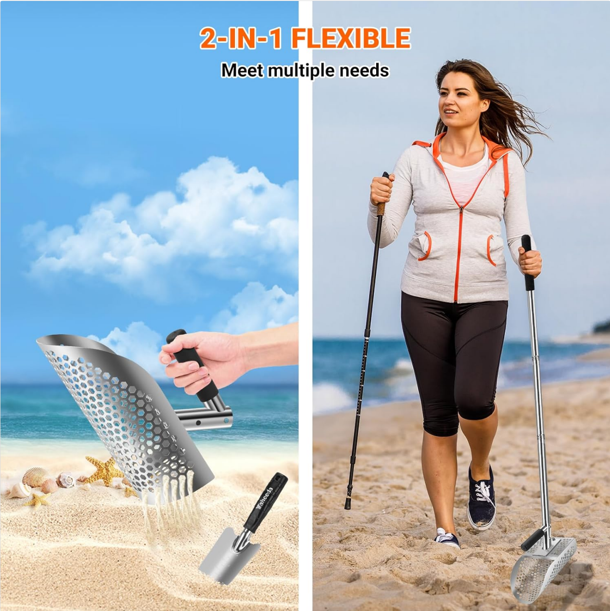
Figure 2.1: The Yaheeda Sand Scoop Kit demonstrating its 2-in-1 flexibility for various uses.