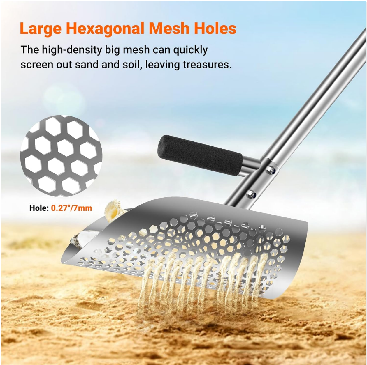
Figure 2.2: Detailed view of the large hexagonal mesh holes designed for efficient sand and soil sifting.