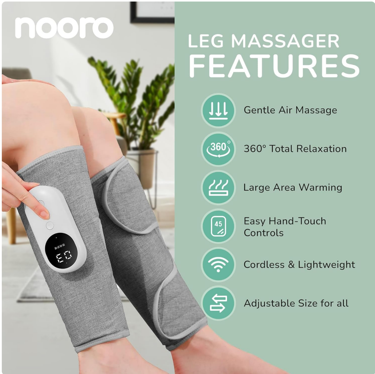
Image: A user wearing the nooro 3-in-1 Leg Massager on their calves, demonstrating proper placement.

Your browser does not support the video tag.