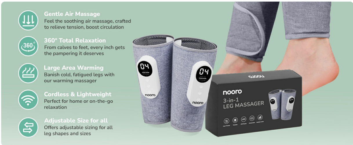
Image: The nooro 3-in-1 Leg Massager highlighting its adjustable intensity and heating massage features.