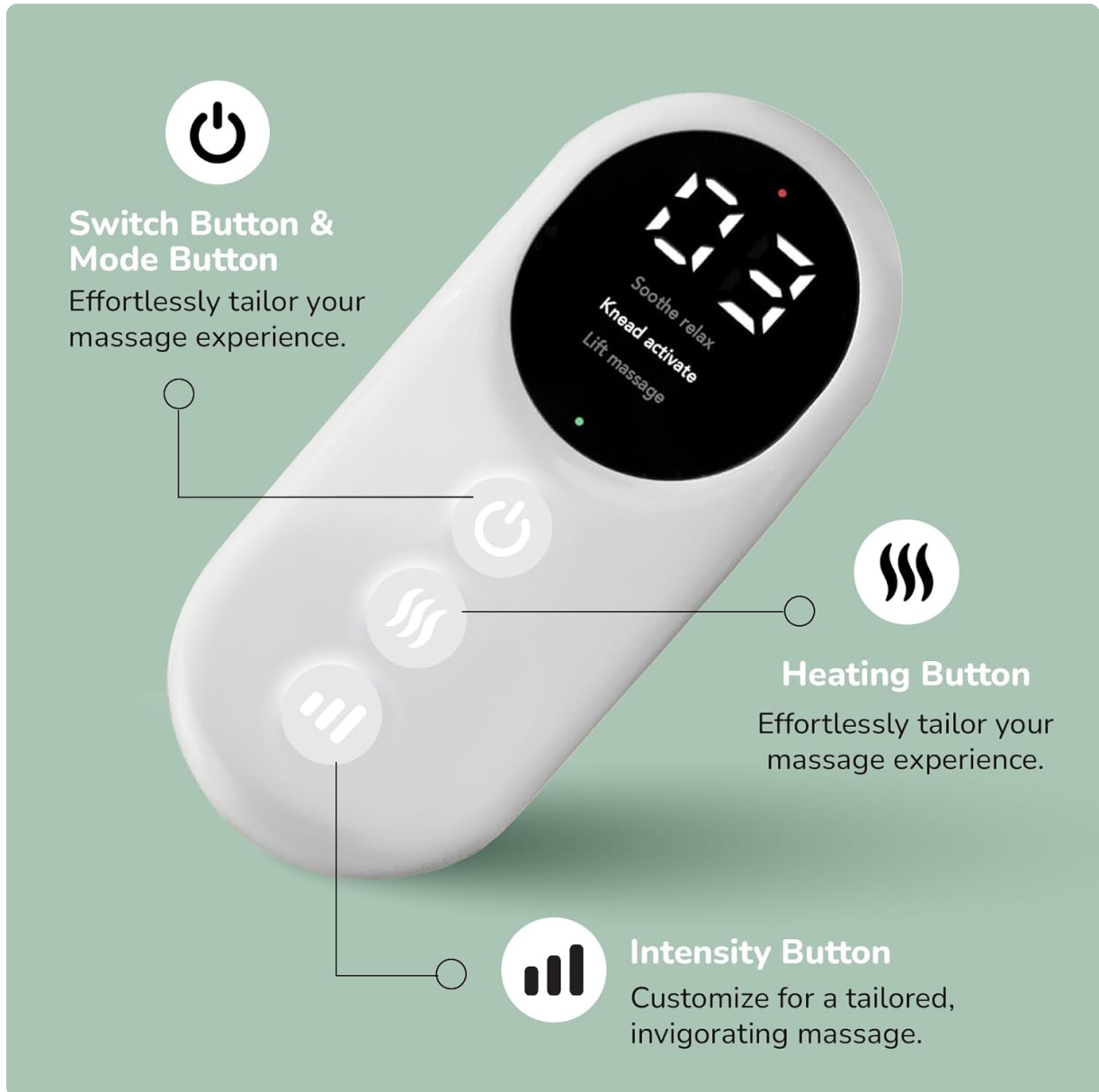
Image: Detailed view of the massager's control panel, showing buttons for power/mode, heat, and intensity.

Tap the bottom intensity button to select the desired massage intensity. There are three available intensity levels, with each level being more intense than the last.