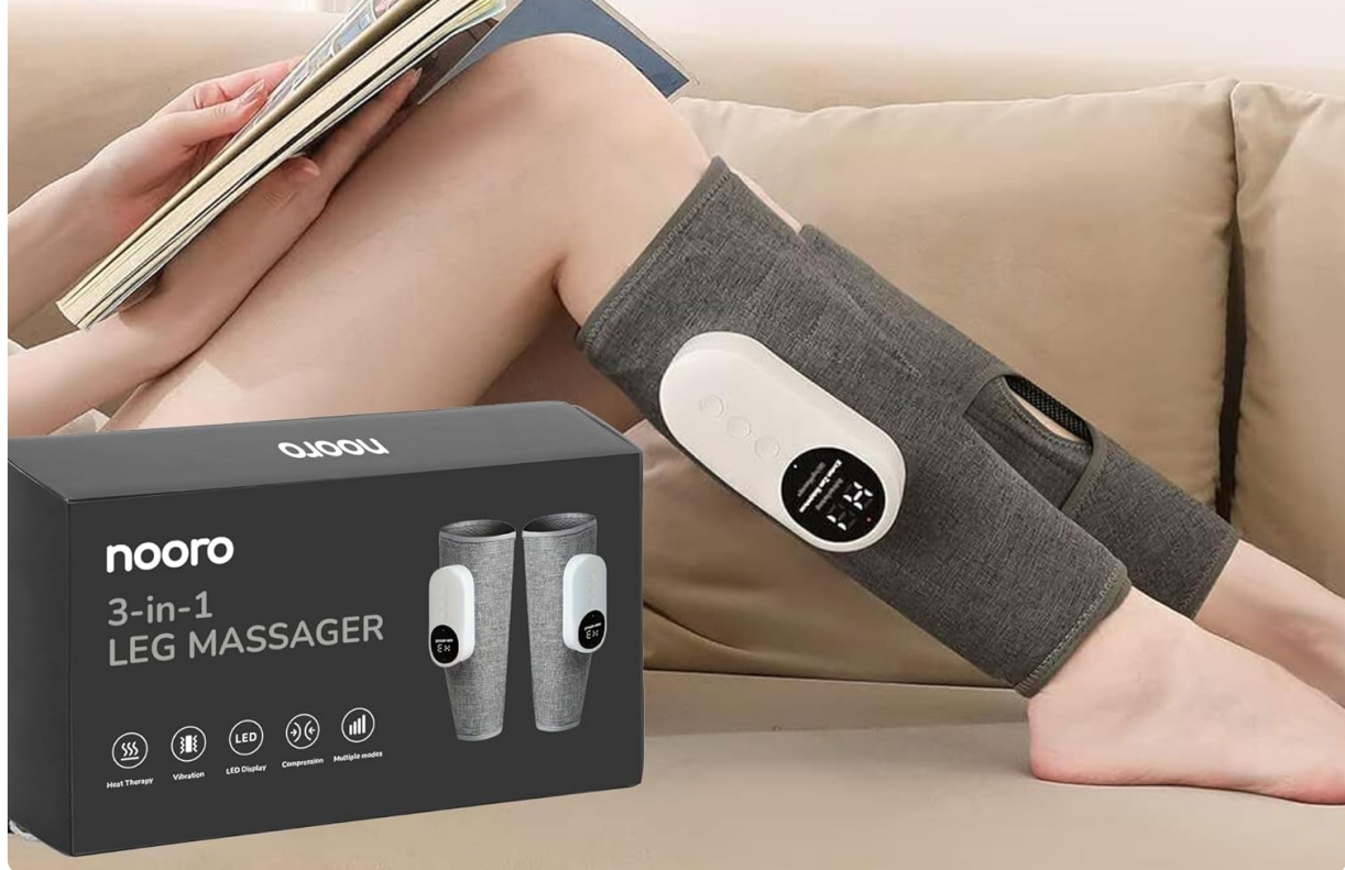
Image: The nooro 3-in-1 Leg Massager units shown with their retail packaging.

Take your wellness journey anywhere with nooro Leg Massager! Indulge in a rejuvenating massage experience whenever and wherever you need it.