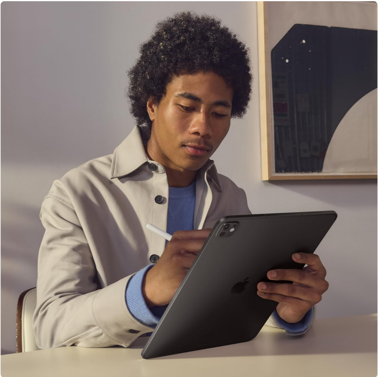
Figure 3.3: A user interacting with the iPad Pro using an Apple Pencil, demonstrating its creative potential.