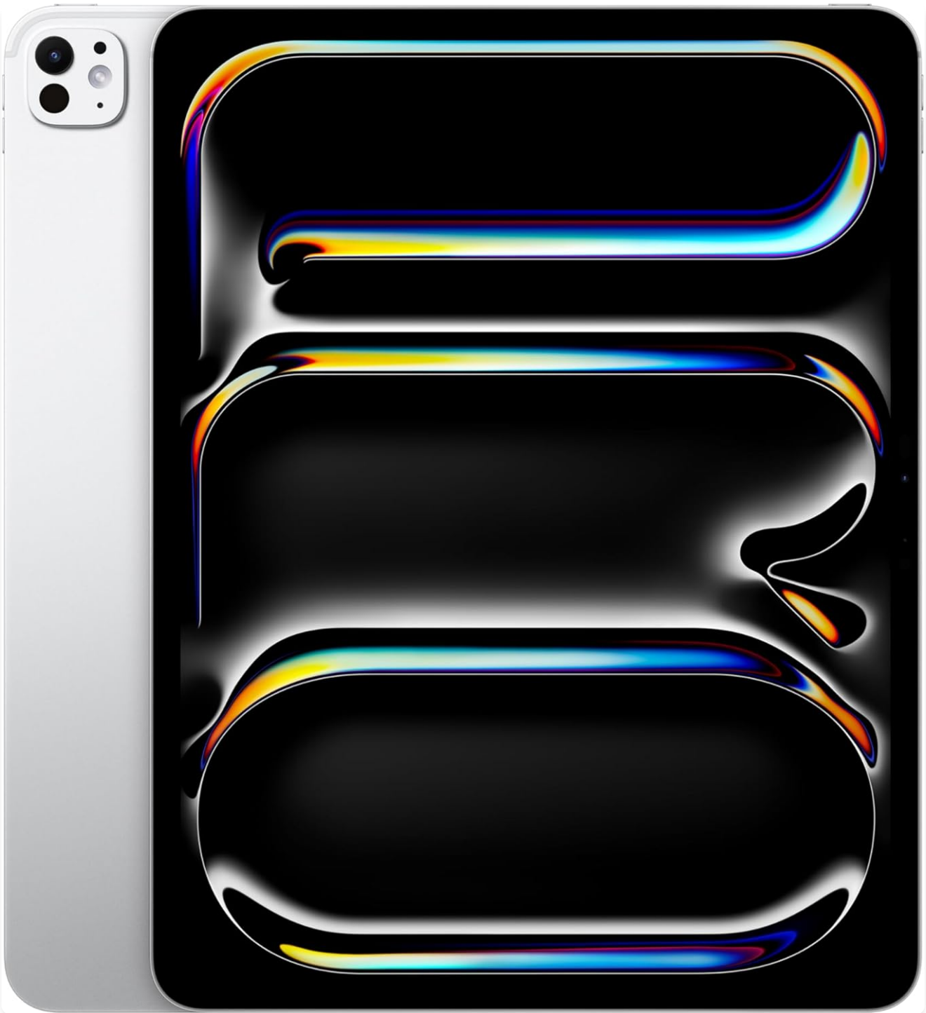
Figure 2.1: The Apple iPad Pro 13-inch (M4) in Silver, showcasing its sleek design from both front and rear perspectives.