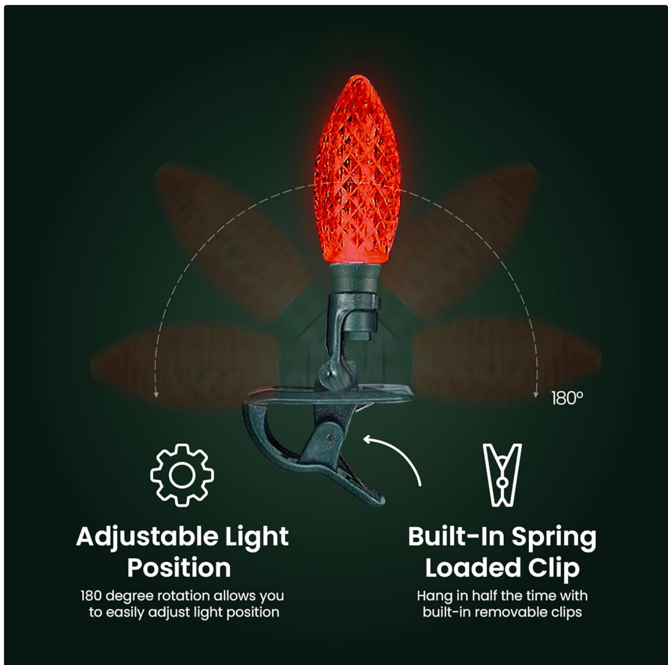
Image: Diagram illustrating the 180-degree rotation capability of the C9 LED bulbs for customizable light direction.