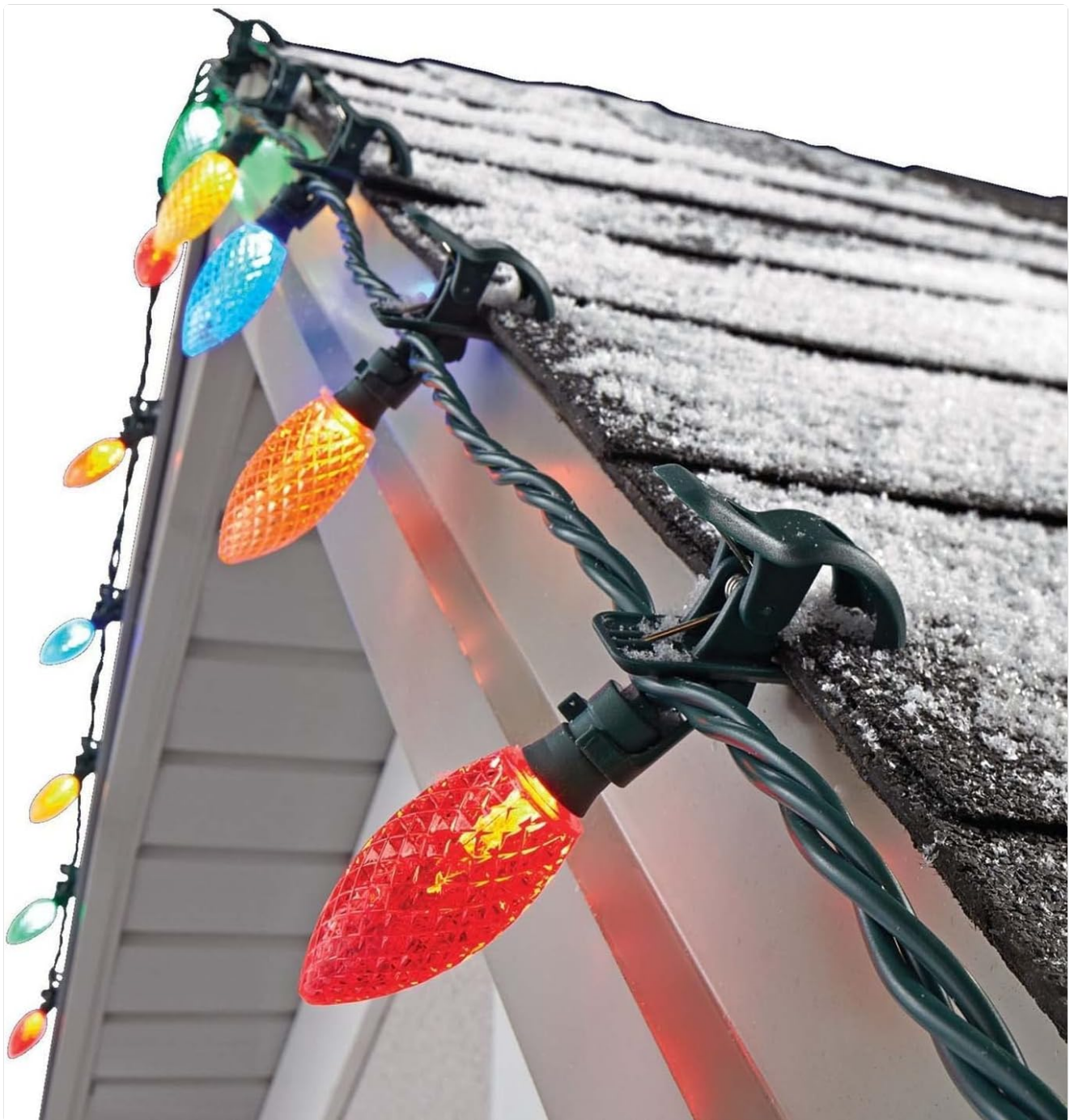
Image: Noma Quick Clip C9 LED lights installed along a snowy roofline, demonstrating secure attachment.