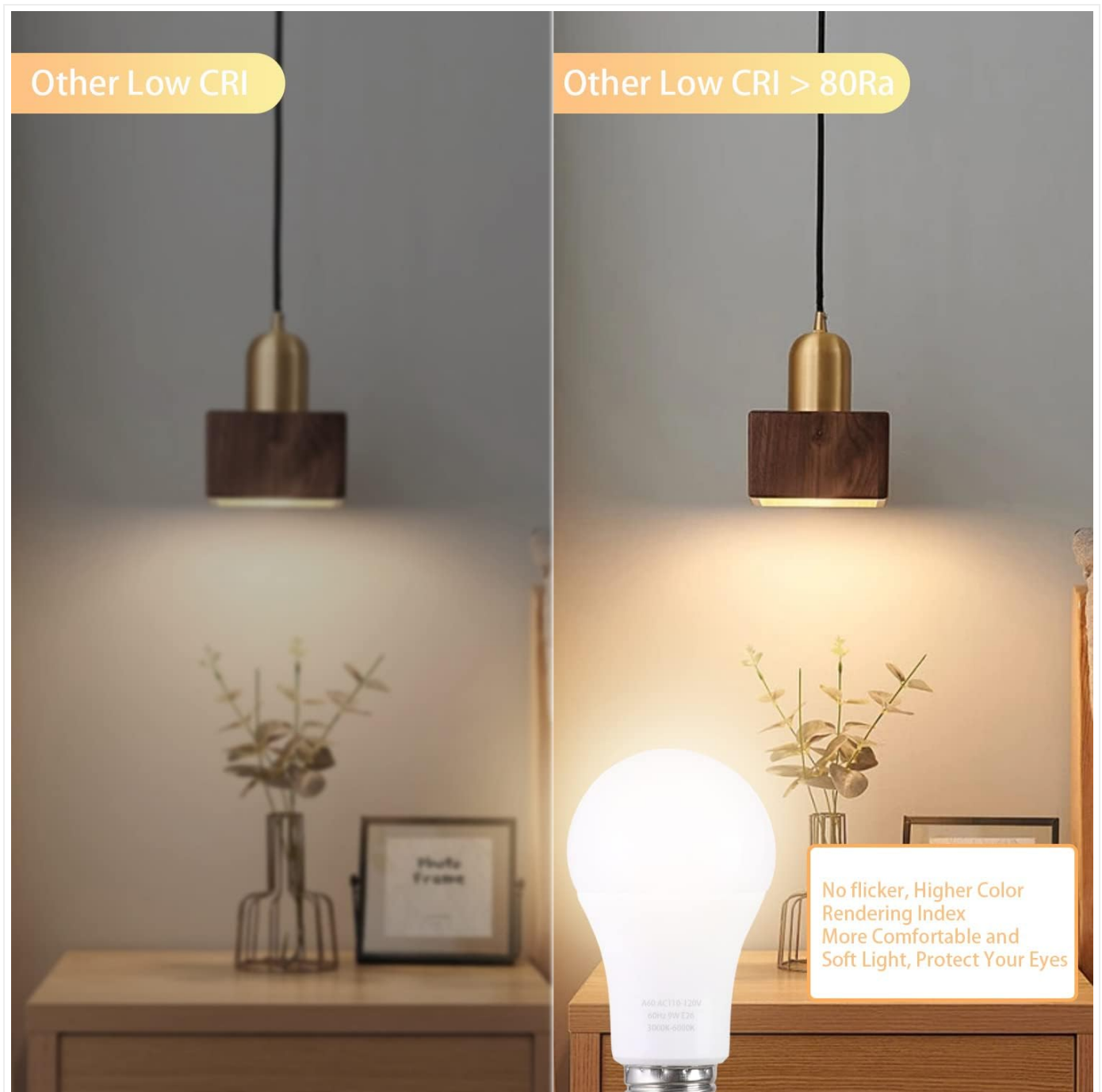
Image: A visual comparison demonstrating the superior light quality of the TABEVIO bulb, showing higher Color Rendering Index (CRI) for more vivid colors and the absence of flicker compared to other bulbs.