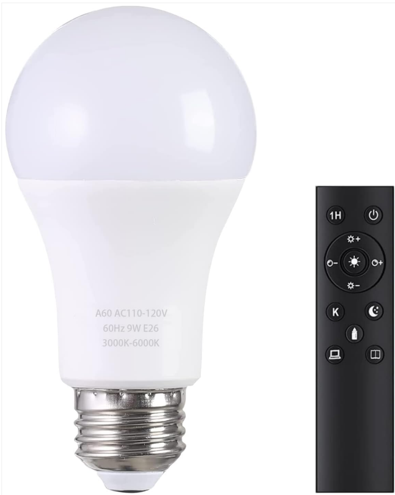
Image: The A19 LED light bulb and its accompanying remote control. The bulb is white with an E26 screw base, and the remote is black with various control buttons.