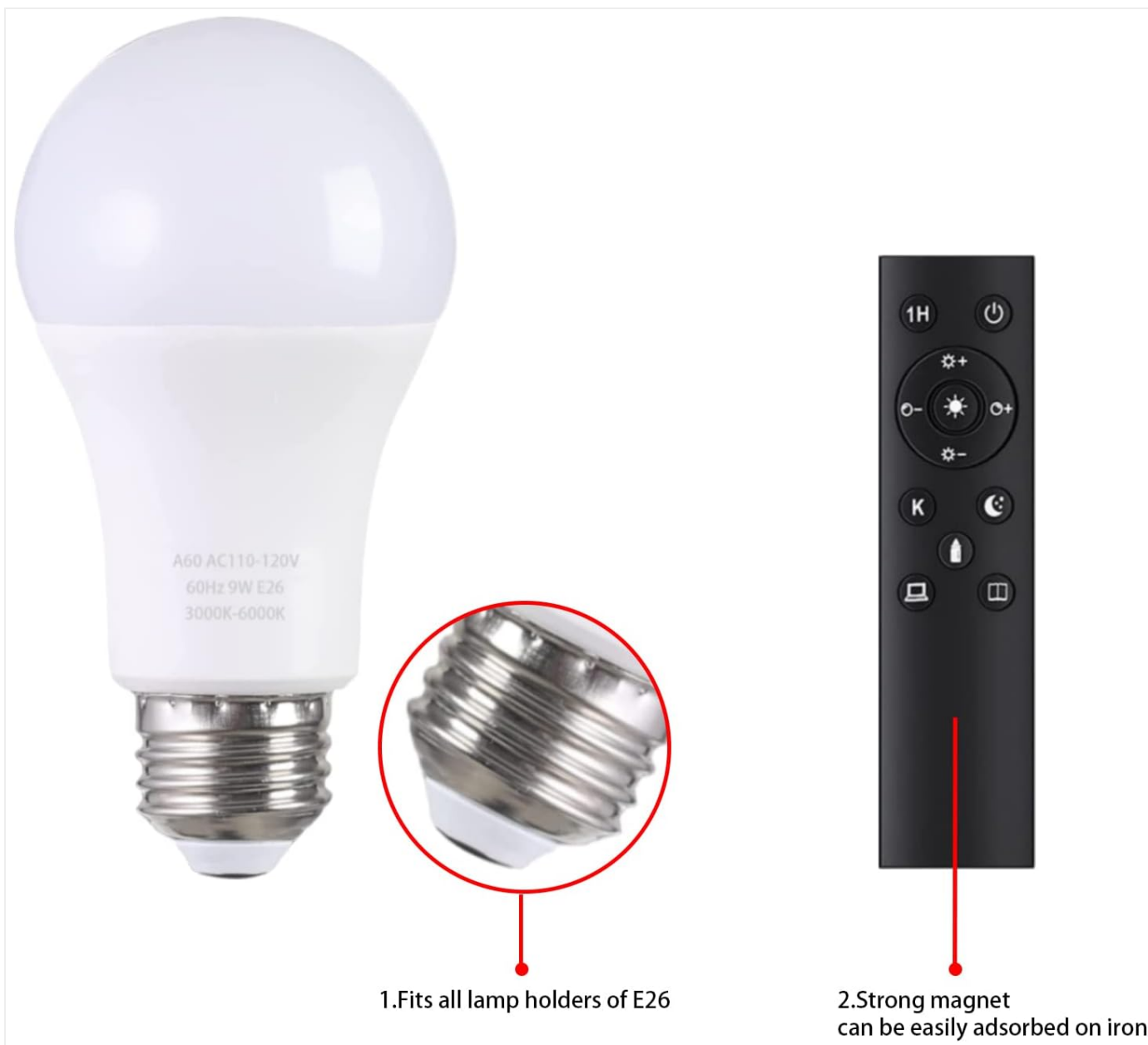
Image: A close-up view highlighting the E26 screw base of the bulb and the magnetic feature of the remote control, indicating its compatibility and convenient storage.