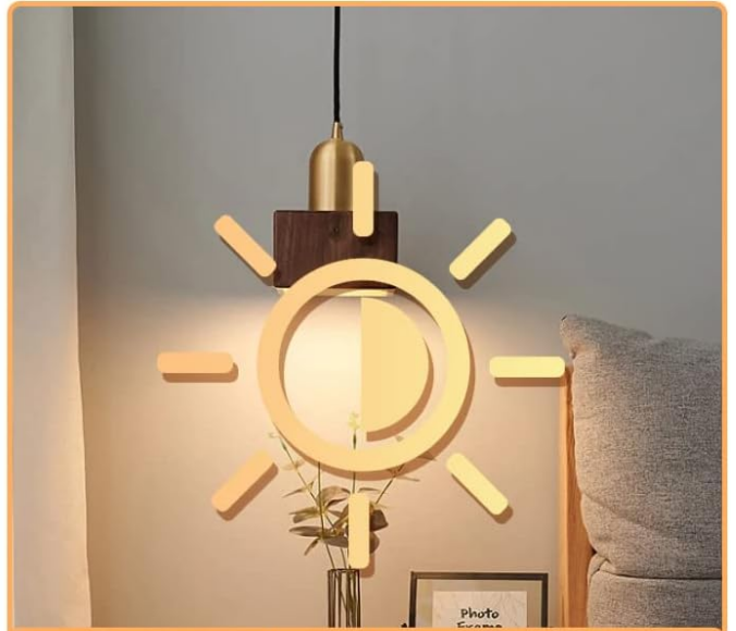
Night Light Mode