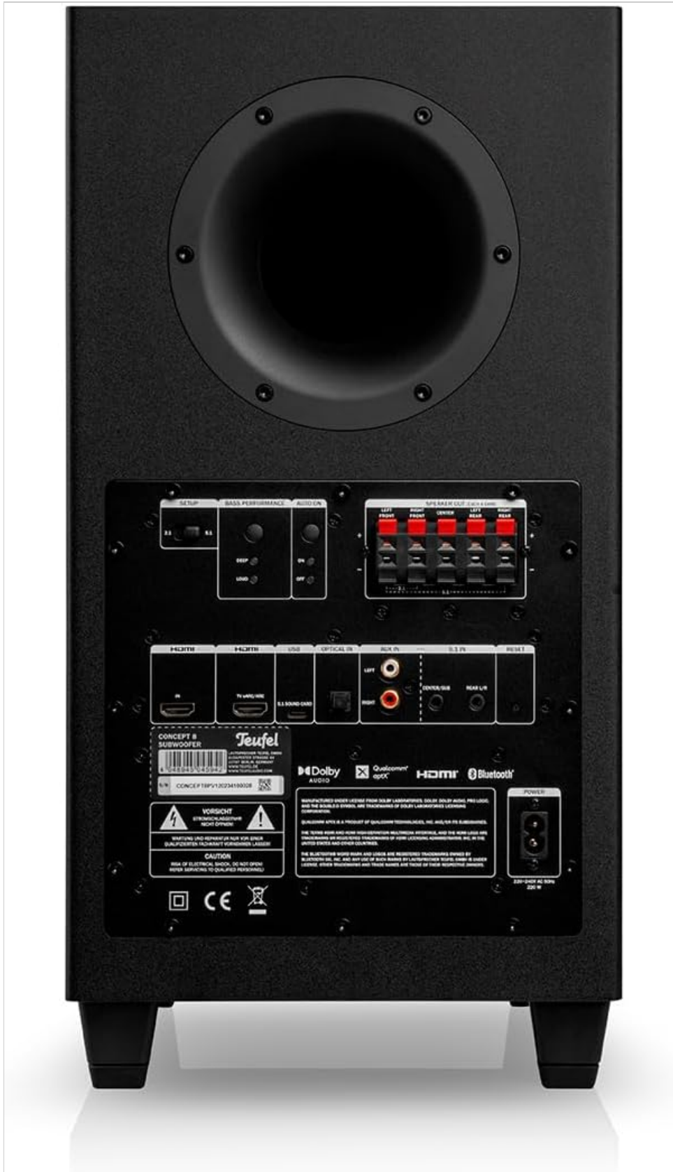
Figure 3: The downfire woofer and sturdy feet of the subwoofer.

corners, as this can lead to exaggerated or boomy bass. Experiment with different positions in your room to find the best sound balance.