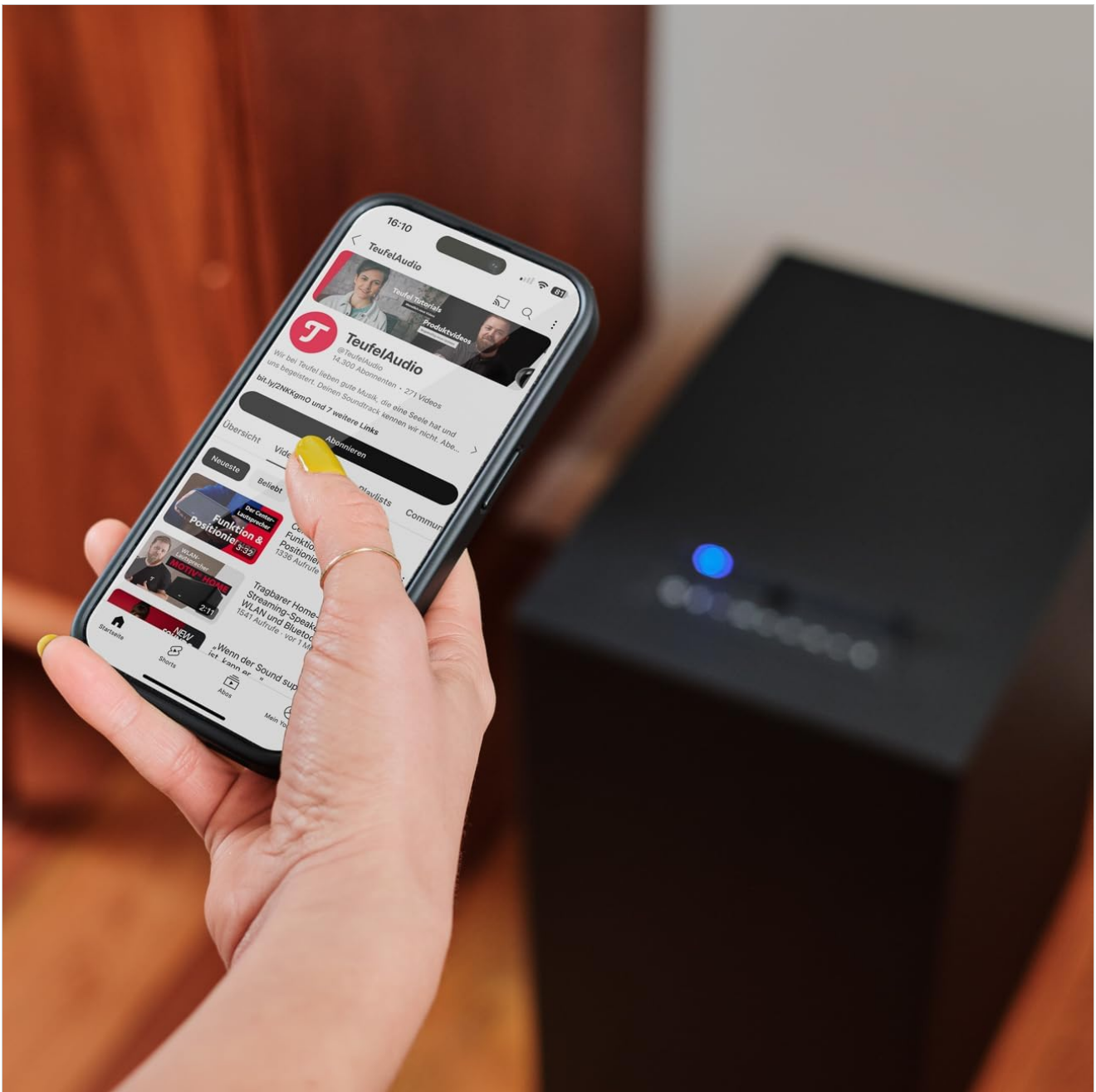
Figure 6: Subwoofer connected via Bluetooth to a smartphone.