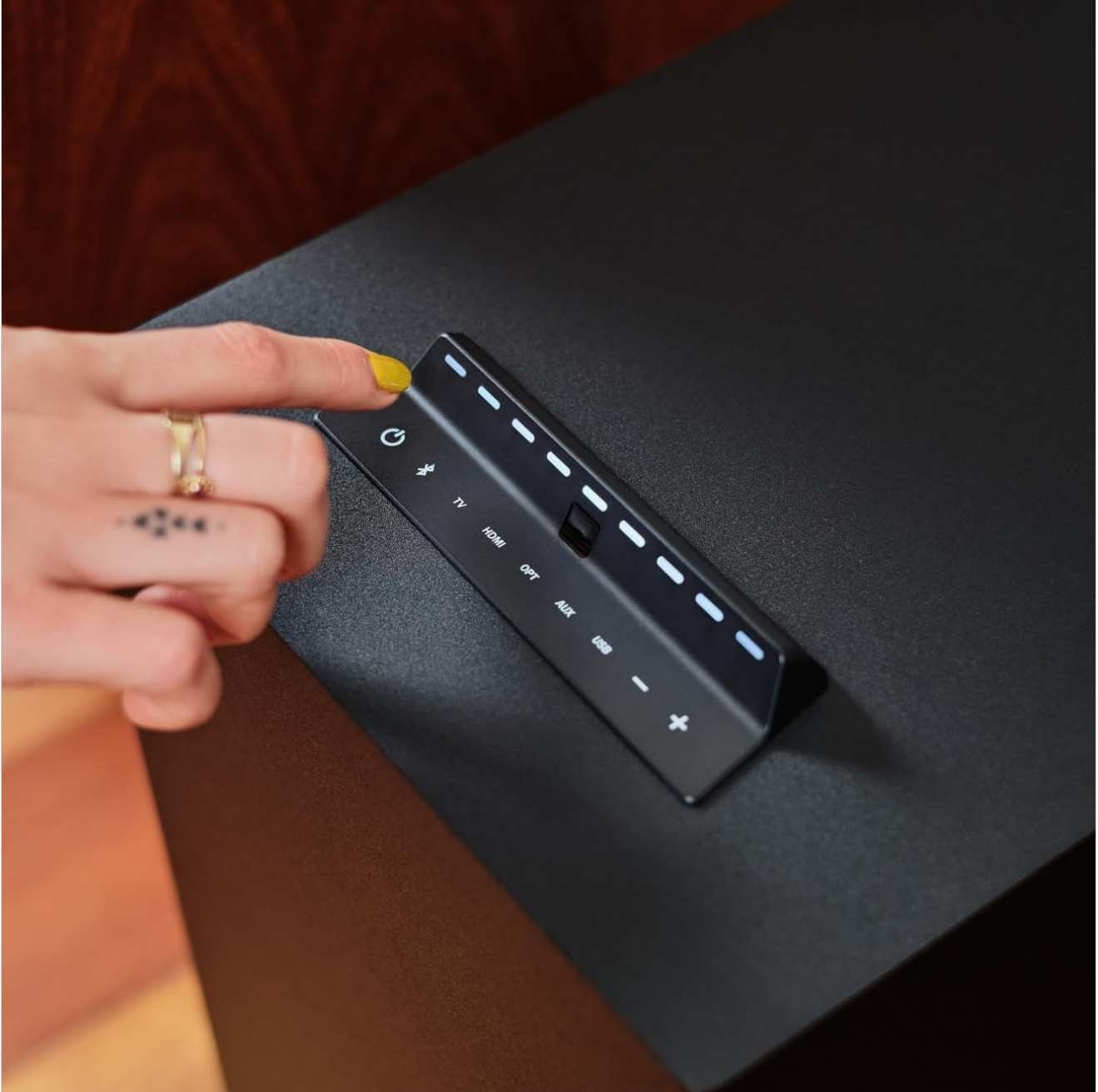
Figure 5: Detailed view of the control panel.

The subwoofer features a touch-sensitive control panel on its top surface for easy operation.