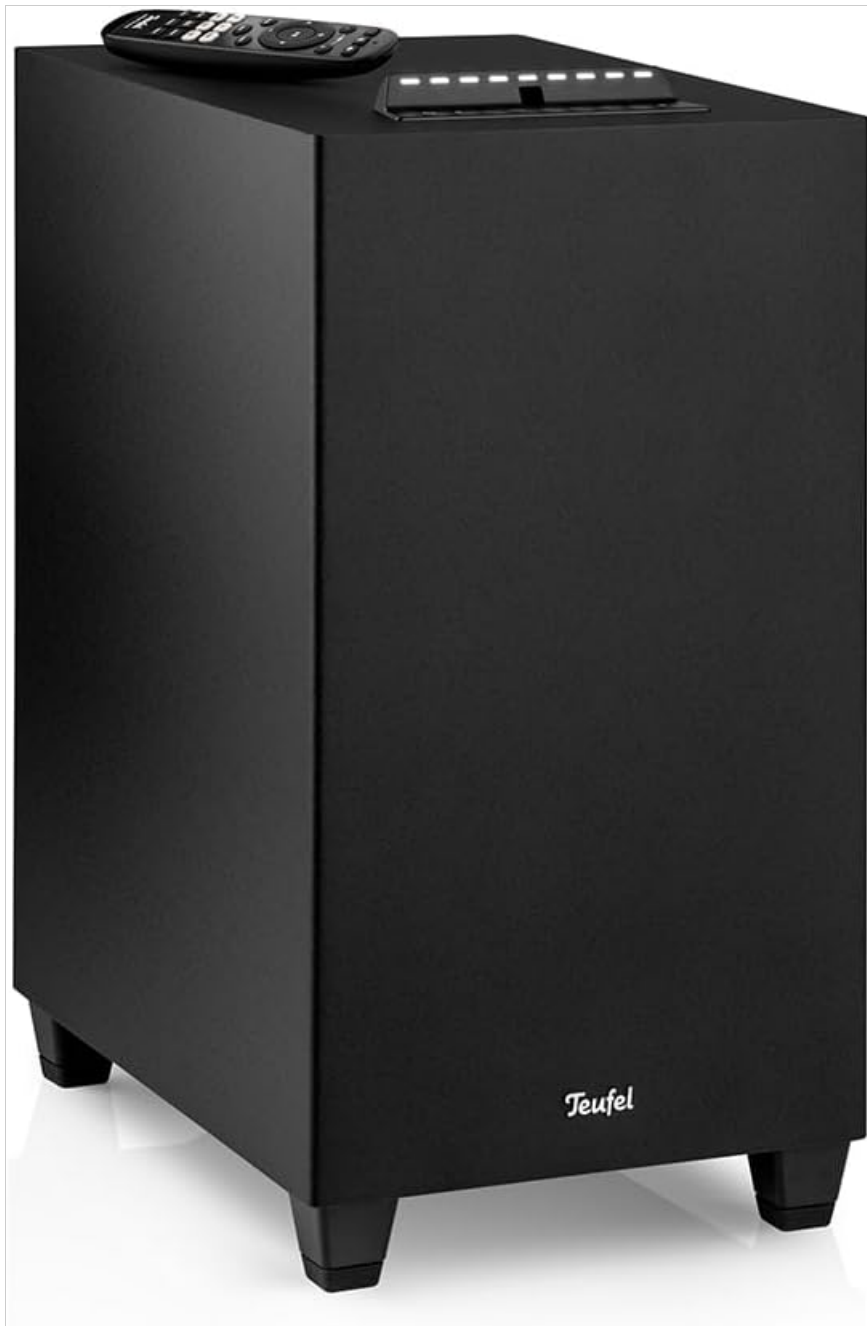
Figure 1: Top view of the Teufel Concept 8 Subwoofer with its integrated control panel.