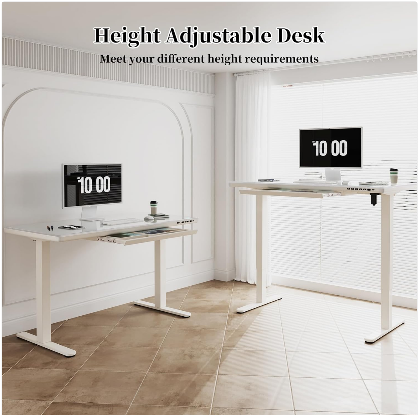
Image: Two TRIUMPHKEY Electric Glass Standing Desks side-by-side, illustrating the height adjustment range from a lower sitting position to a higher standing position.