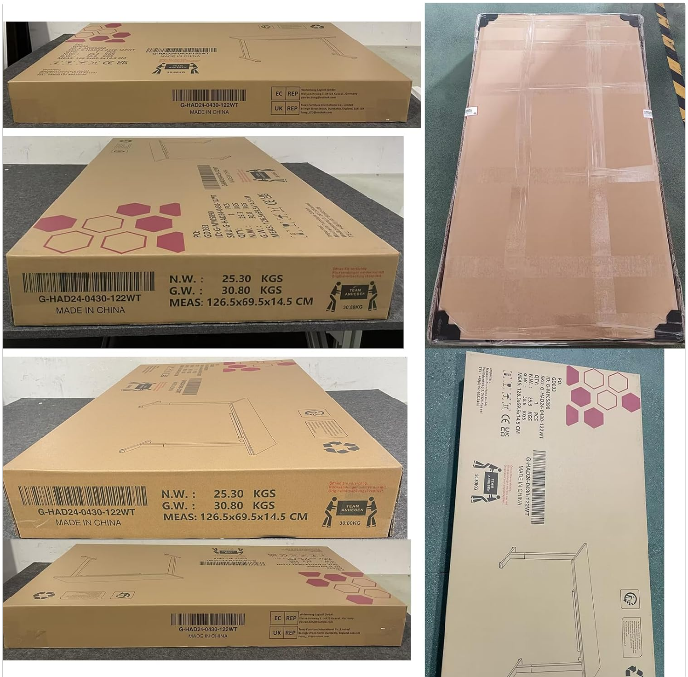
Image: Packaging of the TRIUMPHKEY Electric Glass Standing Desk, showing the brown cardboard box with product details and handling instructions.