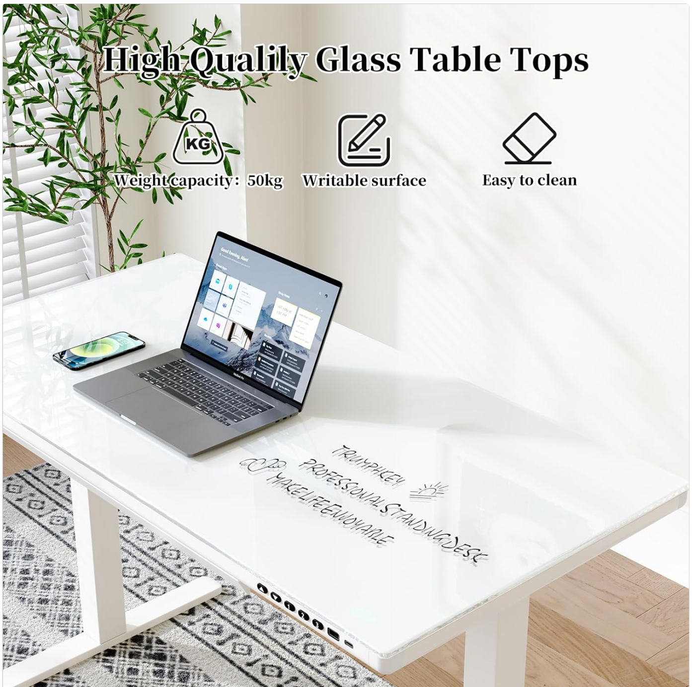
Image: A close-up view of the glass desktop, showing text written on it with a dry-erase marker, and icons indicating its writable surface, easy-to-clean property, and 50kg weight capacity.