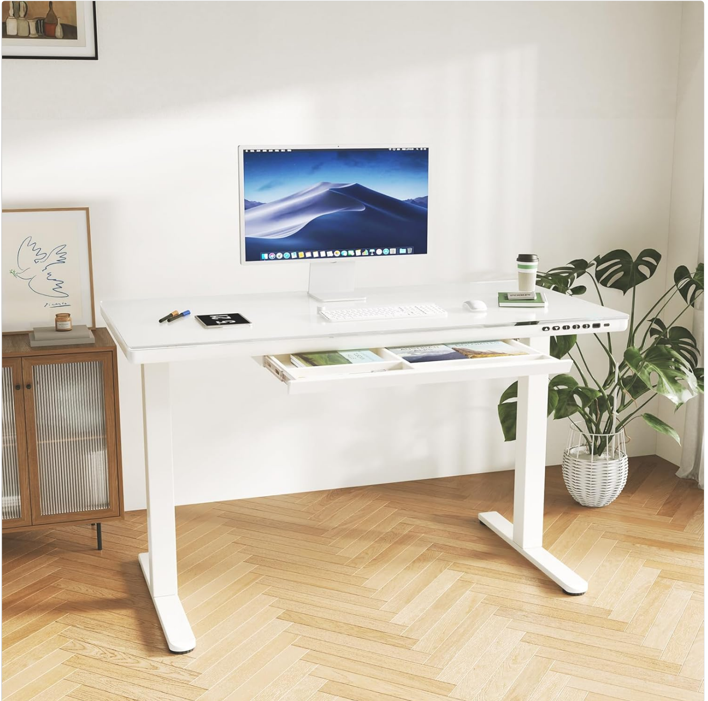
Image: An assembled TRIUMPHKEY Electric Glass Standing Desk, white in color, with a monitor and keyboard, situated in a modern room with plants and wooden flooring.