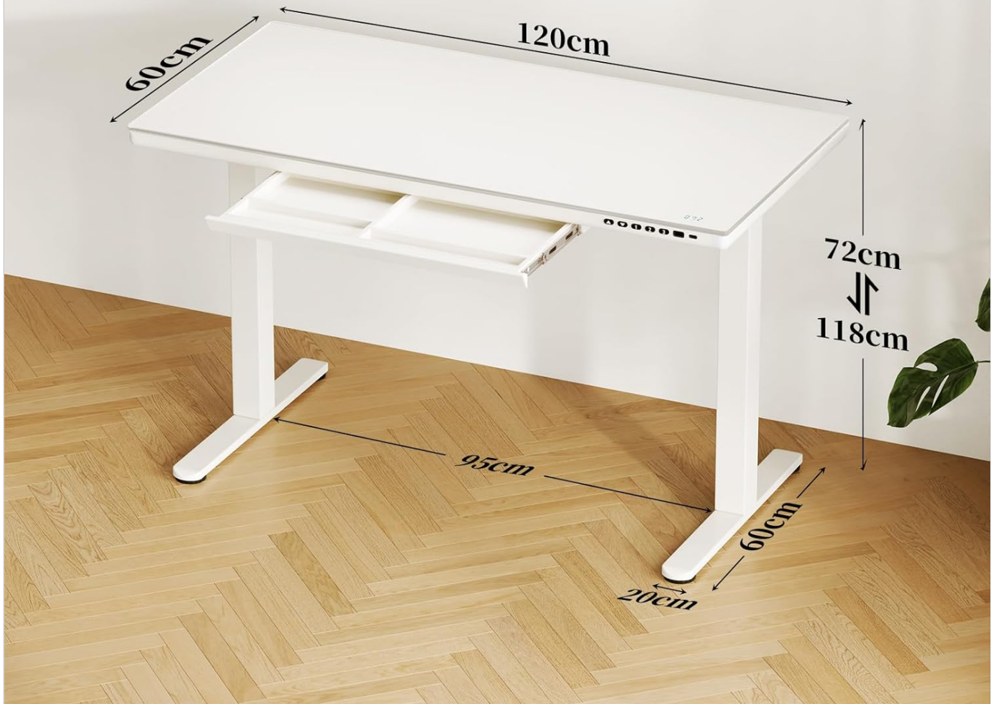
Image: Diagram showing the dimensions of the TRIUMPHKEY Electric Glass Standing Desk: 120cm length, 60cm width, and adjustable height from 72cm to 118cm.