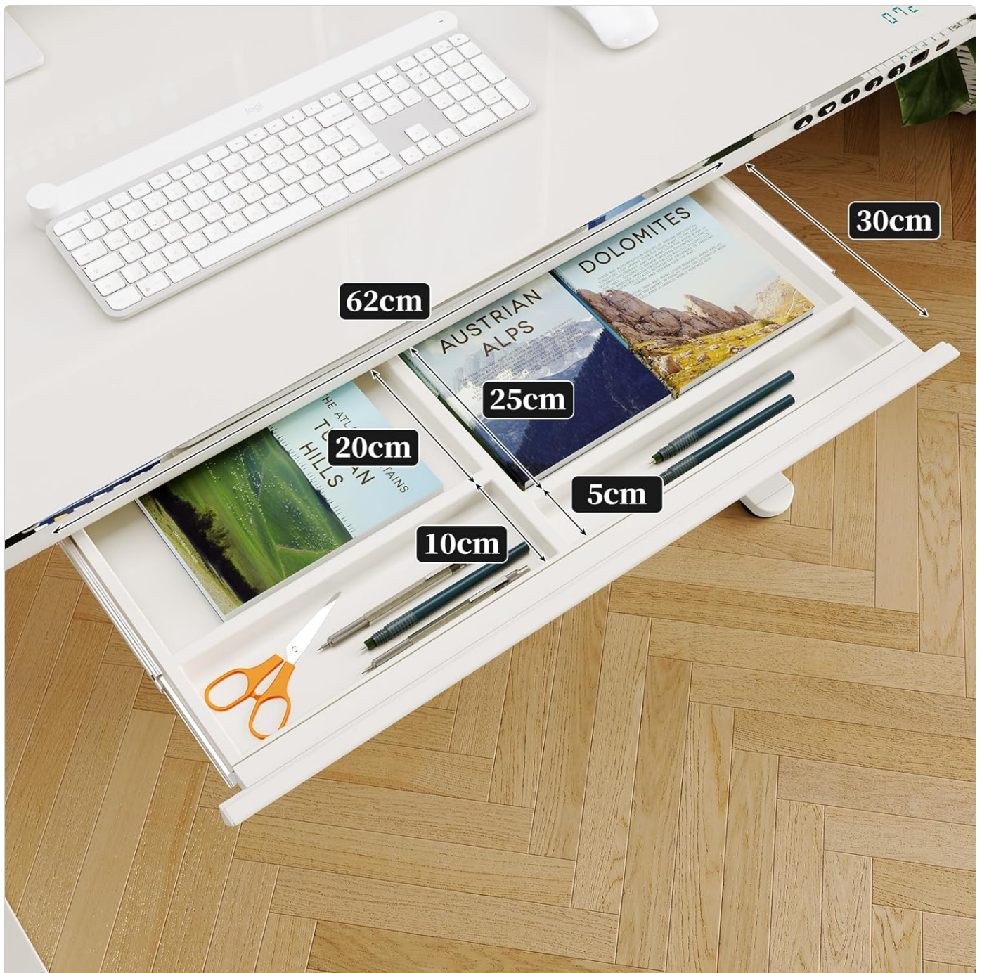
Image: The open storage drawer of the desk, displaying its internal compartments and dimensions (e.g., 62cm width, 30cm depth, 5cm height for main compartment, with smaller sections).