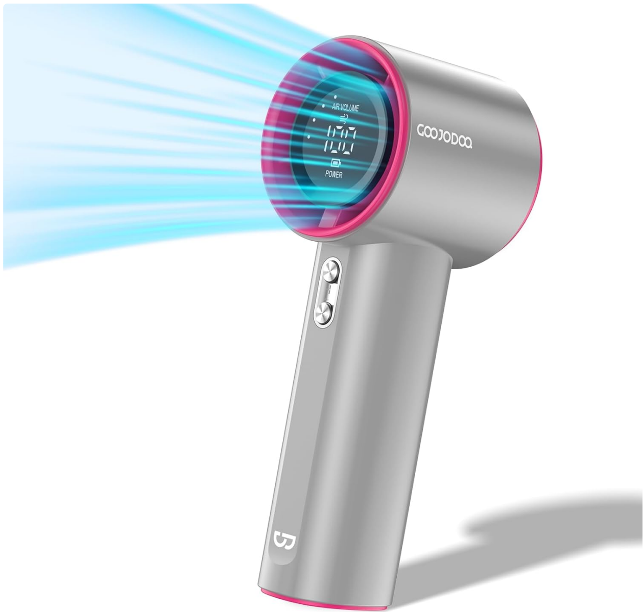
Image: The GOOJODOQ Portable Turbo Fan in grey, showcasing its sleek design and the powerful airflow it generates from the front nozzle. A digital display on the fan shows 'AIR VOLUME', '100', and 'POWER'.