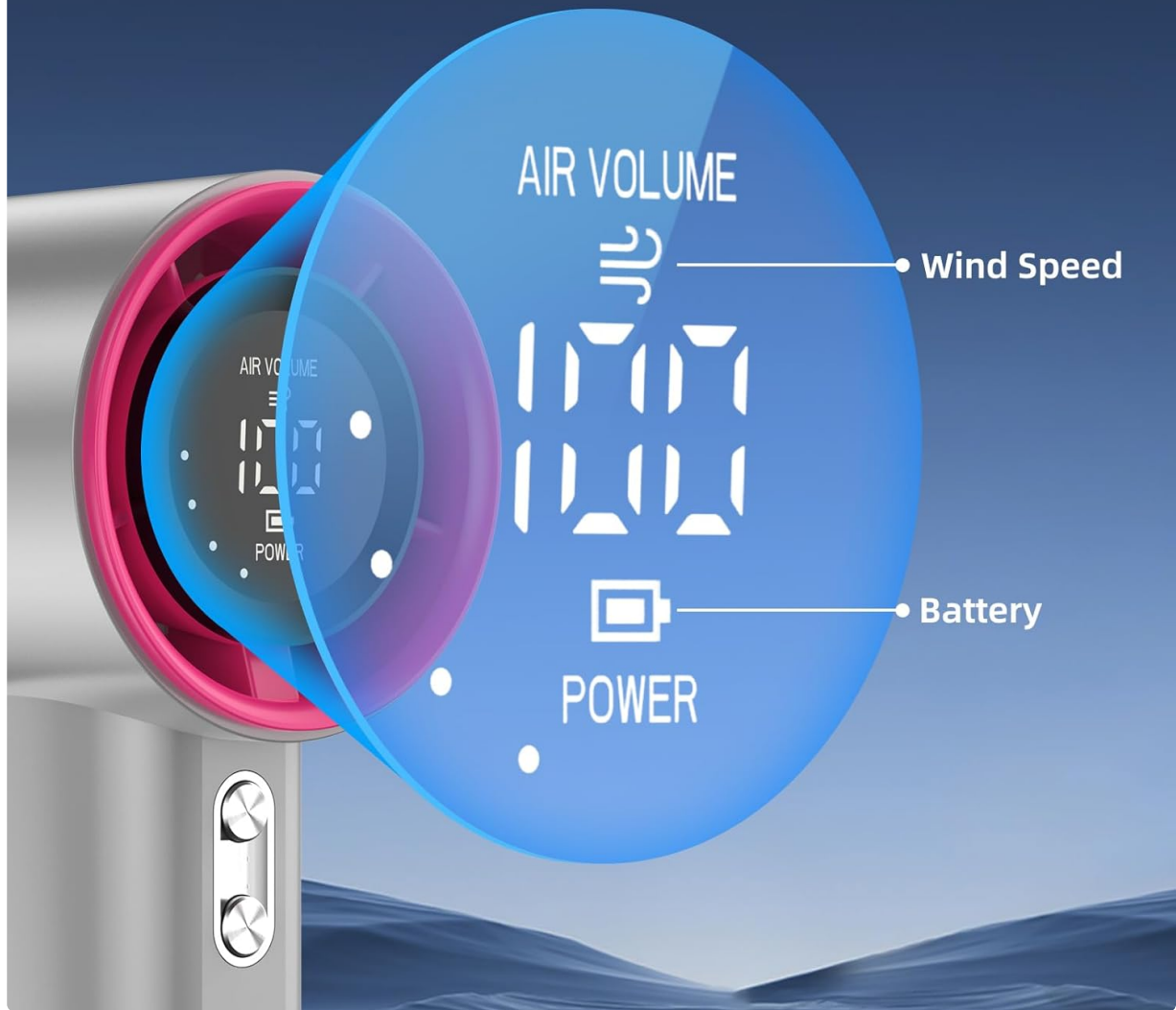
Image: A detailed view of the high-resolution digital display on the fan, clearly indicating 'AIR VOLUME' (wind speed) as '100' and 'POWER' (battery level) with a battery icon.