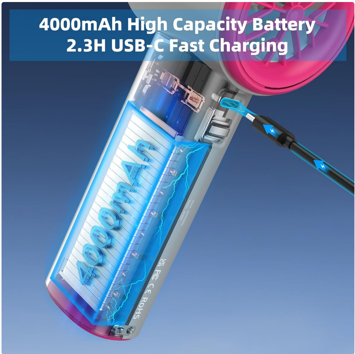
Image: An X-ray style view of the fan's handle, revealing the internal 4000mAh high-capacity battery and the USB-C charging port with a charging cable connected, illustrating 2.3 hours fast charging.