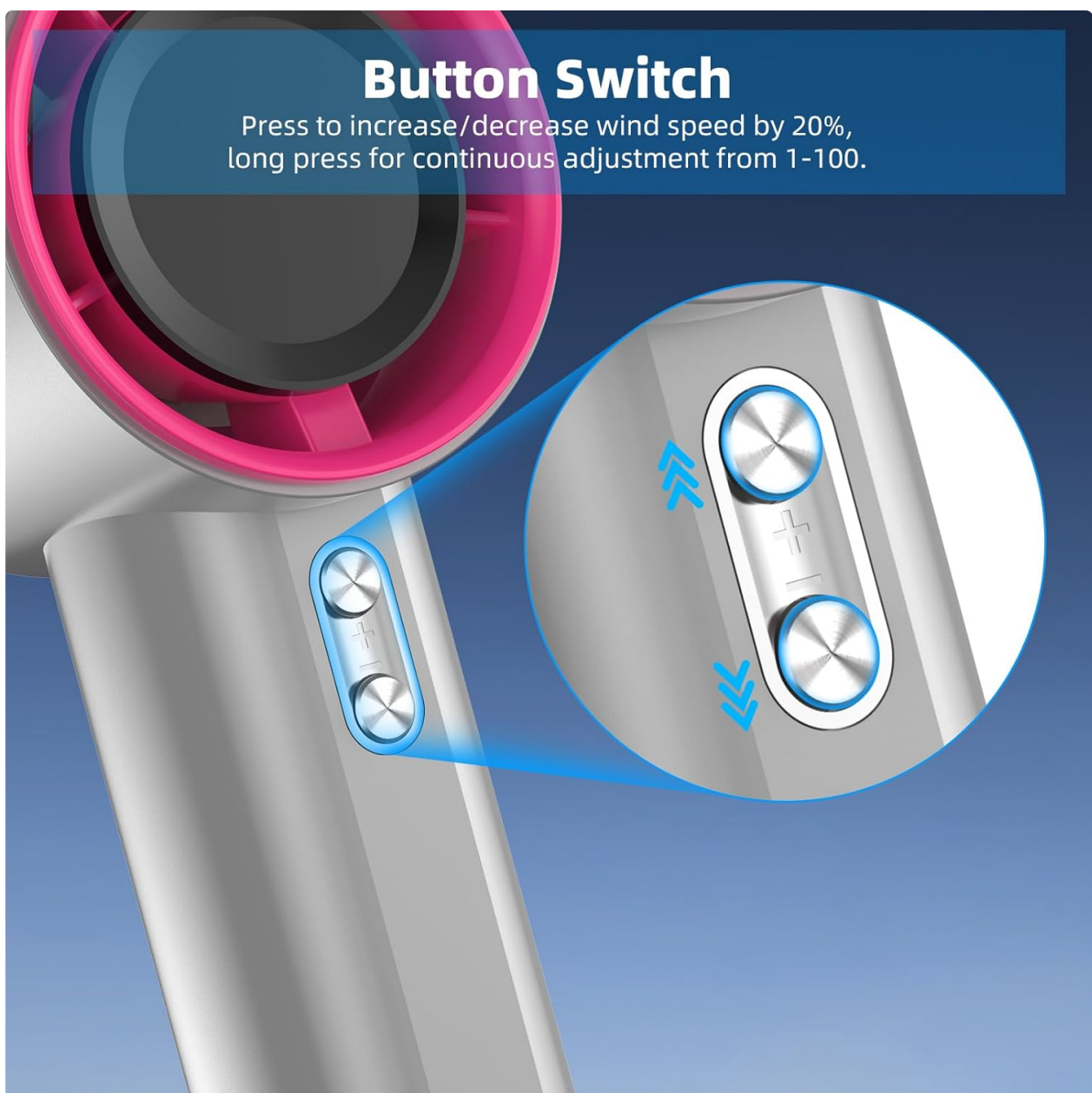
Image: A close-up view of the fan's button switch, showing the 'up' and 'down' arrows for adjusting wind speed. Instructions indicate a short press for 20% adjustment and a long press for continuous adjustment from 1-100.