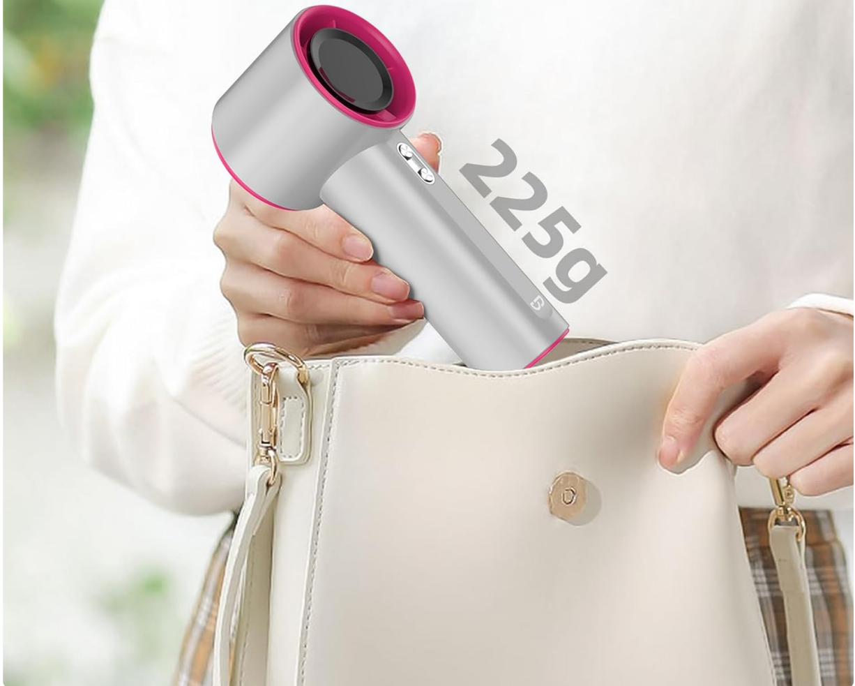
Image: A hand demonstrating the compact and portable nature of the fan by easily placing its 225g body into a handbag, highlighting its convenience for travel.