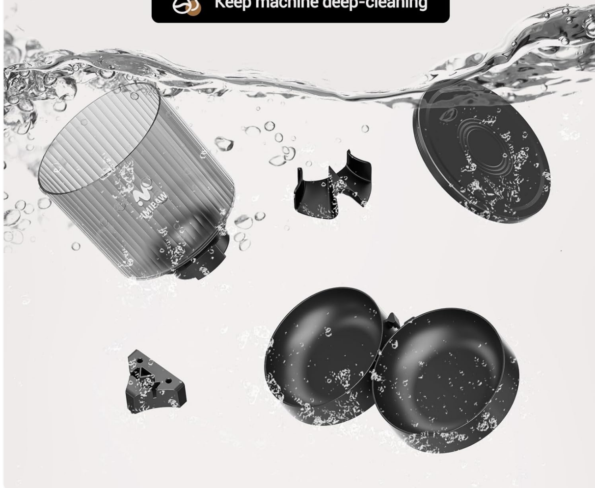
Image 13: The detachable components of the feeder, including the food container, separator, and bowls, can be easily washed for deep cleaning.