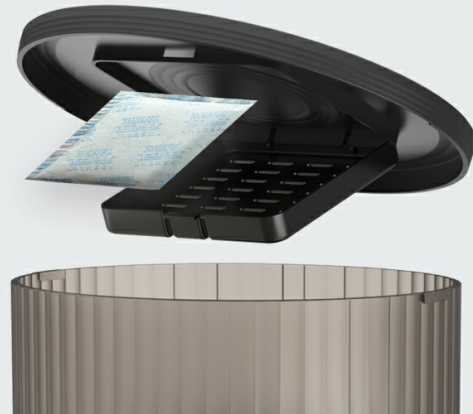
Image 8: The desiccant bag is placed in the lid to absorb moisture and keep the pet food dry and fresh.

Garde les aliments pour animaux secs et frais