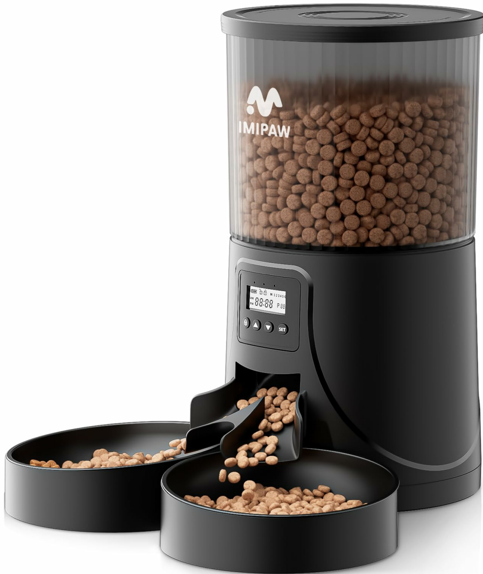
Image 1: The IMIPAW 4L Automatic Pet Feeder, featuring a transparent food container and dual feeding bowls.