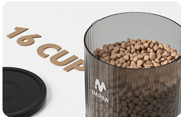
Image 9: The transparent food container allows for easy monitoring of the remaining food quantity. The 4-liter capacity can hold up to 16 cups of food.

Vous pouvez voir la quantité de nourriture restante dans le réservoir. La grande capacité de 4 litres permet de stocker jusqu'à 16 tasses de nourriture.