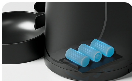
Image 6: The feeder can be powered by a 5V DC adapter or 3 D-cell batteries (not included) for backup. The power cable is designed to be bite-resistant.

Dual Power Supply Guarantees Your Pets Get Food Always