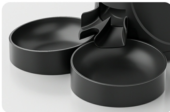
Image 4: The food separator and dual bowls, designed for feeding two pets simultaneously.

Cet ensemble pour 2 animaux est idéal pour nourrir deux animaux de compagnie en même temps.