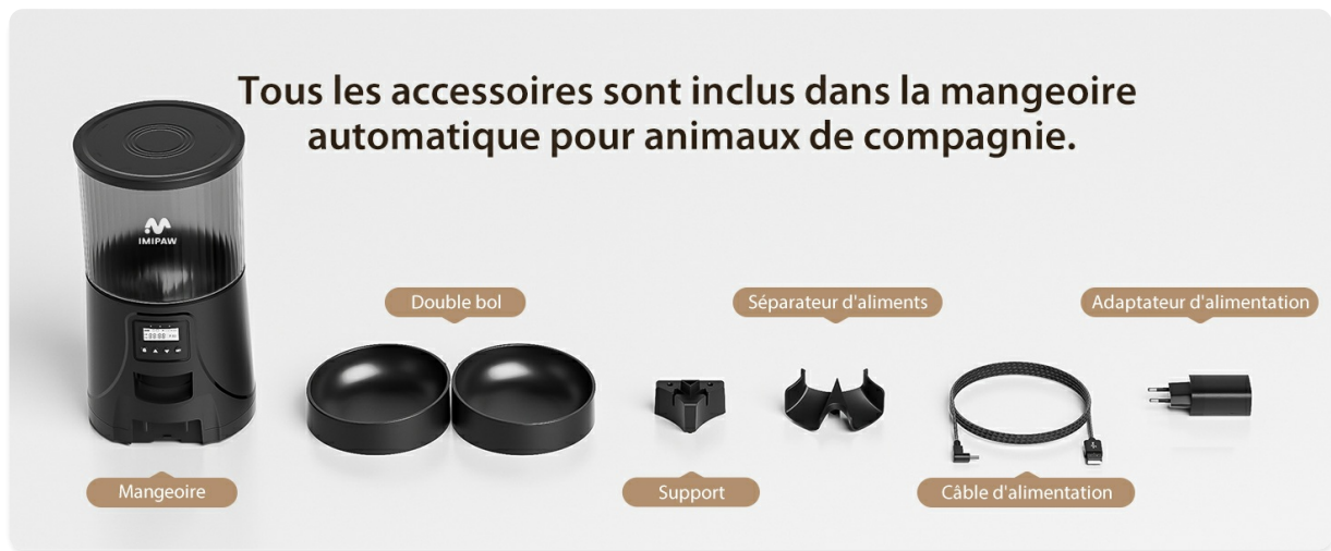
Image 2: An overview of all included accessories: the main feeder, dual bowls, food separator, power cable, and power adapter.