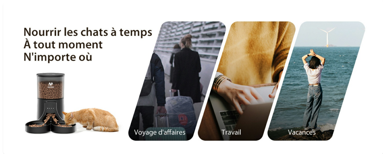
Image 17: The automatic feeder ensures your cats are fed on time, anytime, anywhere, providing peace of mind during business trips, work, or vacations.

Customer Support: For assistance, please email us. Our team is available to provide friendly support.