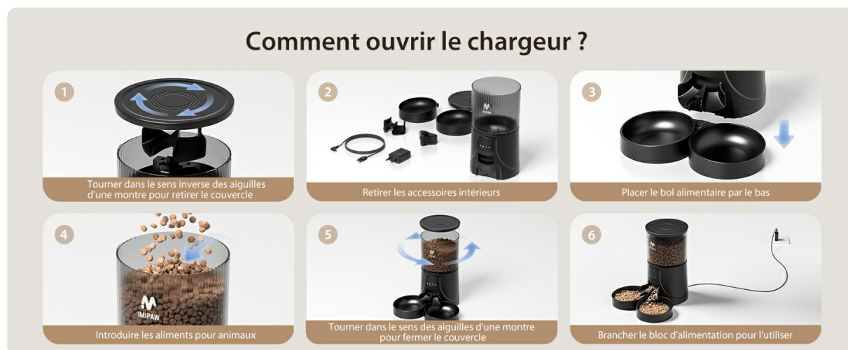
Image 5: Visual guide for initial setup: removing the lid, inserting internal components, placing bowls, adding food, securing the lid, and plugging in the power.