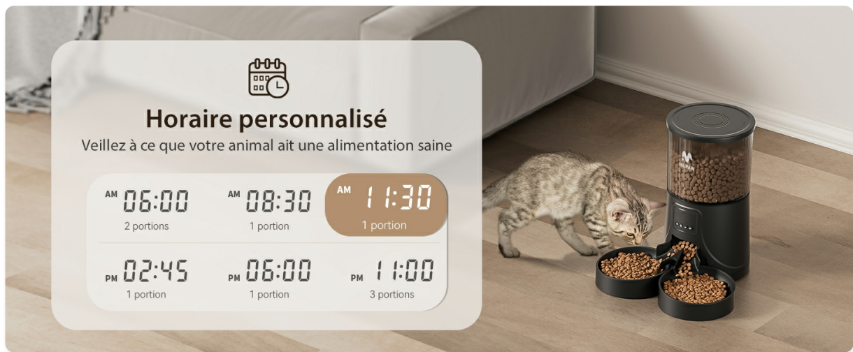
Image 12: A visual representation of a customized feeding schedule, demonstrating how different meal times and portion sizes can be set to maintain a healthy diet for your pet.