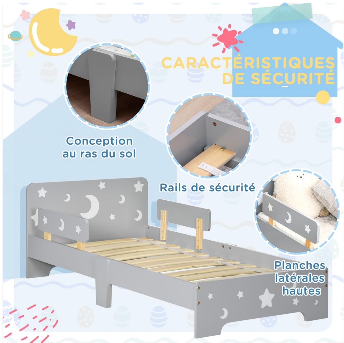
Image 2.1: Safety features of the bed, including low design and side rails.