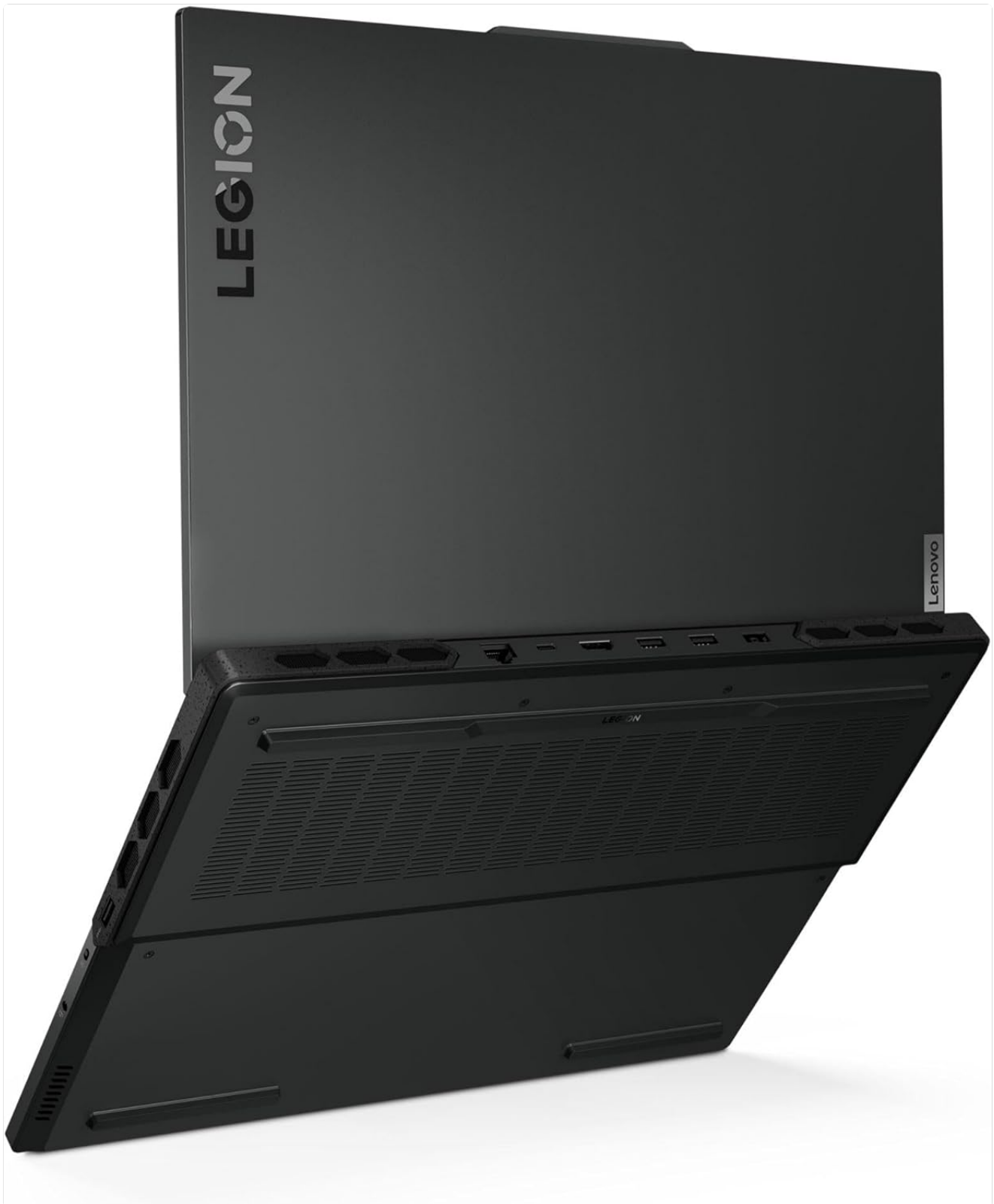
Figure 5: Bottom view illustrating the cooling system.