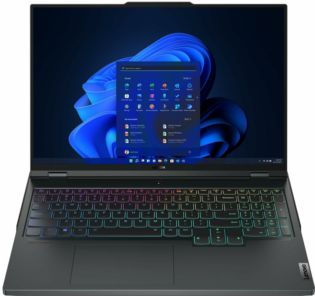
Figure 1: Front view of the Lenovo Legion Pro 7 Gen 8 Gaming Laptop.