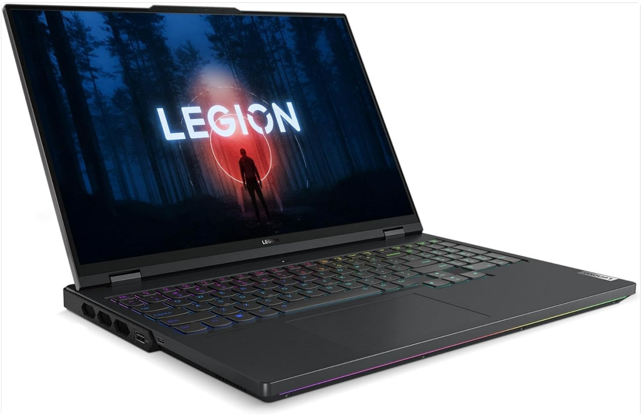
Figure 2: Angled view of the Lenovo Legion Pro 7 Gen 8.