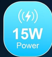
Image: The HUABAO Karaoke Machine emphasizing its superior Hi-Fi sound quality with a 6.5-inch subwoofer and 15W power output.