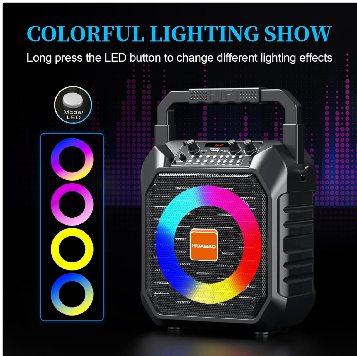
Image: The HUABAO Karaoke Machine displaying its colorful LED lighting show, which can be adjusted by pressing the Mode/LED button.

The speaker features dynamic LED lights that sync to the music. Long press the "Mode/LED" button to change different lighting effects or turn them off.