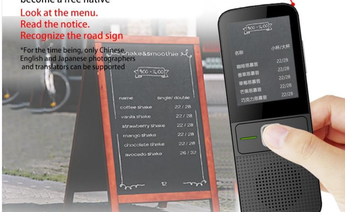
Figure 1: Overview of T10 Translator's core features including language support, connectivity, and input methods.

Immediate translation as soon as the picture is taken