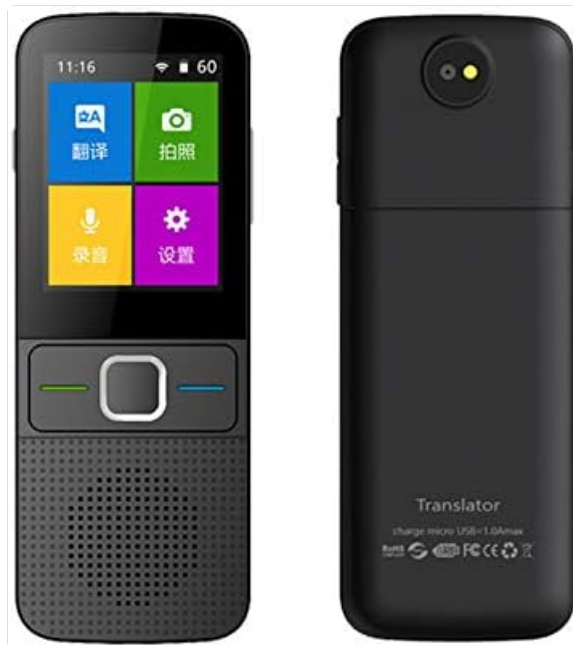
Figure 2: Front and back view of the T10 Intelligent Voice Translator.