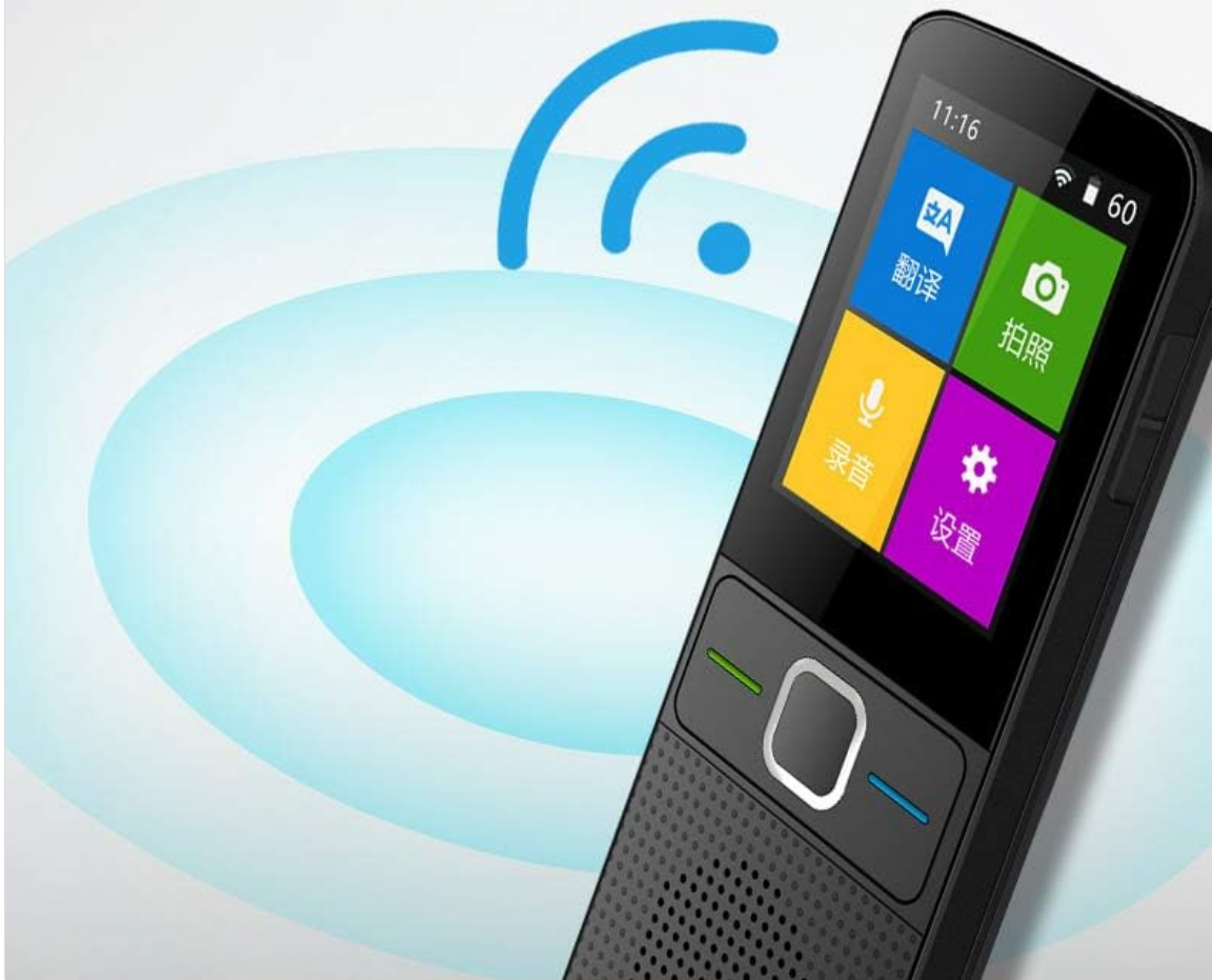
Figure 3: Wi-Fi connection interface on the T10 Translator.

Easy WiFi connection, follow you around the world