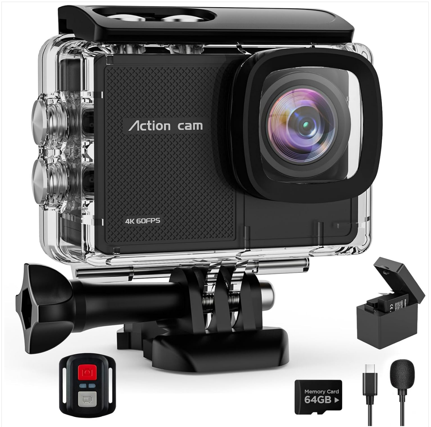
Image: The Yolansin 4K Action Camera A16 shown with its included accessories, including the waterproof case, remote control, 64GB SD card, and batteries.