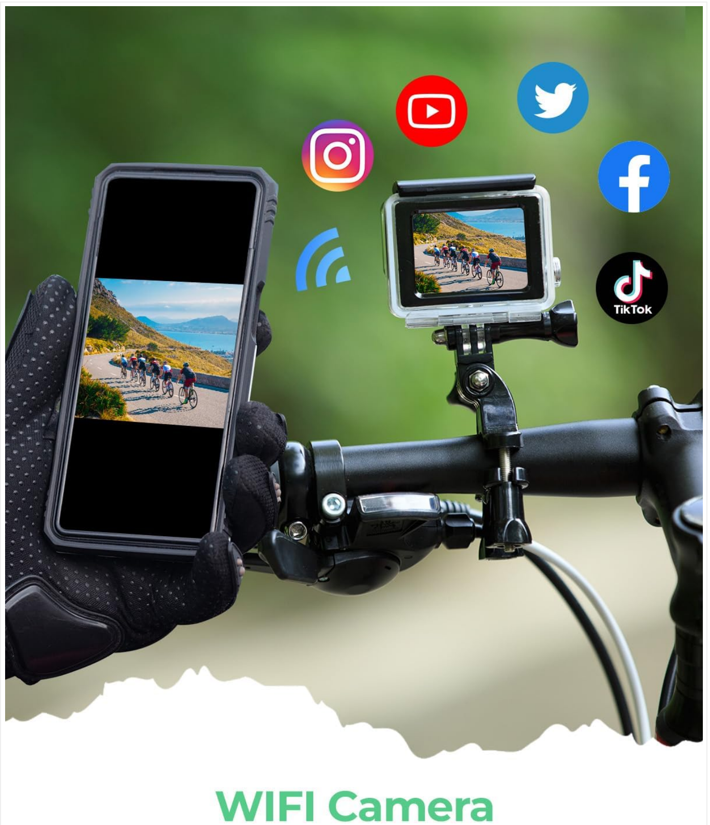
Image: The Yolansin Action Camera A16 mounted on a bicycle handlebar, with a smartphone displaying the camera's live view, illustrating Wi-Fi connectivity.