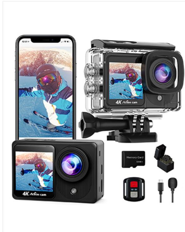
Image: Two 1350mAh batteries for the Yolansin Action Camera A16, indicating longer usage time.