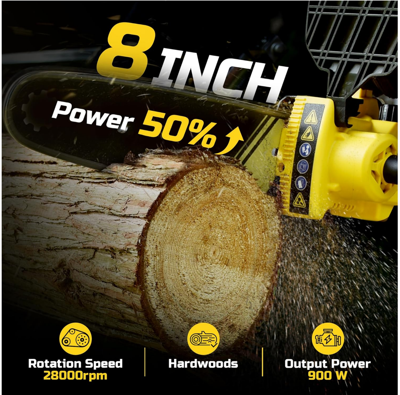
Image: The chainsaw in action, demonstrating its cutting capability on a log.