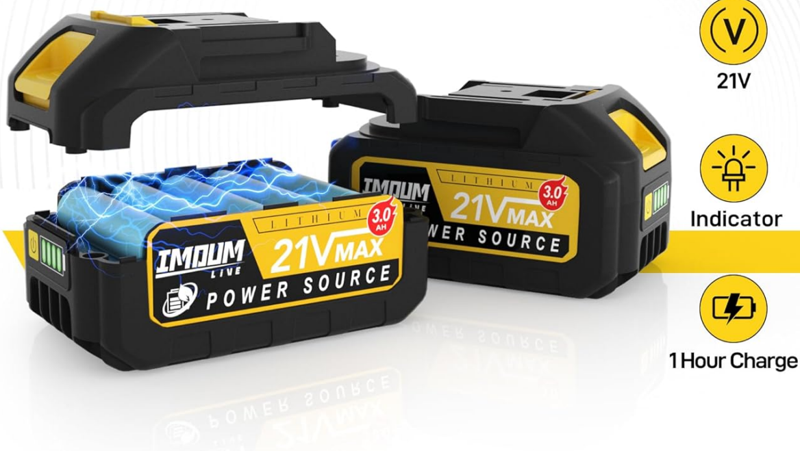
Image: The 3.0Ah batteries, indicating their capacity and charging time.

3.0 Ah ADVANCED BATTERIES HOLDS POWER FOR UP TO 120 MIN IN WORK