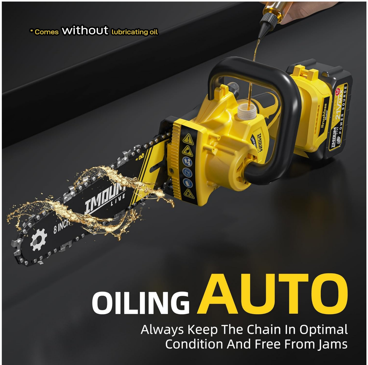
Image: Demonstrating the process of adding lubricating oil to the chainsaw's auto-oiling system.