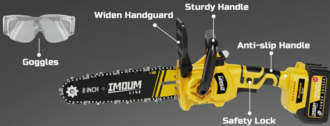
Image: Safety features of the IMOUM LIVE mini chainsaw, highlighting the goggles, handguard, handles, and safety lock for user protection.