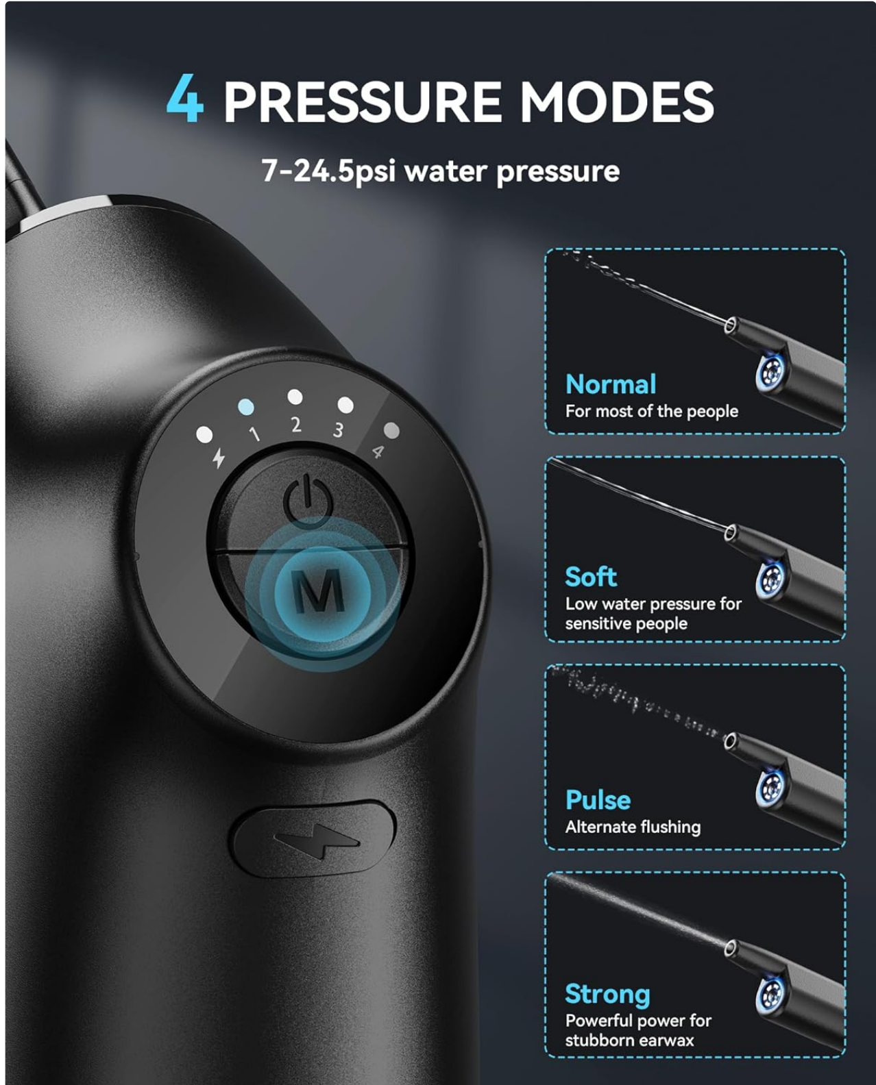
Image: A detailed view of the device's control panel, highlighting the four pressure settings and their corresponding icons.