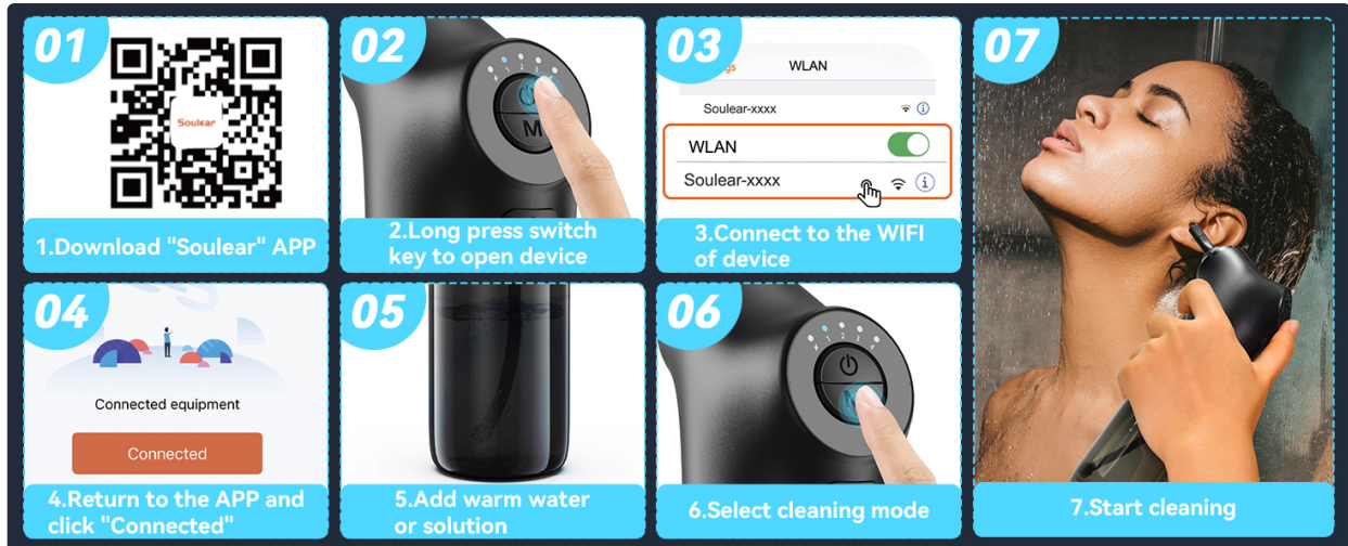
Image: Step-by-step guide for downloading the Soulear app via QR code and connecting the device's Wi-Fi.