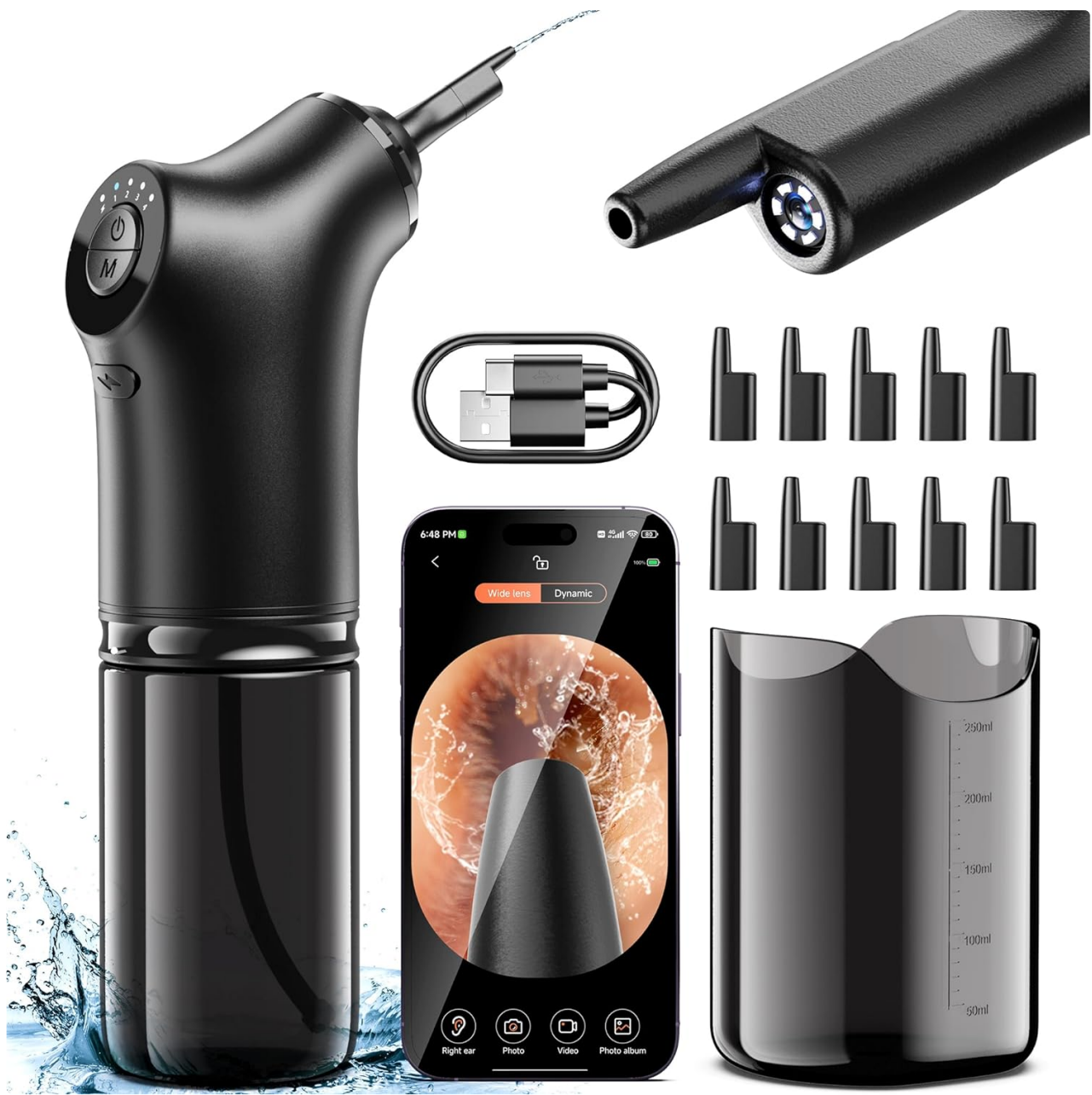
Image: The KAUGIC Smart Ear Wax Removal Tool Camera, showcasing its main unit, water tank, various nozzles, USB charging cable, and the accompanying smartphone app interface.