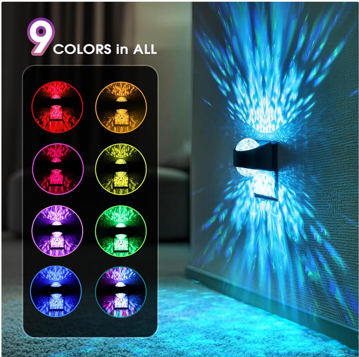
Image: Visual representation of the 9 distinct color modes available on the Briignite IP207 night light.

Video: A demonstration of the Briignite IP207 RGB Star Projector Night Light in action, showcasing its various color modes and dynamic light patterns.