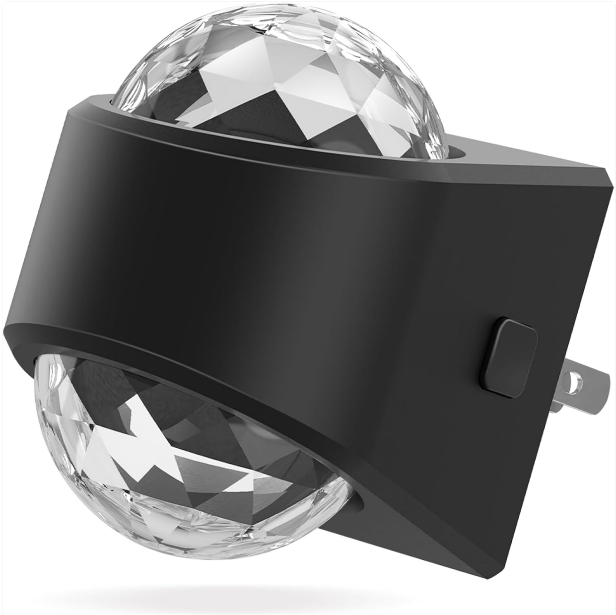
Image: Close-up view of the Briignite IP207 RGB Star Projector Night Light, highlighting its faceted dome and compact design.