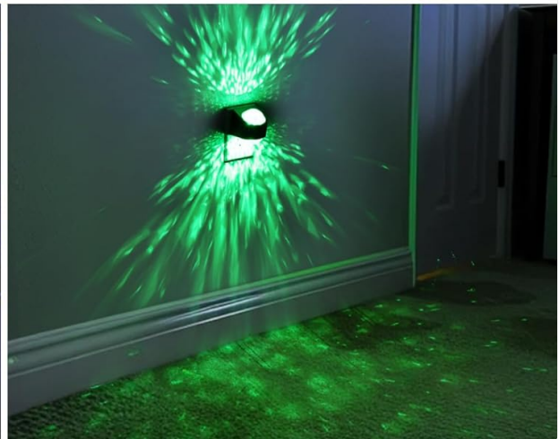
Image: The night light installed in a gaming room, demonstrating its up and down projection capabilities and vibrant RGB effects.