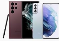
Samsung Galaxy Series