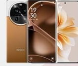
Other Android Cellphones