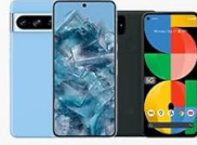
Google Pixel Series