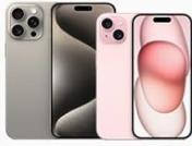
iPhone 15 Series