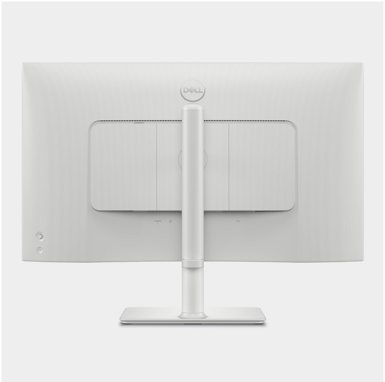
Figure 6: Cable management features on the monitor stand.