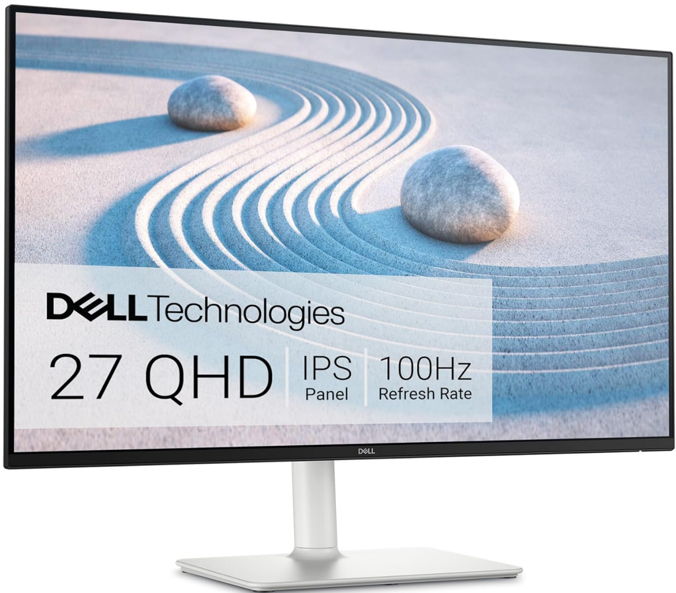
Figure 1: Front view of the Dell S2725DS Monitor.