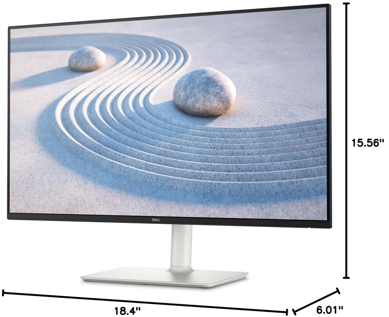
Figure 13: Monitor dimensions.