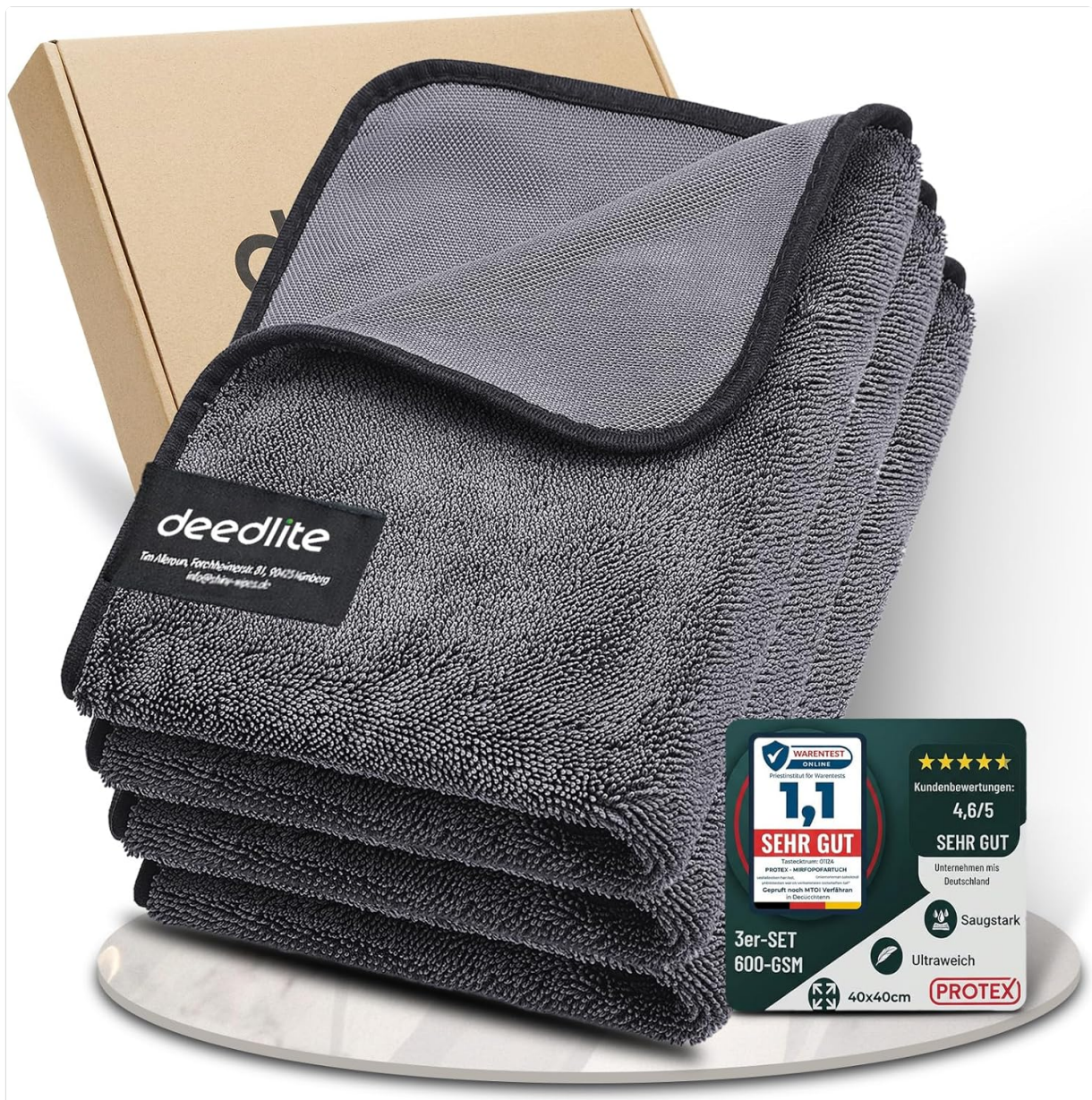
Image 1: Deedlite Microfiber Cleaning & Drying Towels, folded for storage.