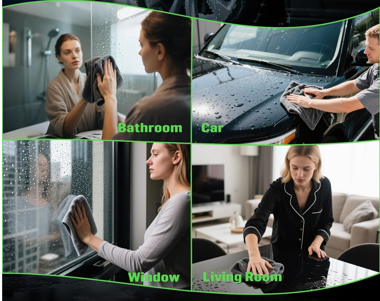
Image 4: Various applications of the microfiber towel in different settings, including bathroom, car, windows, and living room.

Video 2: A short demonstration showcasing the towel's super absorbent and quick-drying properties on a car surface.