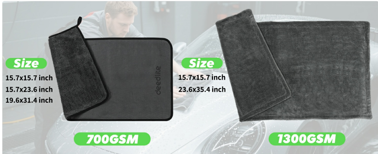
Image 3: Demonstrating the streak-free drying capability on a car hood.

For car drying, use the twisted-loop side of the towel. Its ultra-absorbent nature allows for a single-pass drying method, effectively removing water without leaving streaks or water spots. The soft, edgeless design is safe for all paint finishes, waxed surfaces, and delicate glass.