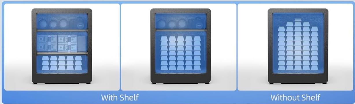
Figure 5.2: Removable Shelf for versatile interior organization. This image demonstrates the flexibility of the safe's interior with two adjustable shelves, allowing users to customize storage space for different items.