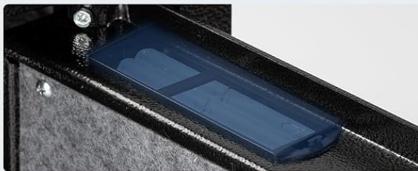
Built-in Battery Box