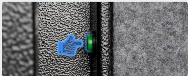
Passcode Reset Button