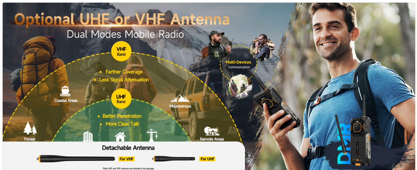
Image: Ulefone Armor 26 Ultra showcasing its dual-mode mobile radio, one-key walkie-talkie function, and the use of optional UHF or VHF antennas for different communication ranges.

Your browser does not support the video tag.