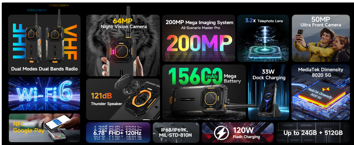
Image: Ulefone Armor 26 Ultra's 15600mAh powerful battery, showcasing 120W flash charging, 33W fast dock charging, and reverse charging capabilities.