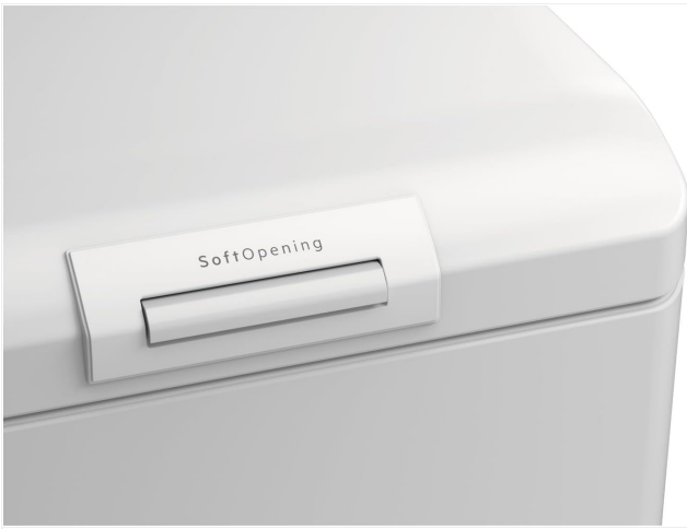
Soft Opening Lid: Provides easy and safe access to the drum with a gentle opening mechanism.