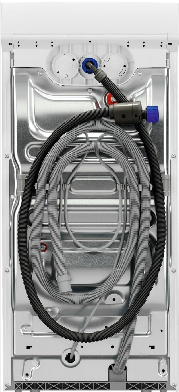
Rear Connections: Inlet and outlet hoses for water supply and drainage, and power cable connection.