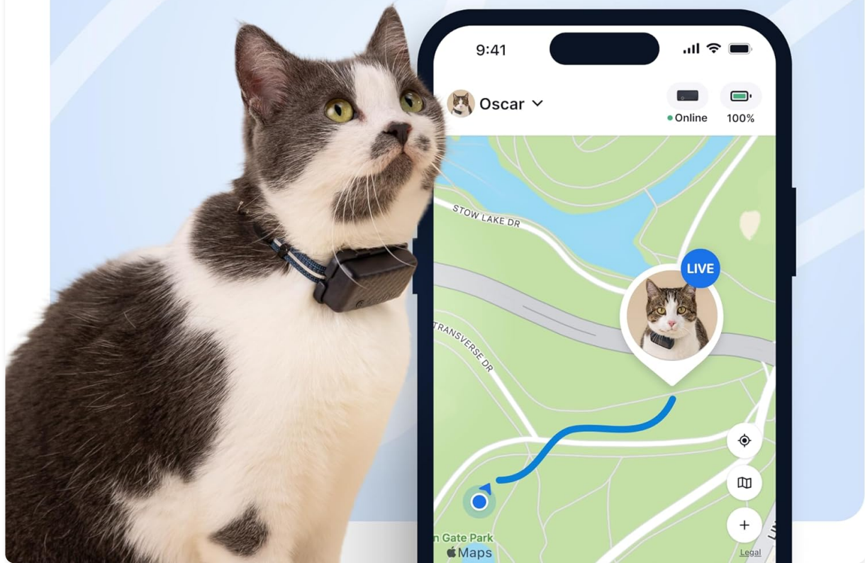
Image 3.1: Real-time GPS tracking feature displayed on the Tractive app.

Track your cat's location live with no distance limits