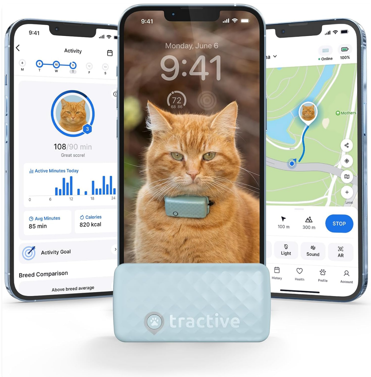
Image 1.1: Tractive Cat Mini GPS Tracker and its mobile application interface.