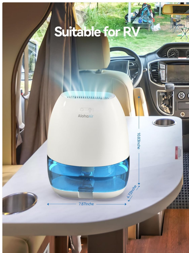
Figure 4.2: Portable design allows for use in various settings, including RVs.