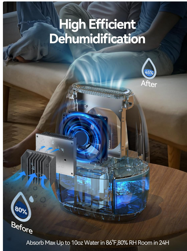
Figure 3.1: High-efficiency dehumidification process with internal components visible.