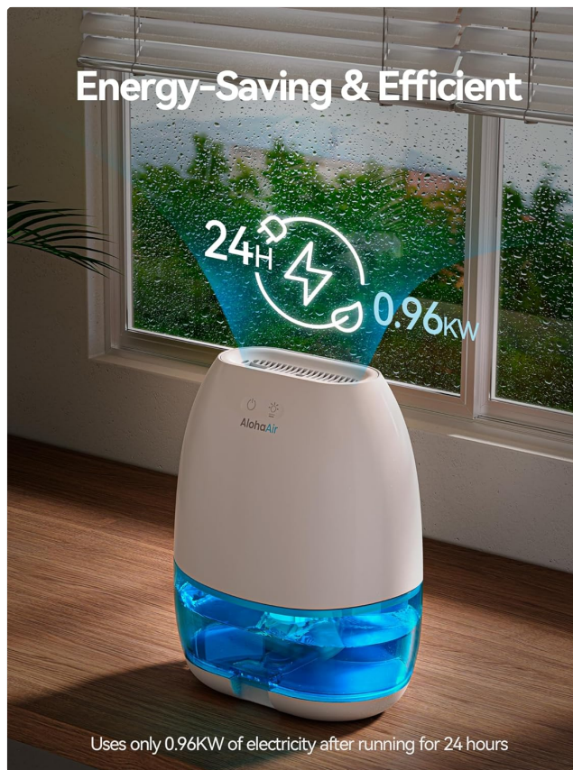
Figure 4.1: Optimal placement for energy efficiency.