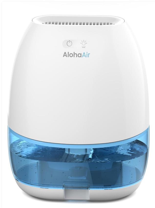
Figure 5.1: AlohaAir Dehumidifier control panel.