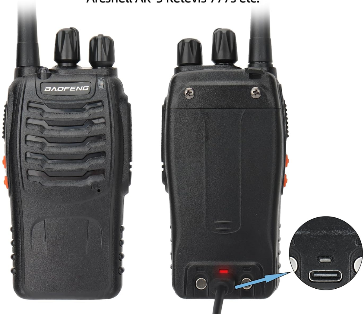
Image: A Baofeng walkie-talkie demonstrating the compatibility and fit of the BL-1 Type-C battery.

Baofeng BF-888S, Arcshell AR-5, Pxton PX-888S, Arcshell AR-5 Retevis 777s etc.