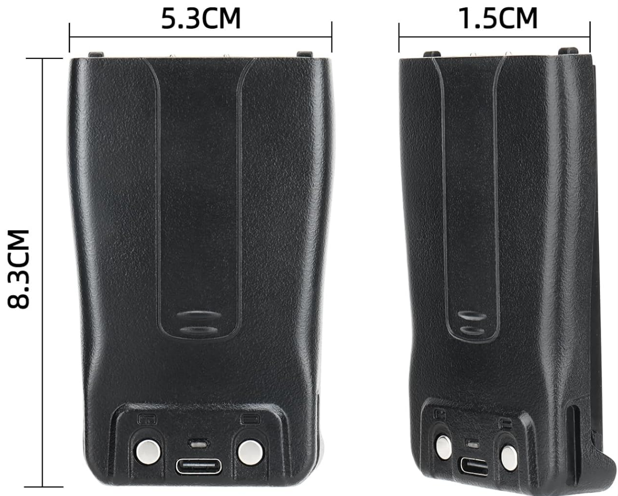
Image: Detailed dimensions of the battery, indicating a height of 8.3 CM, width of 5.3 CM, and thickness of 1.5 CM.