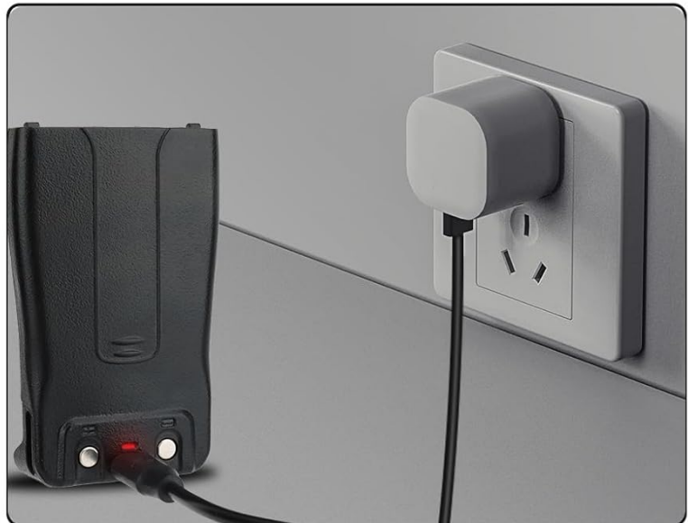
Image: Visual guide demonstrating different power sources for Type-C USB charging, including car chargers, personal computers, power banks, and wall sockets.