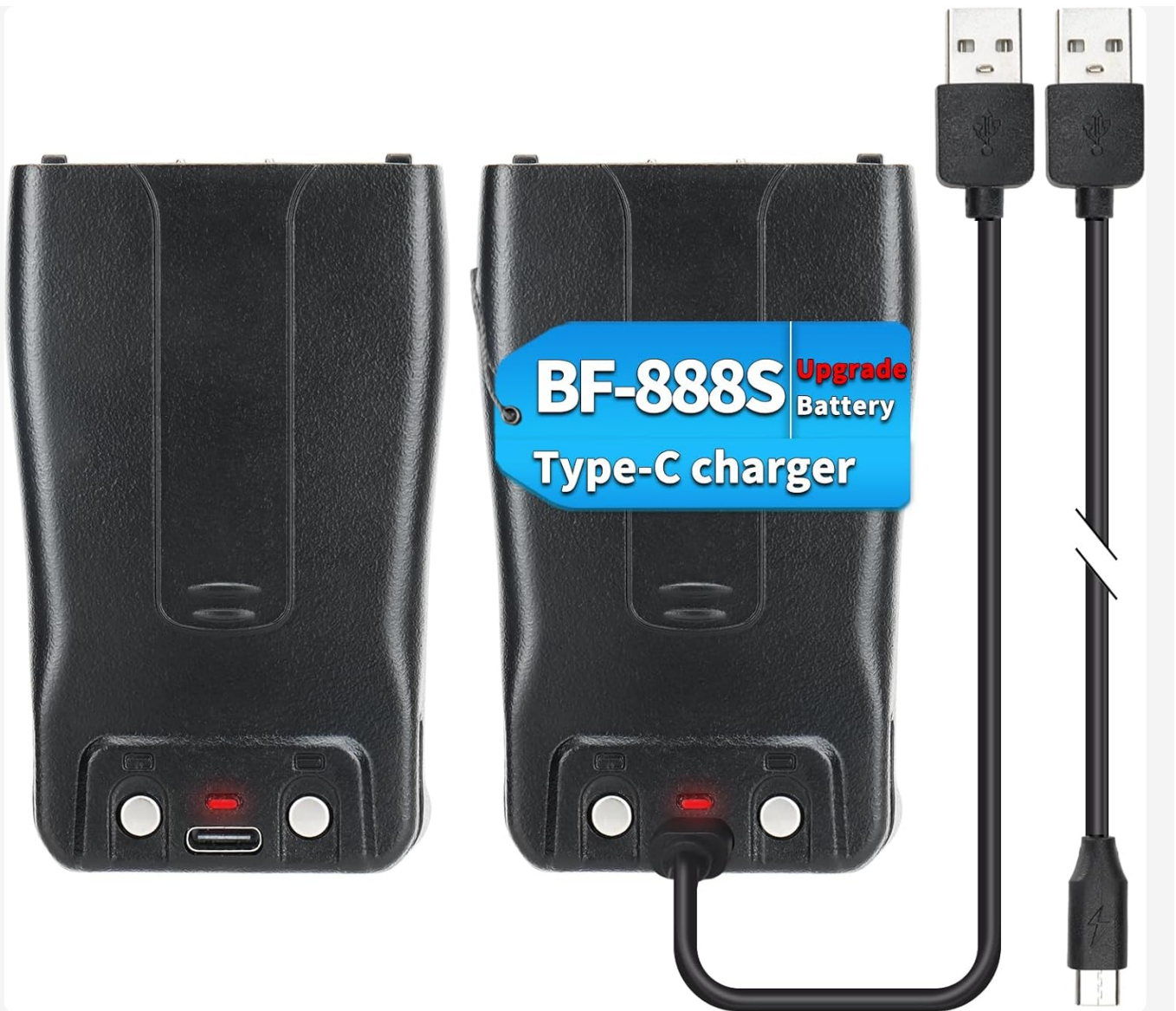
Image: Two Baofeng BF-888S upgrade batteries with Type-C charging ports, one shown connected to a USB Type-C cable.