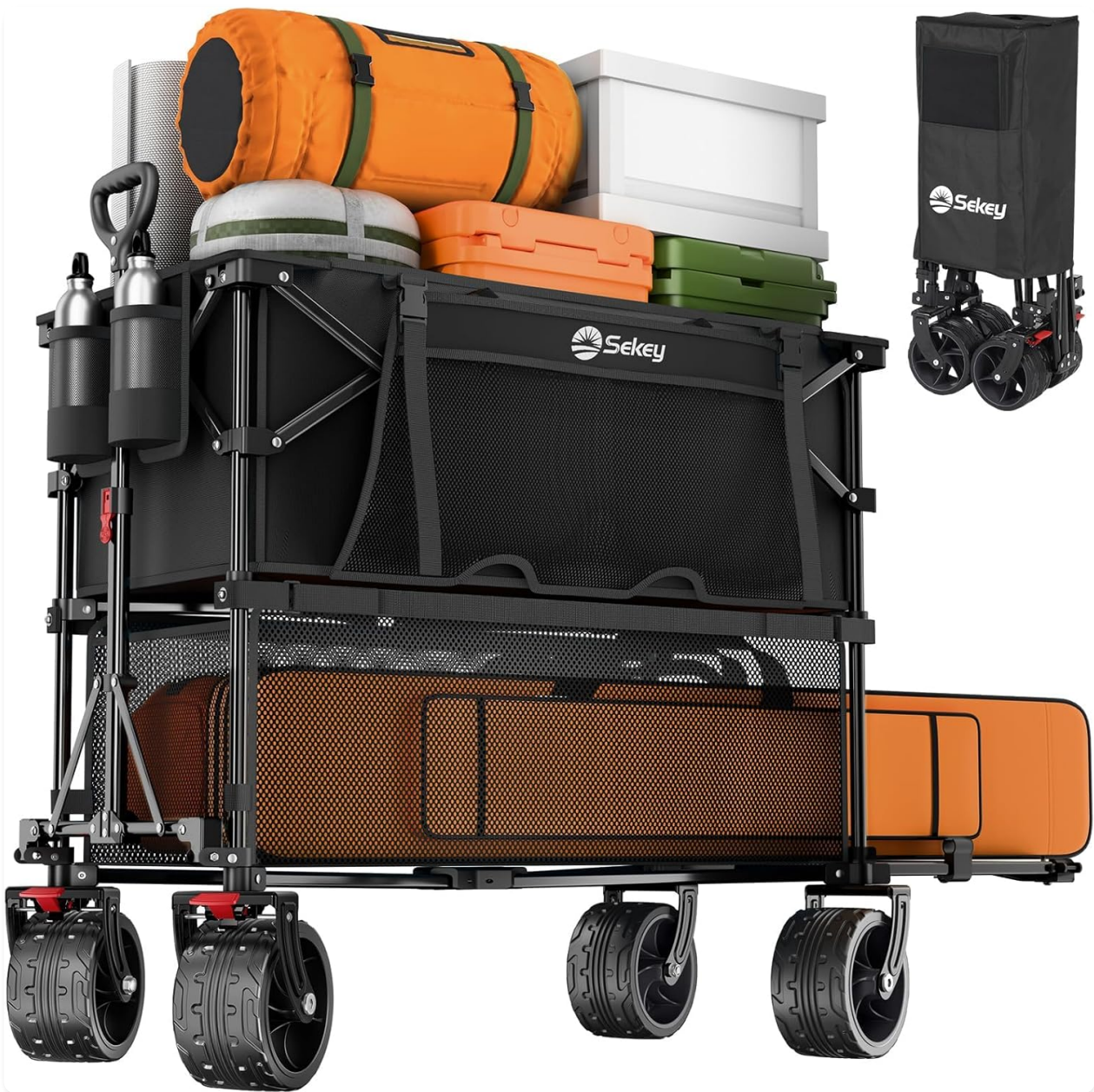
Figure 1: The Sekey Heavy Duty Double Decker Folding Wagon, showcasing its robust design and spacious upper compartment.