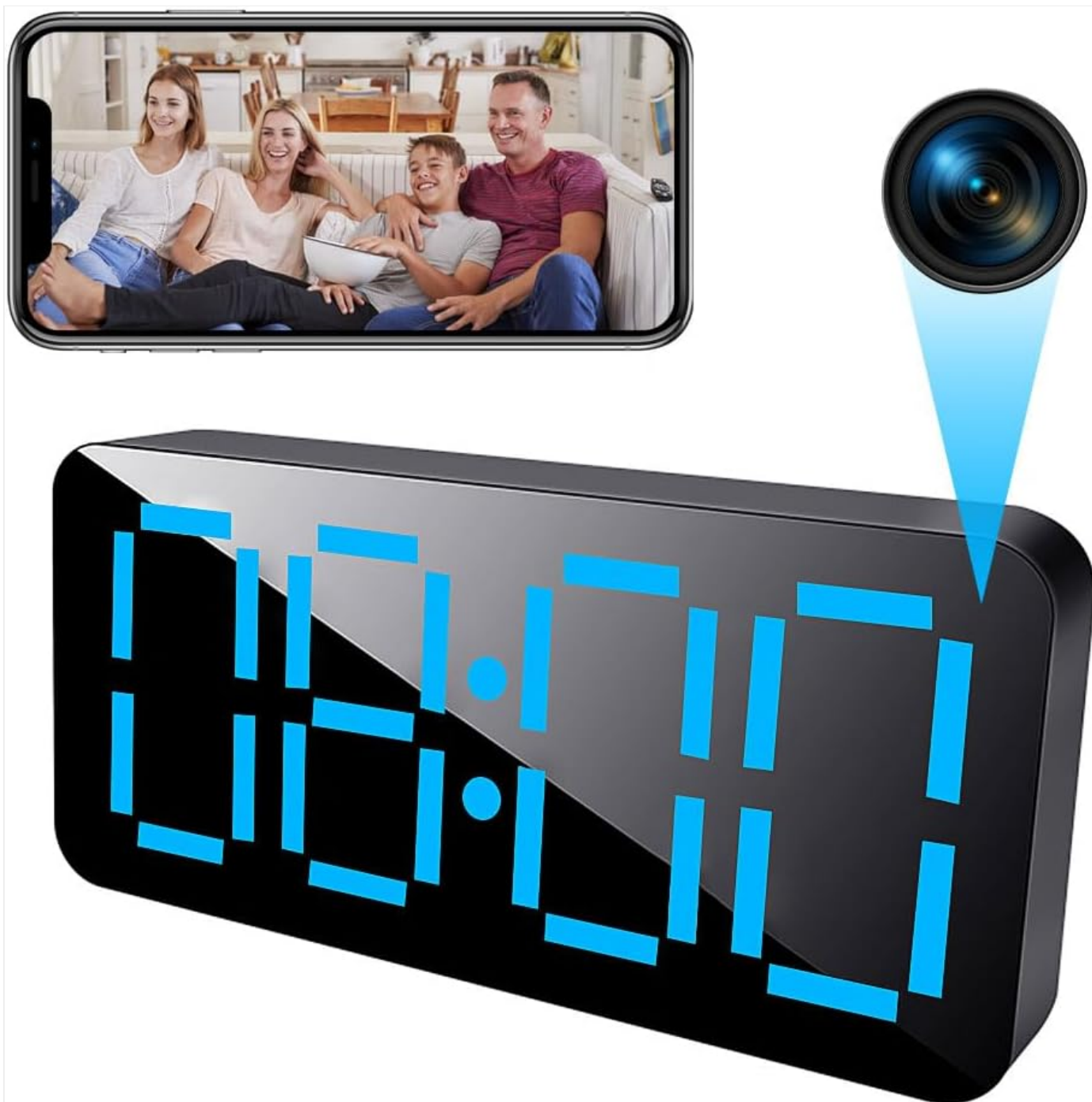
Image: Front view of the Kestanlora WiFi HD 1080P Wireless Clock Camera, showing the digital time display and the integrated camera lens.