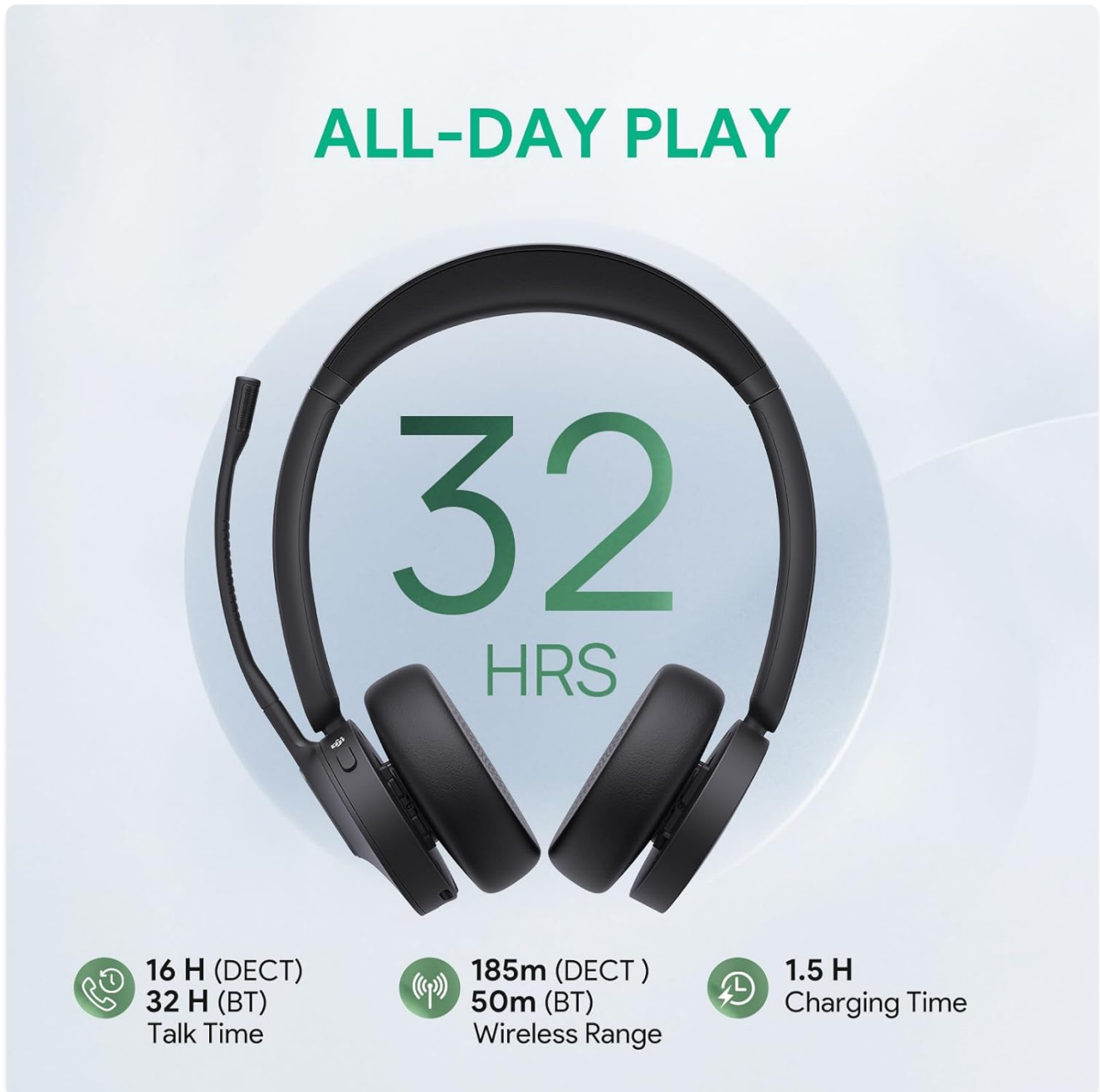
Figure 6: Battery life and charging time details for the headset.

To charge the headset, dock it to the WHB640 base. Alternatively, you can connect a Type-C USB cable directly to the headset for charging.