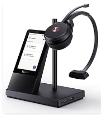
Figure 4: Key function guide for the headset controls.