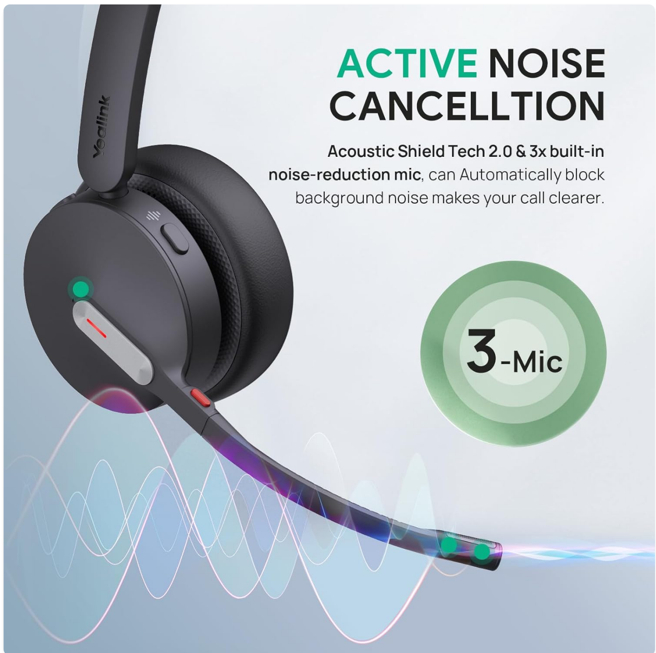
Figure 3: The headset's active noise cancellation features, highlighting the 3-mic system.