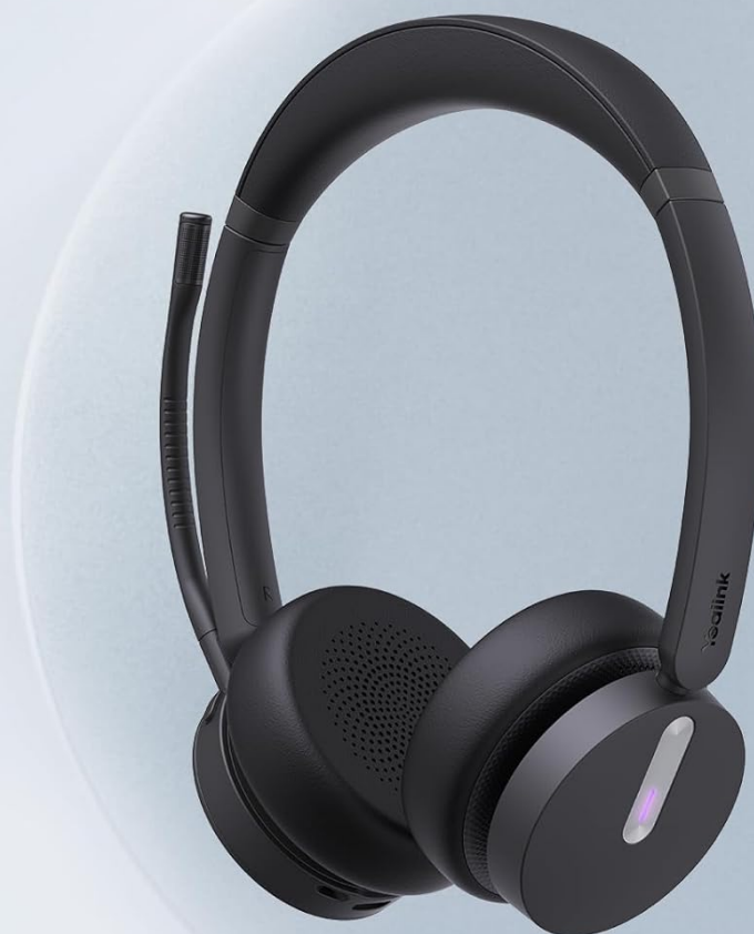
Figure 1: Package contents of the Yealink WH64 headset.