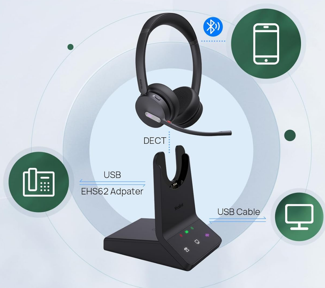
Figure 2: The WH64 headset's all-in-one workstation setup, connecting to PC, phone, and mobile.

Plug & Play Headset easy to Multi-Devices Connection and Multi-scenario application