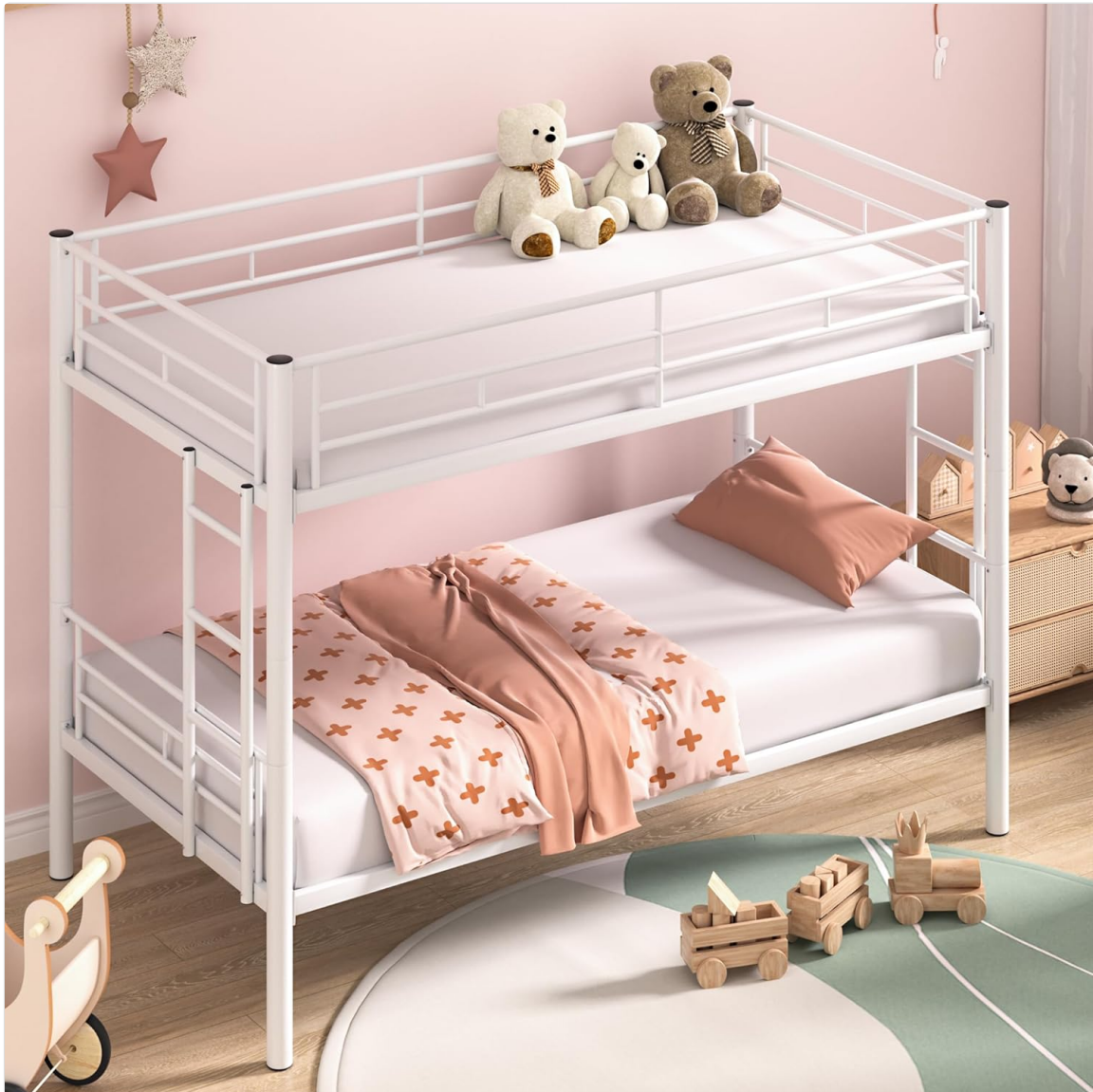
Image: The VEGELO Metal Twin Over Twin Bunk Bed in an off-white finish, set up in a room with pink and white bedding, showcasing its functional design.