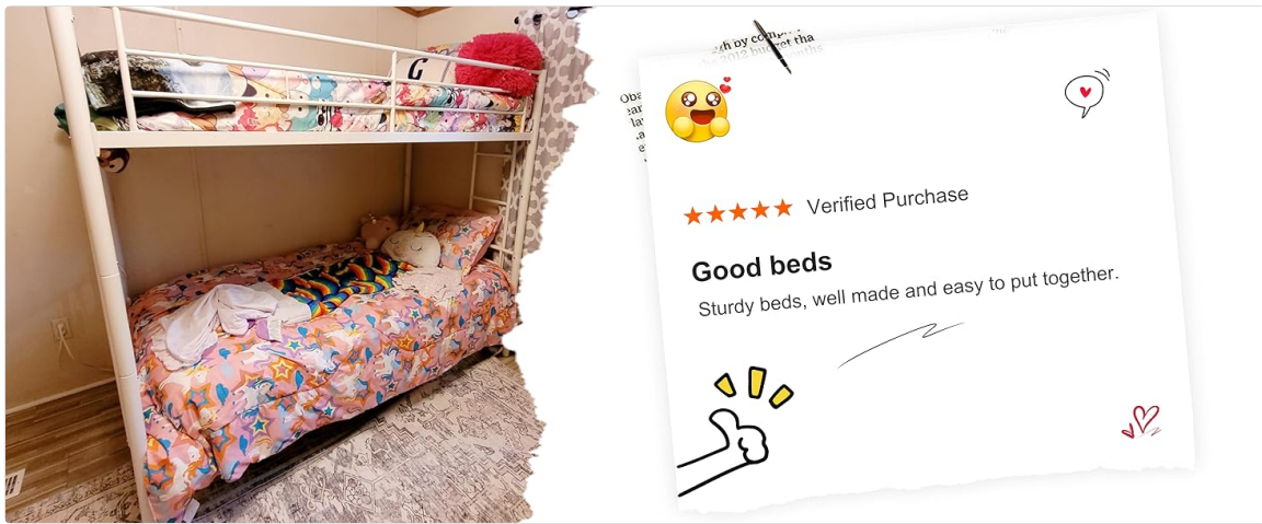
Image: A visual summary of the VECELO Bunk Bed's specifications and key features, including dimensions, material, and weight capacity.