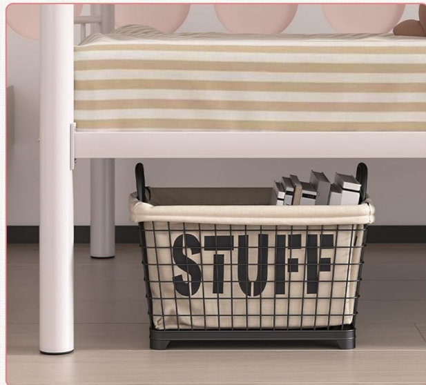
Image: Illustration of the VECELO Bunk Bed's headboard and footboard design, which prevents mattress sliding, and the ample 13-inch under-bed storage space.

A 13-inch height provides ample space for storing sundries.