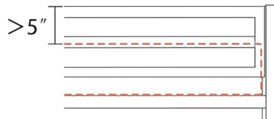
Image: Detailed diagram illustrating the dimensions of the VECELO Metal Twin Over Twin Bunk Bed, including height, length, and width, along with mattress thickness recommendations.

The mattress surface of the upper bed must be at least 5"(127mm) below the top edge of the guardrail.