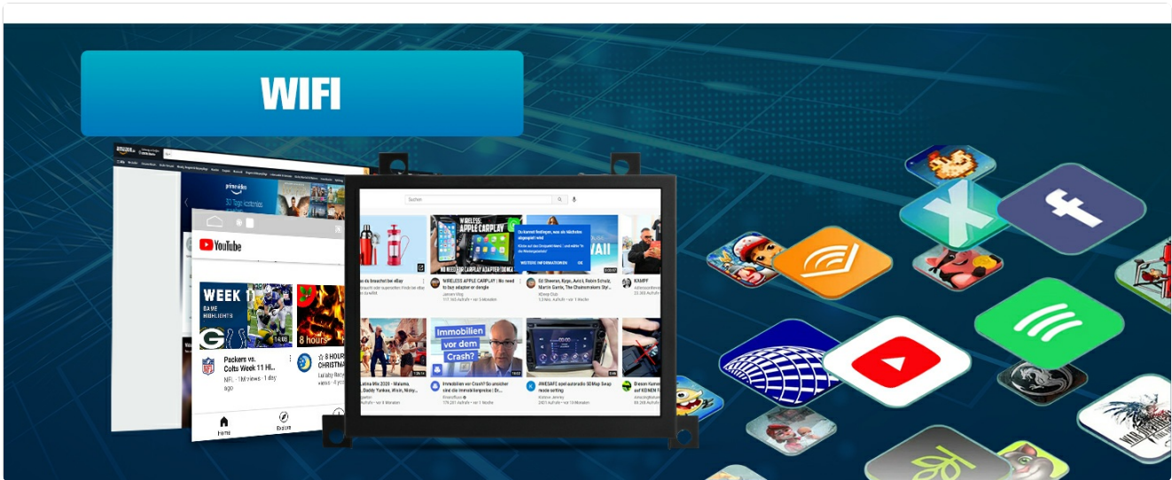
Figure 5.6: WiFi connectivity and access to Android applications.