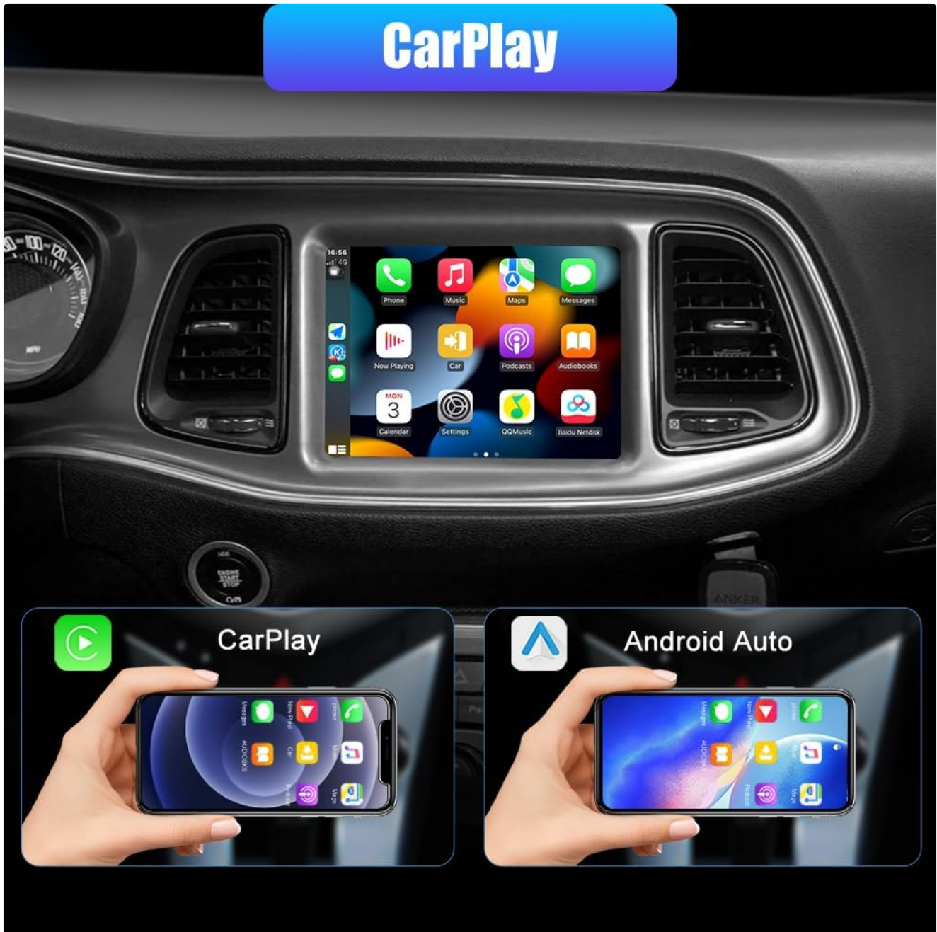
Figure 5.2: Wireless CarPlay functionality.