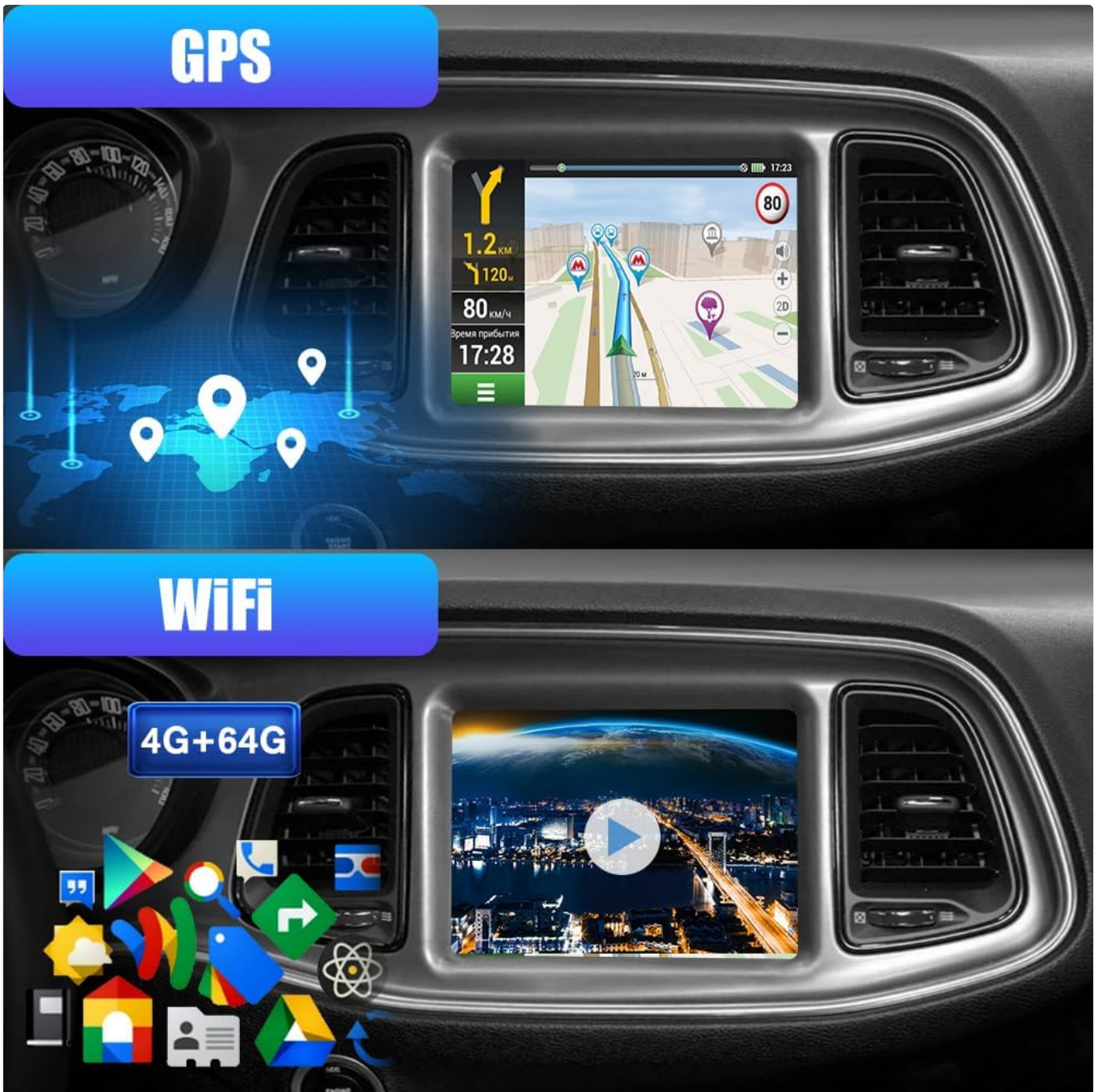
Figure 5.4: GPS navigation and WiFi connectivity.