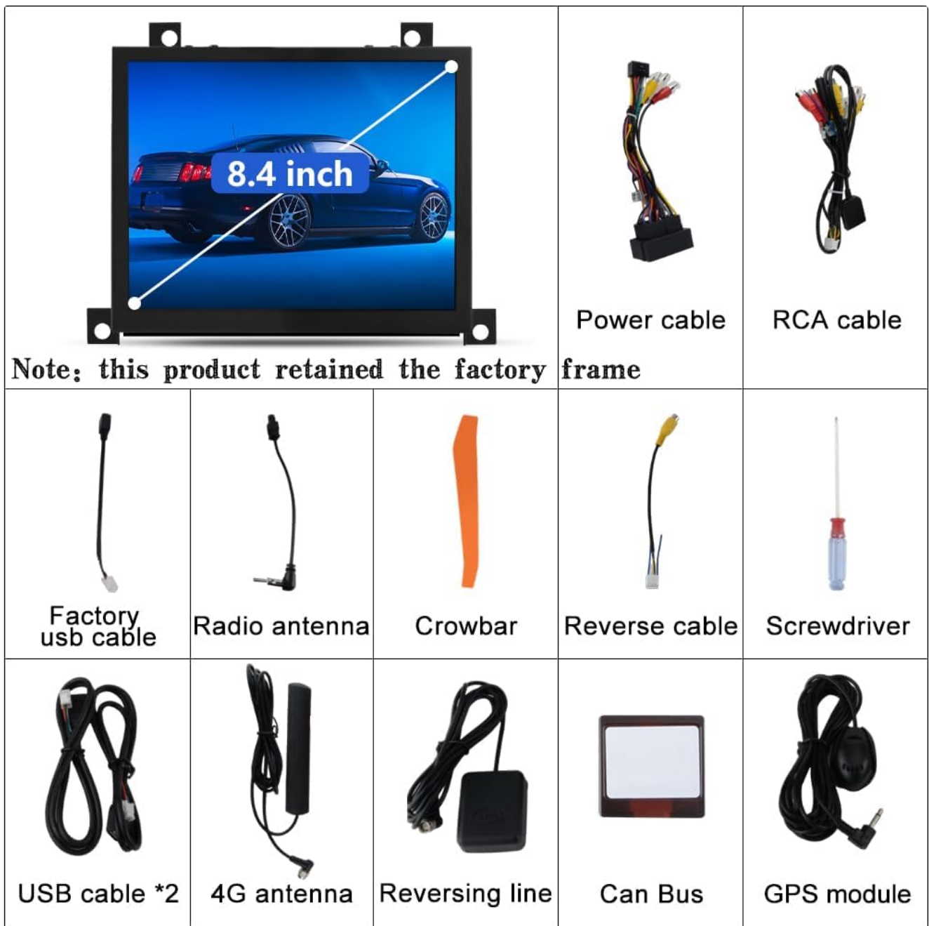
Figure 3.1: Included components in the AWESAFE car stereo package.