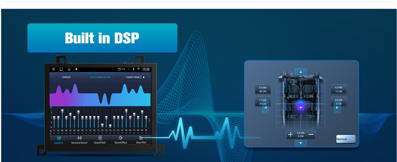
Figure 5.9: Built-in DSP for optimized sound.