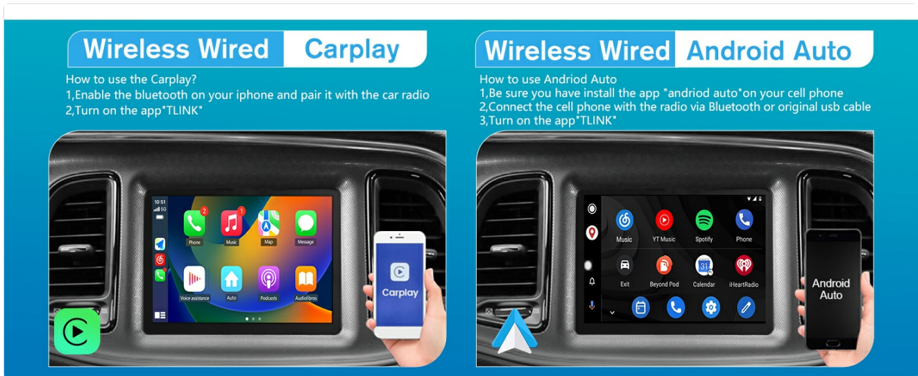
Figure 5.3: Detailed instructions for connecting CarPlay and Android Auto.