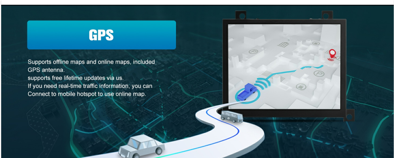
Figure 5.5: GPS features and online map access via mobile hotspot.