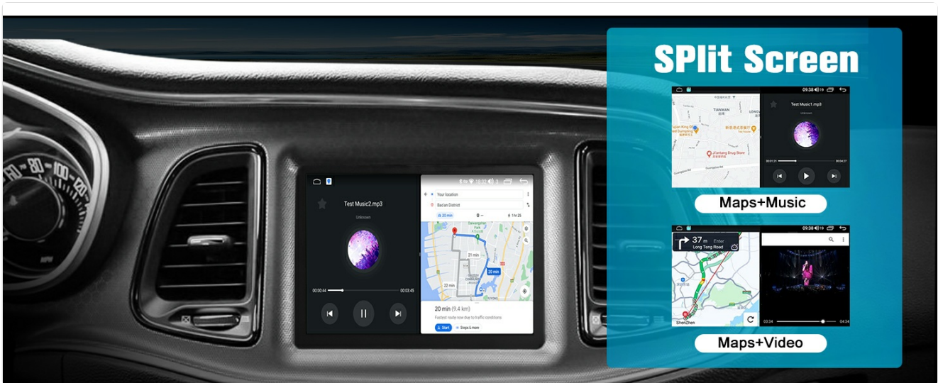
Figure 5.11: Split screen functionality for multitasking.