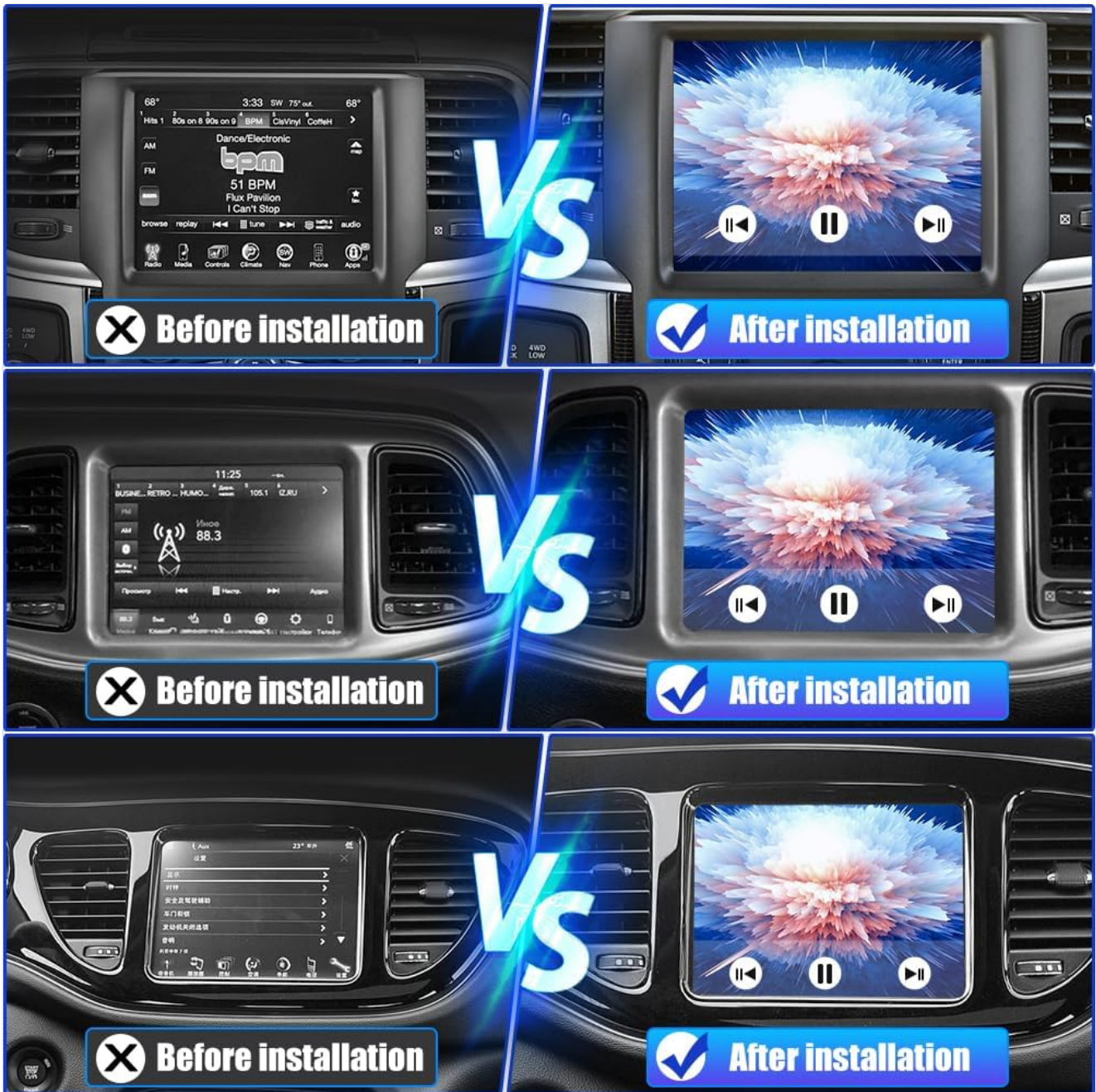
Figure 4.3: Visual comparison of the car's interior before and after the stereo upgrade.