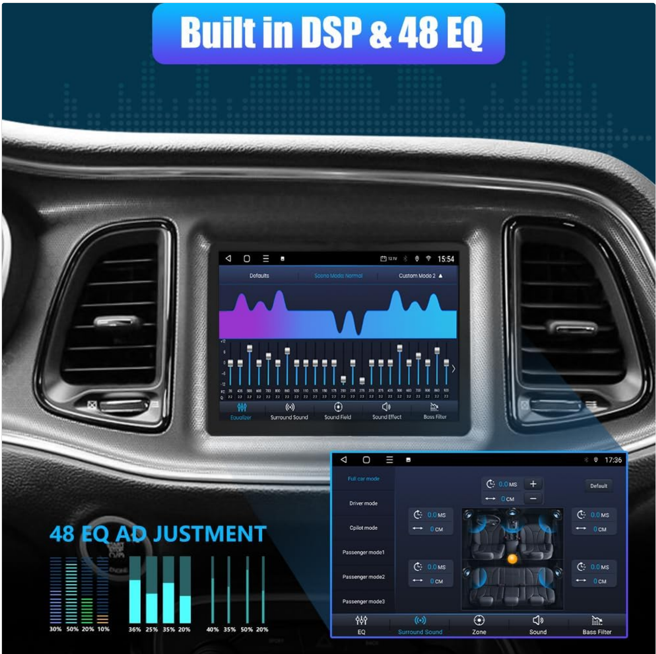
Figure 5.8: DSP and 48-band EQ interface for sound customization.