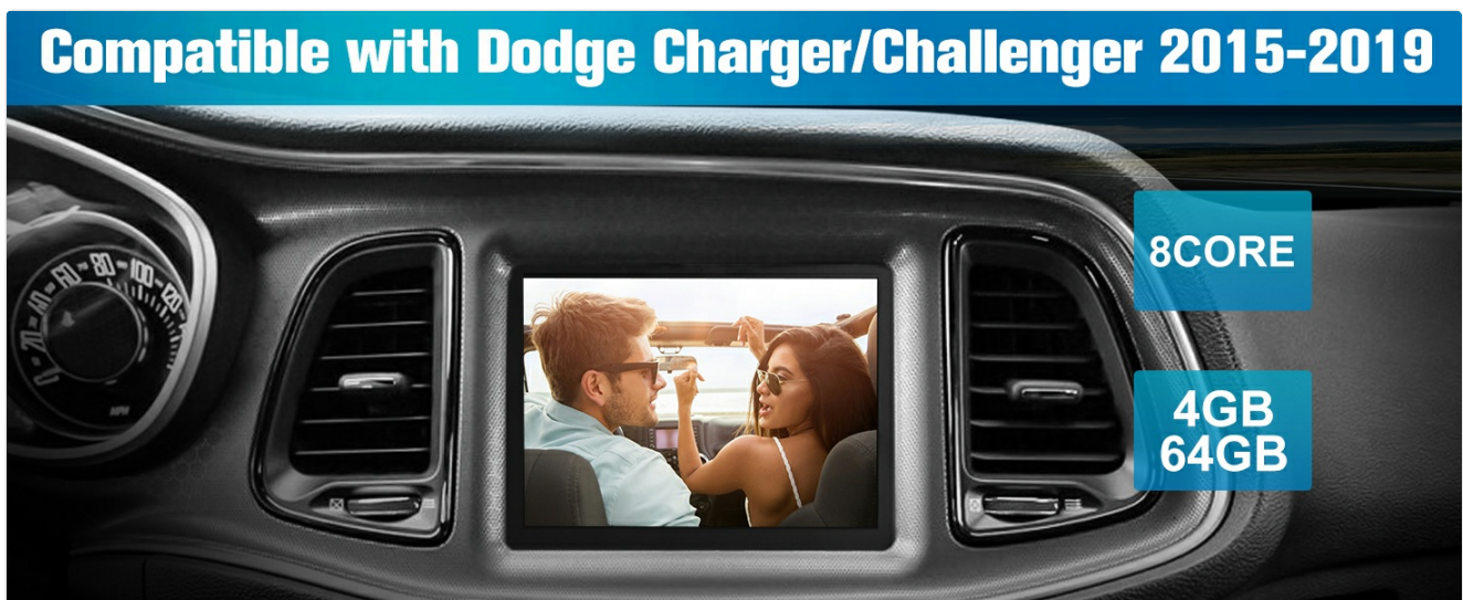
Figure 4.2: Dashboard area of compatible Dodge Charger/Challenger models (2015-2019).

Carefully use a pry tool to remove the dashboard trim surrounding the existing head unit. This will expose the old head unit and its connections.