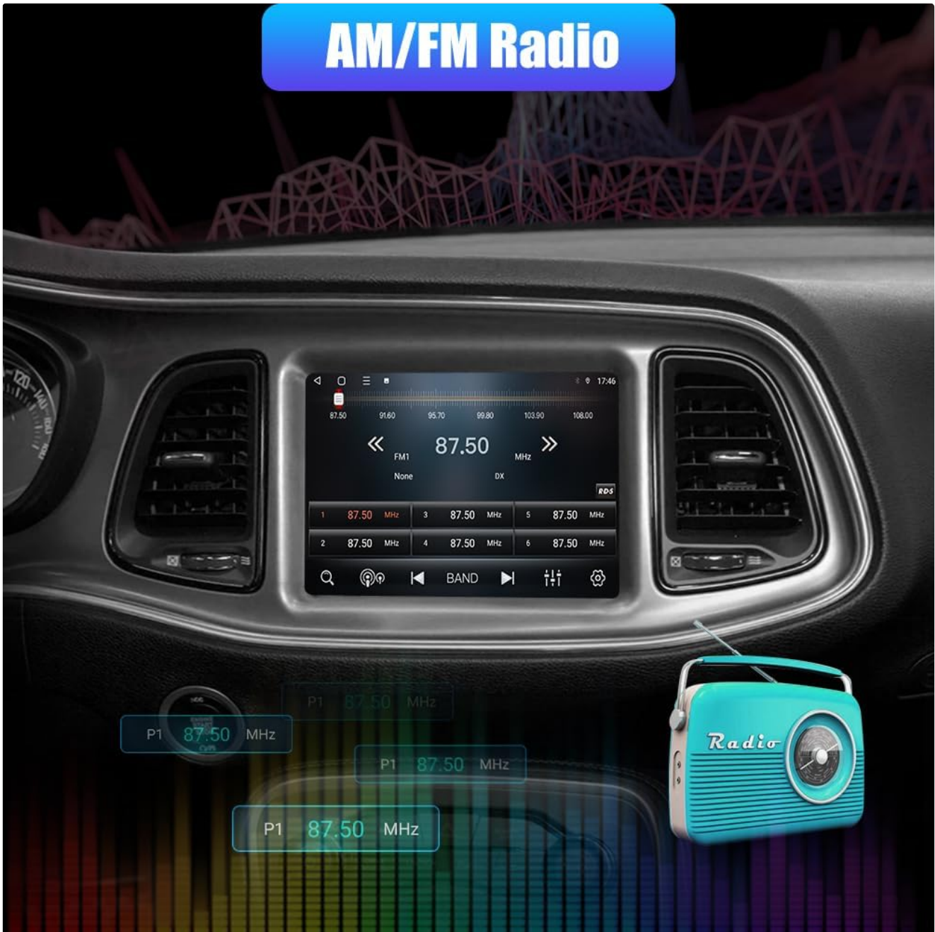
Figure 5.10: AM/FM Radio interface.

Access your favorite radio stations with the integrated AM/FM tuner.