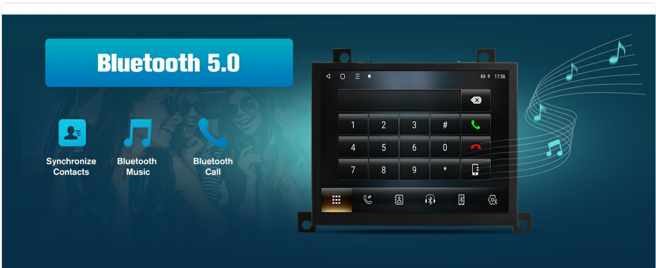
Figure 5.7: Bluetooth 5.0 features for calls and music.

Fast Bluetooth connection with a built-in microphone enables hands-free calling and audio streaming. Enjoy clear and stable music playback even in noisy environments.