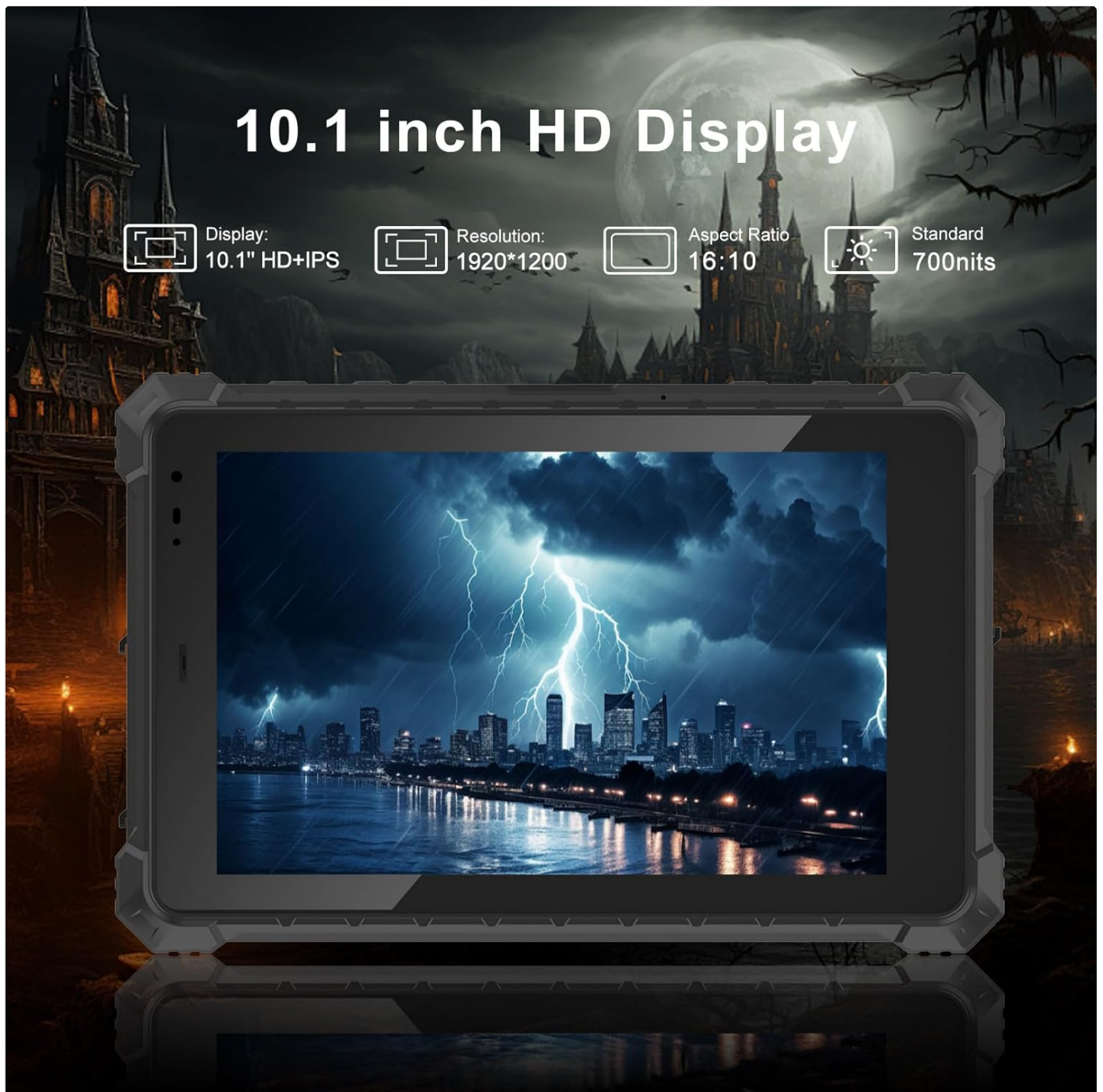
Figure 5: The tablet's 10.1-inch HD display is designed for clarity and outdoor visibility.