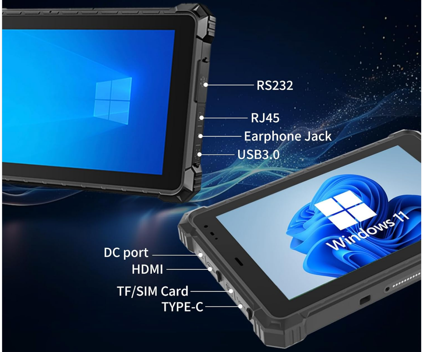
Figure 9: Multiple interfaces for connecting various devices and peripherals.