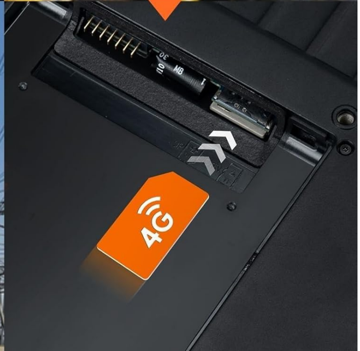
Figure 7: Comprehensive connectivity options including 4G LTE and Wi-Fi 6.

For navigation, the tablet includes built-in GPS, Beidou, Galileo, and GLONASS , providing accurate positioning and navigation capabilities.