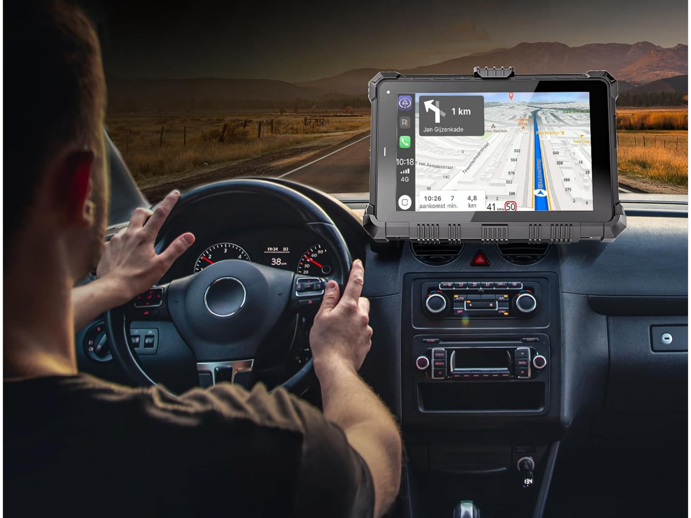
Figure 8: Integrated GPS for reliable navigation and traffic monitoring.

Built-in GPS、Beidou、Galileo、GLONA Monitoring the Traffic and Weather When You Drive