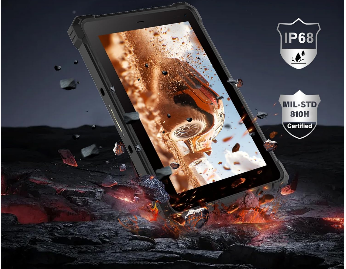
Figure 4: The tablet's robust design with IP68 and MIL-STD-810H certifications.

Your browser does not support the video tag.