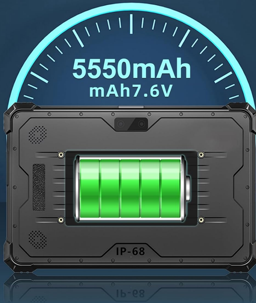
Figure 6: High-capacity battery for extended operational hours.