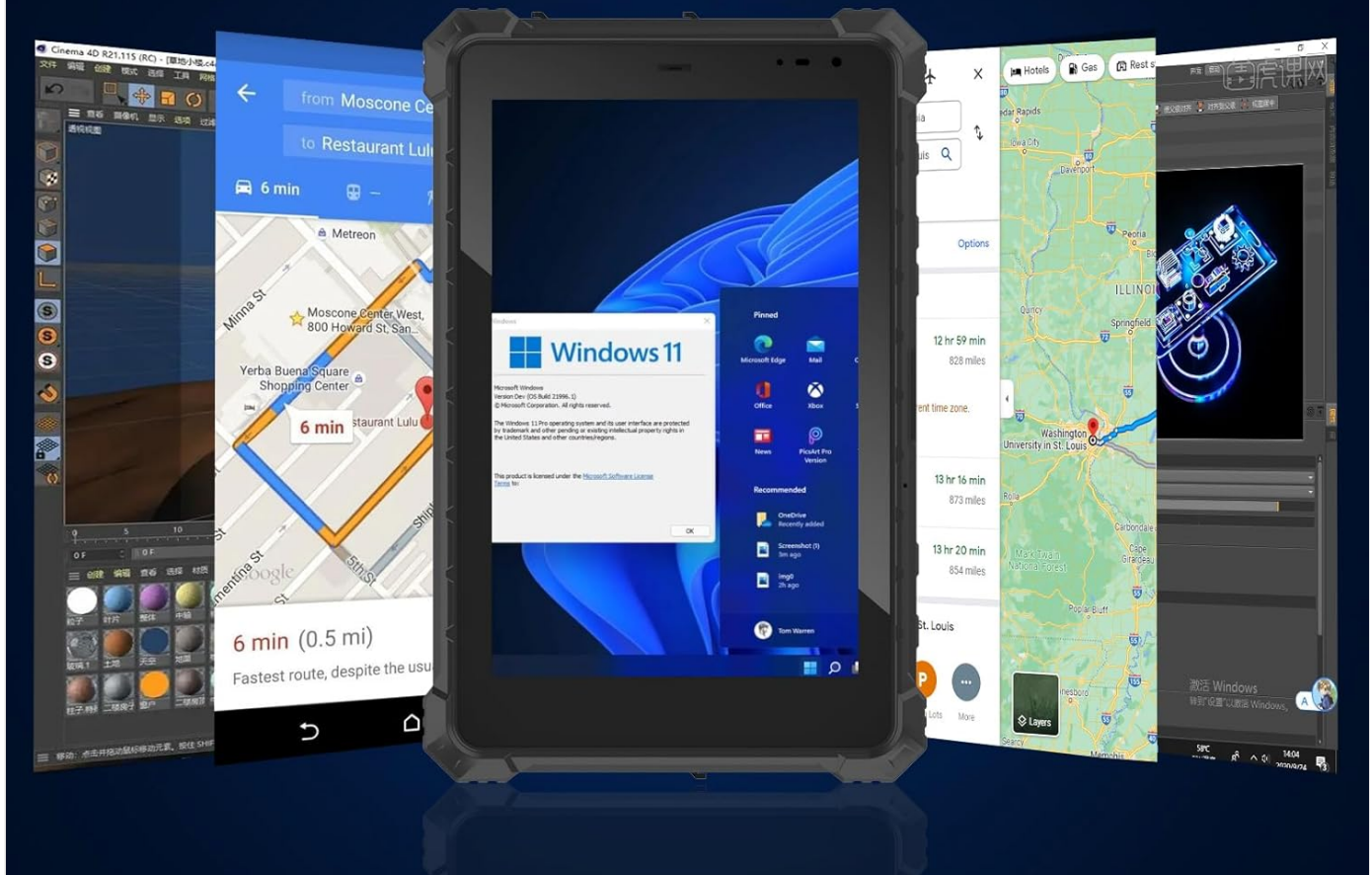
Figure 3: The tablet runs Windows 11 Pro, supporting a wide range of applications.