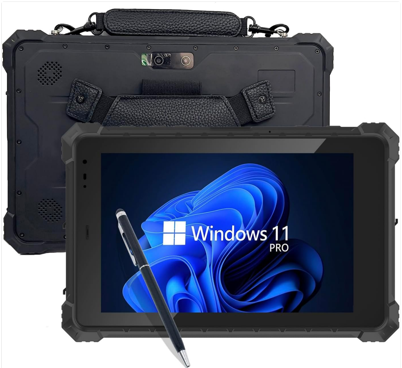
Figure 1: CENAVA Rugged Tablet W10N with Windows 11 Pro interface and stylus.