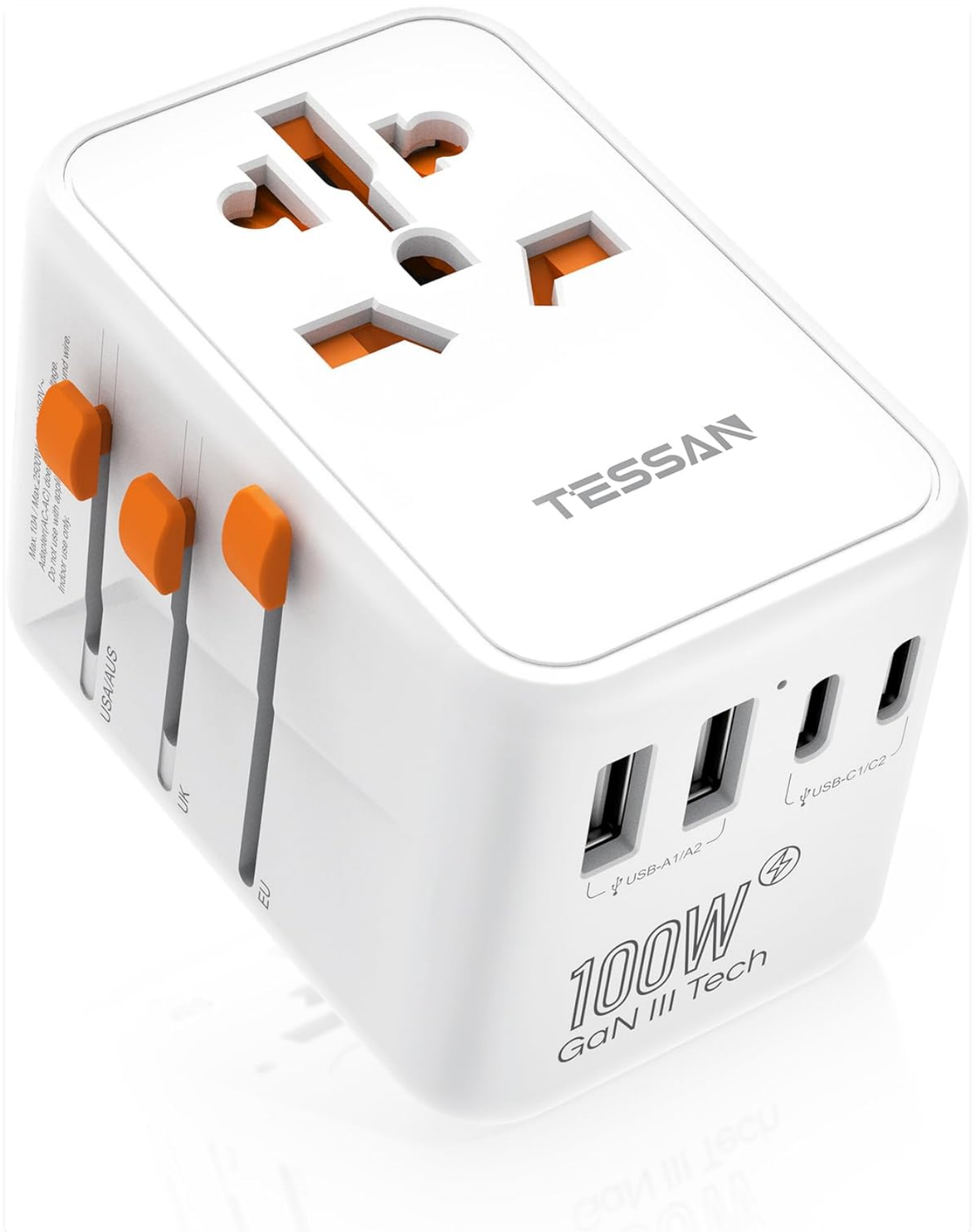
Figure 1: TESSAN Universal Travel Adapter 100W GaN, showing its compact design and multiple ports.