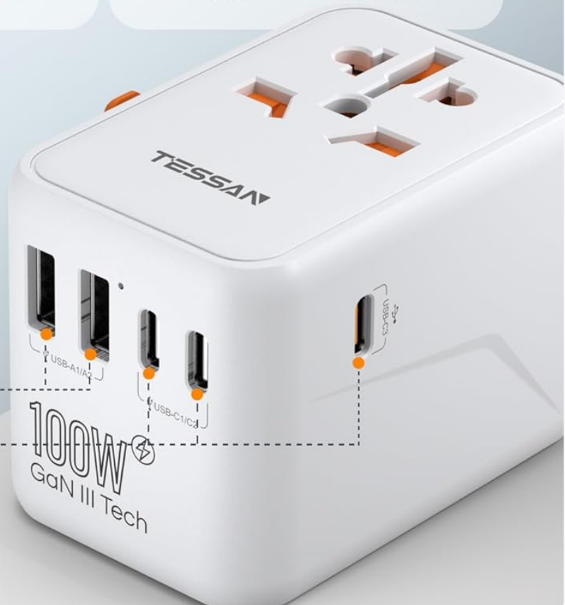
Figure 4: Diagram illustrating the types of devices compatible with USB-A and USB-C ports, highlighting the 100W max output for USB-C3.