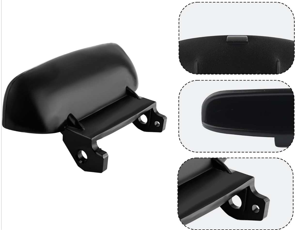
Figure 3: Various product views. Various angles of the black plastic center console latch, highlighting its design and attachment points.