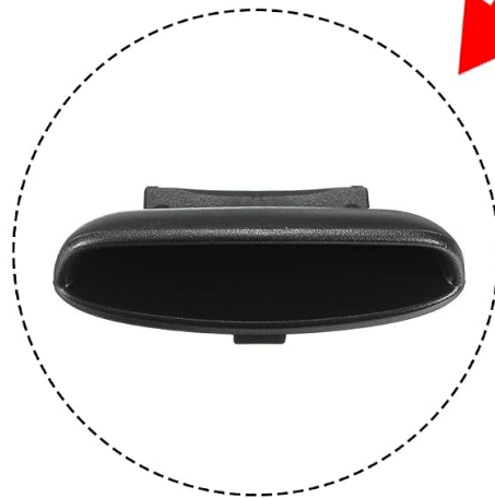
Figure 2: Latch location in Honda Civic center console. This image demonstrates the location where the center console latch is installed within the armrest of a Honda Civic, indicating its function in securing the lid.