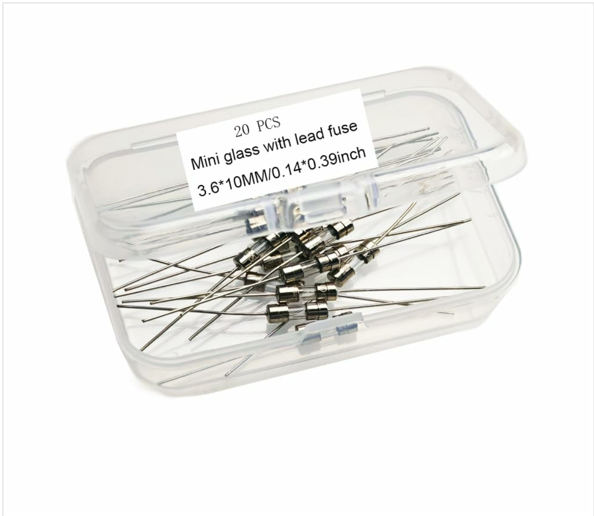
Image 2.1: A clear plastic case containing 20 Vigor_Source 10A 250V Fast-Blow Mini Lead Glass Fuses, showing the product packaging and quantity.