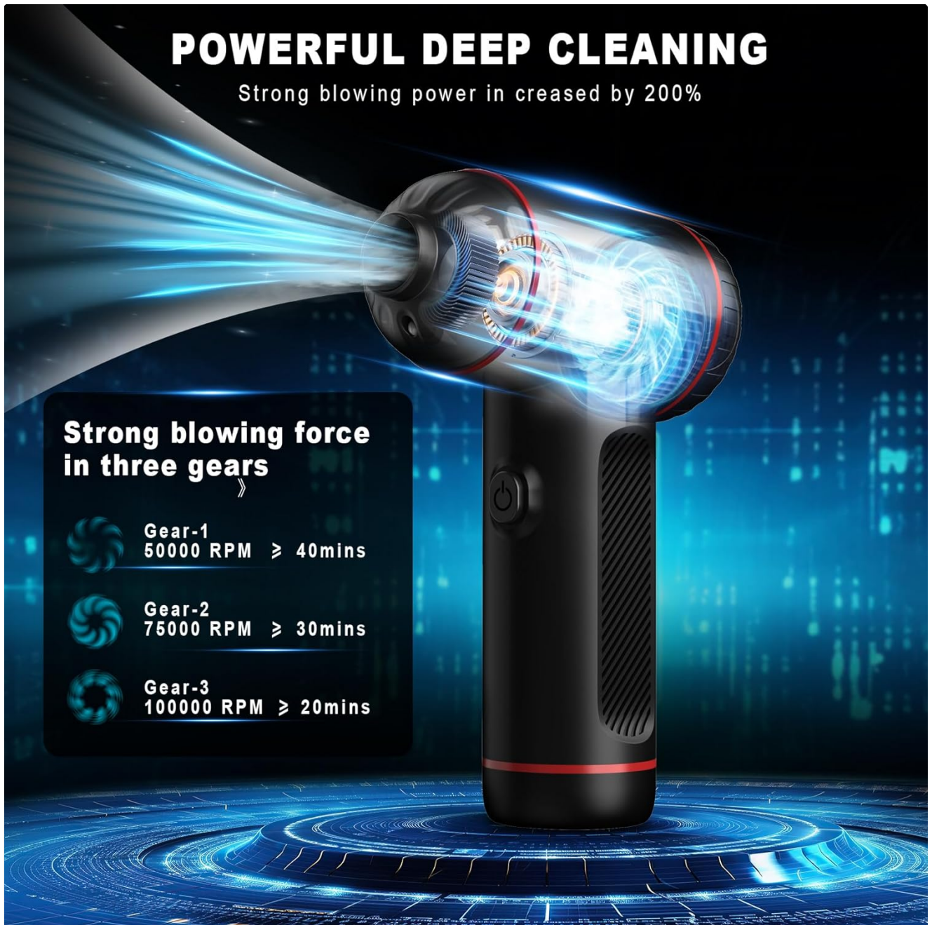
Image: The FRESMOL Air Duster with a nozzle attached, demonstrating how accessories are connected.