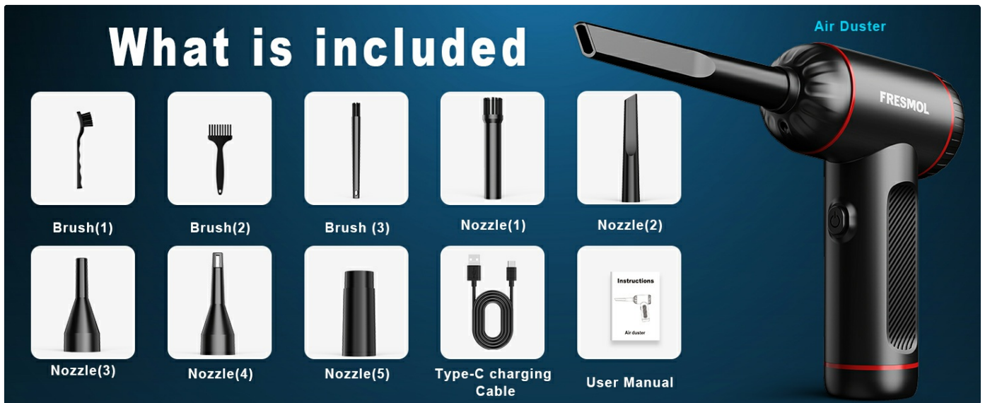
Image: Contents of the FRESMOL Compressed Air Duster package, including the main unit, multiple nozzles, brushes, and a Type-C charging cable.