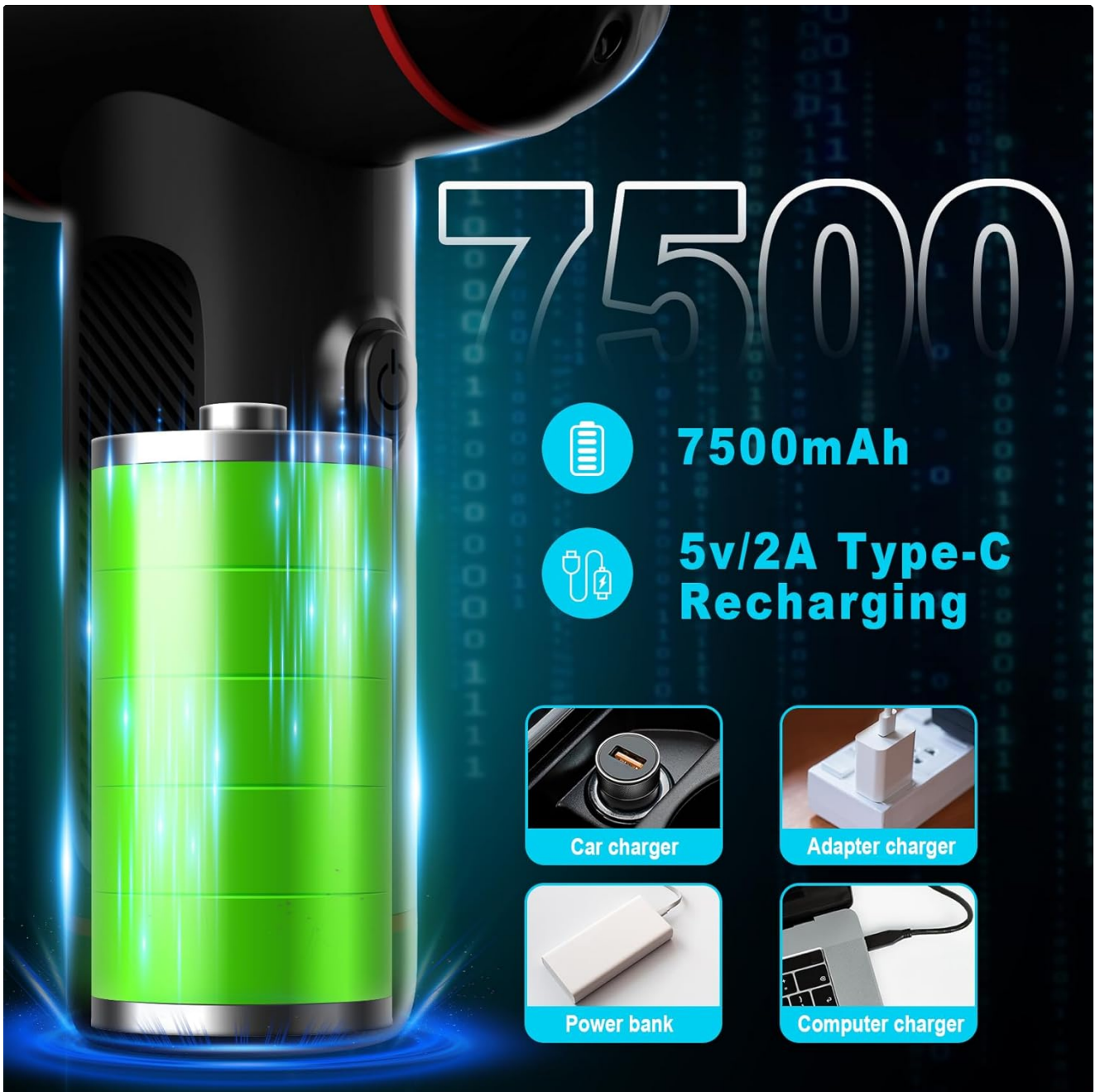
Image: The FRESMOL Air Duster connected to a Type-C charging cable, illustrating the charging process.