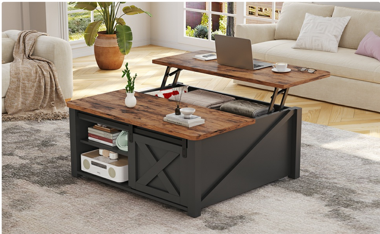
Image: The side compartments feature adjustable shelves for flexible storage solutions.

Image: The hidden storage compartment provides ample space for various items, keeping your living area tidy.