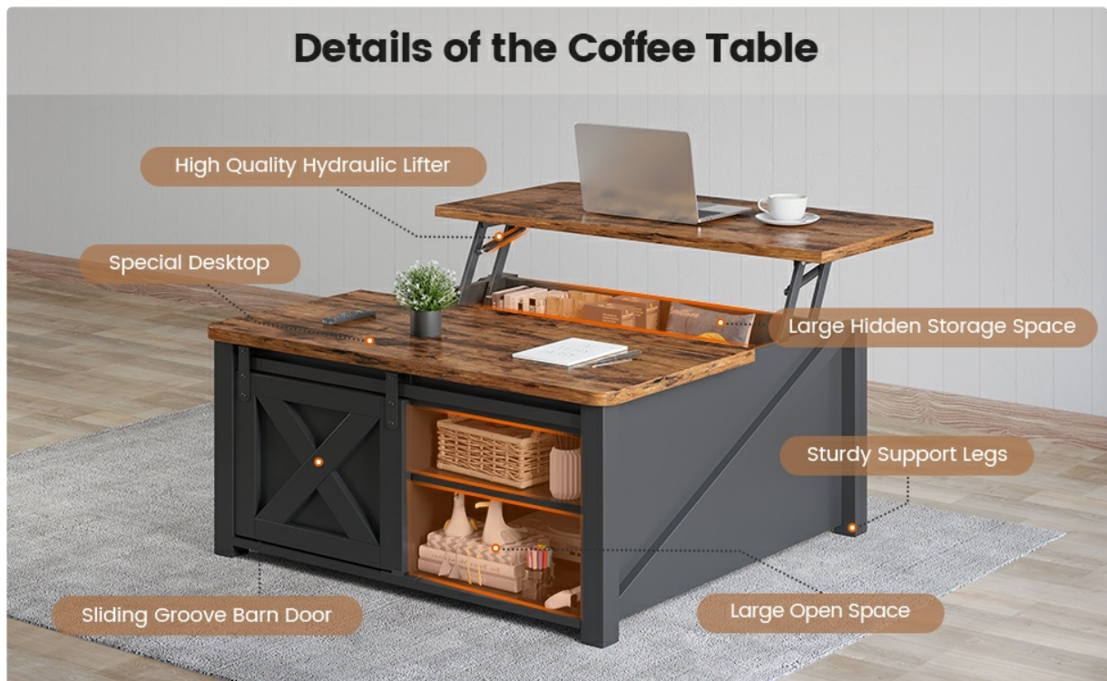
Image: The lift-top mechanism allows the tabletop to be raised to a comfortable height for working or dining.

To raise the tabletop, gently lift the front edge. The hydraulic mechanism will assist in a smooth, controlled ascent. To lower, gently push down on the tabletop until it securely locks into the closed position. Ensure no objects are obstructing the mechanism during operation.