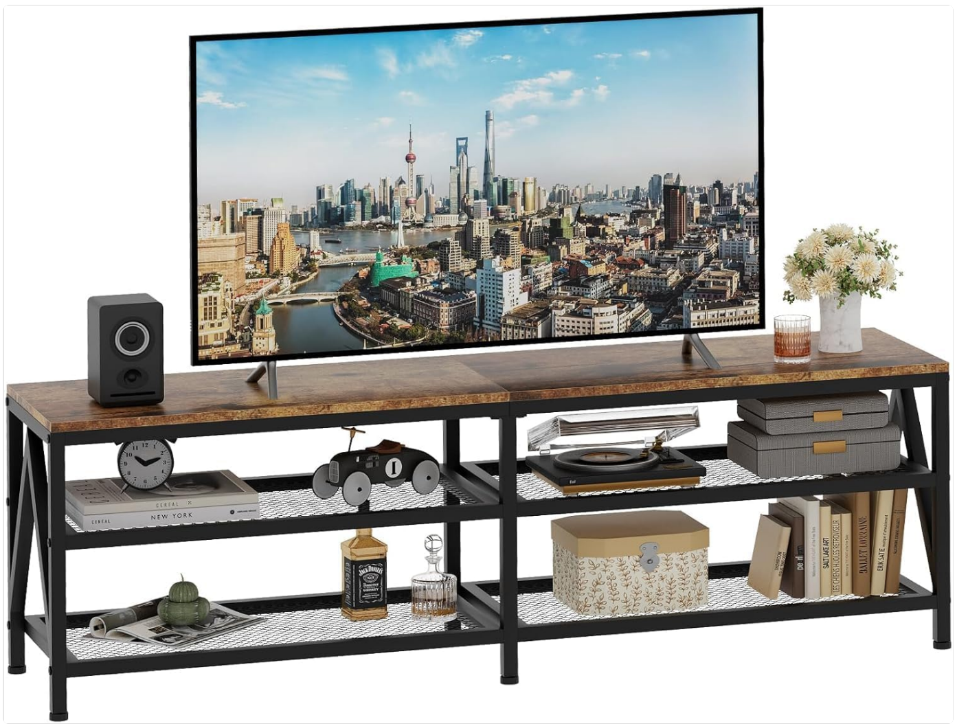
Image 1.1: Fully assembled Huhote Industrial TV Stand, showcasing its design and capacity for a large television and various media devices or decor.