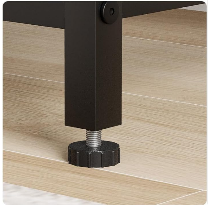
Image 4.1: Detail of the robust steel frame with V-shaped supports and an adjustable leveling foot, highlighting the stability features.