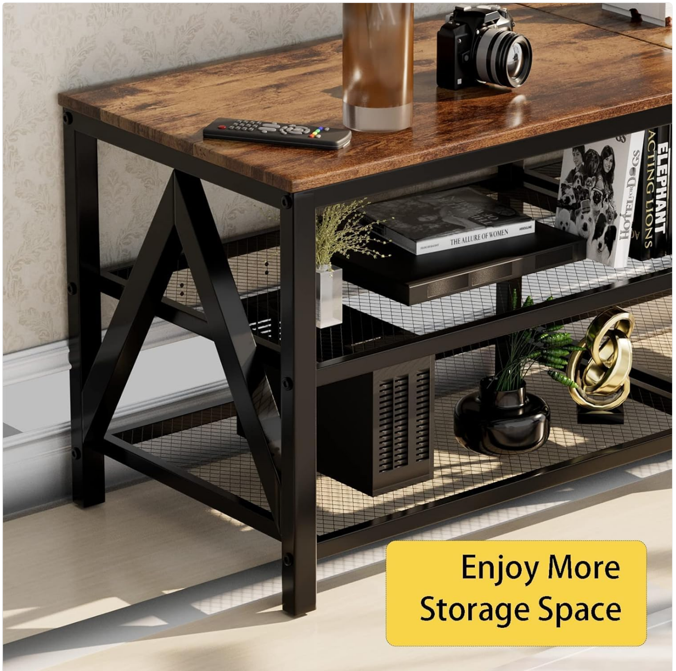
Image 5.1: The spacious open compartments of the TV stand, showcasing its utility for organizing media equipment and other items.