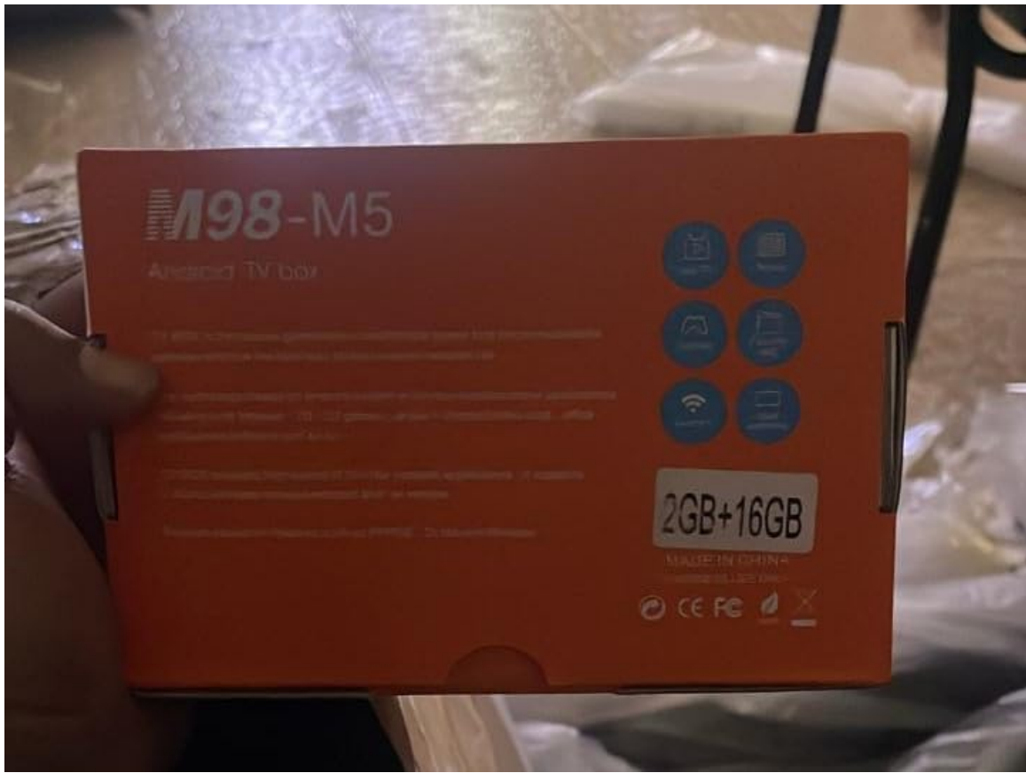
Image: Close-up of the M98-M5 TV Box packaging, confirming the 2GB RAM and 16GB internal storage configuration.