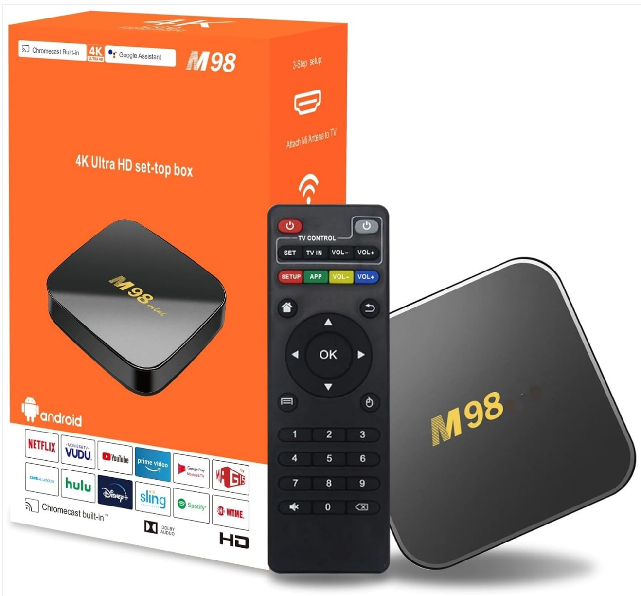
Image: The M98-M5 Smart Android TV Box and its accompanying remote control, showcasing the device's sleek design.