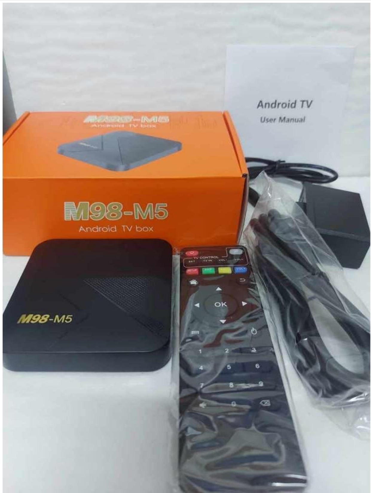
Image: Contents of the M98-M5 Smart Android TV Box package, including the TV box, remote control, power adapter, and cables.