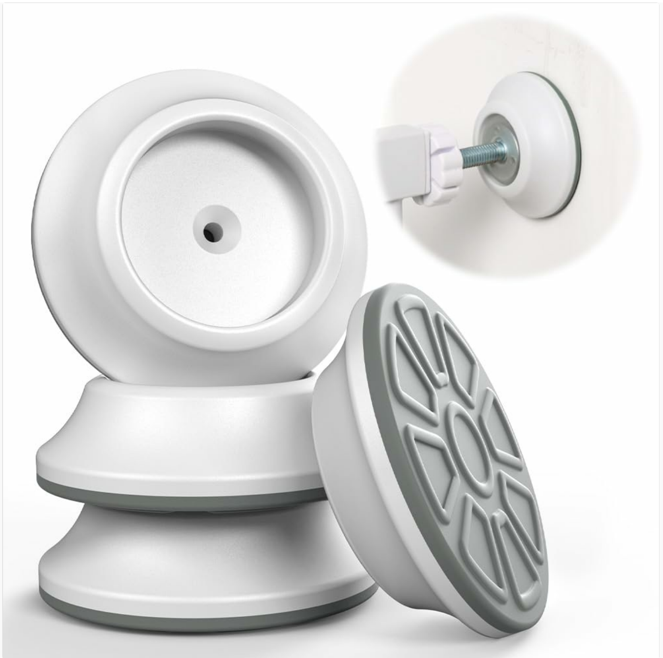
Image 1.1: The COMOMY 4-Pack Baby Gate Wall Protectors, showing their circular design and grey non-slip backing.