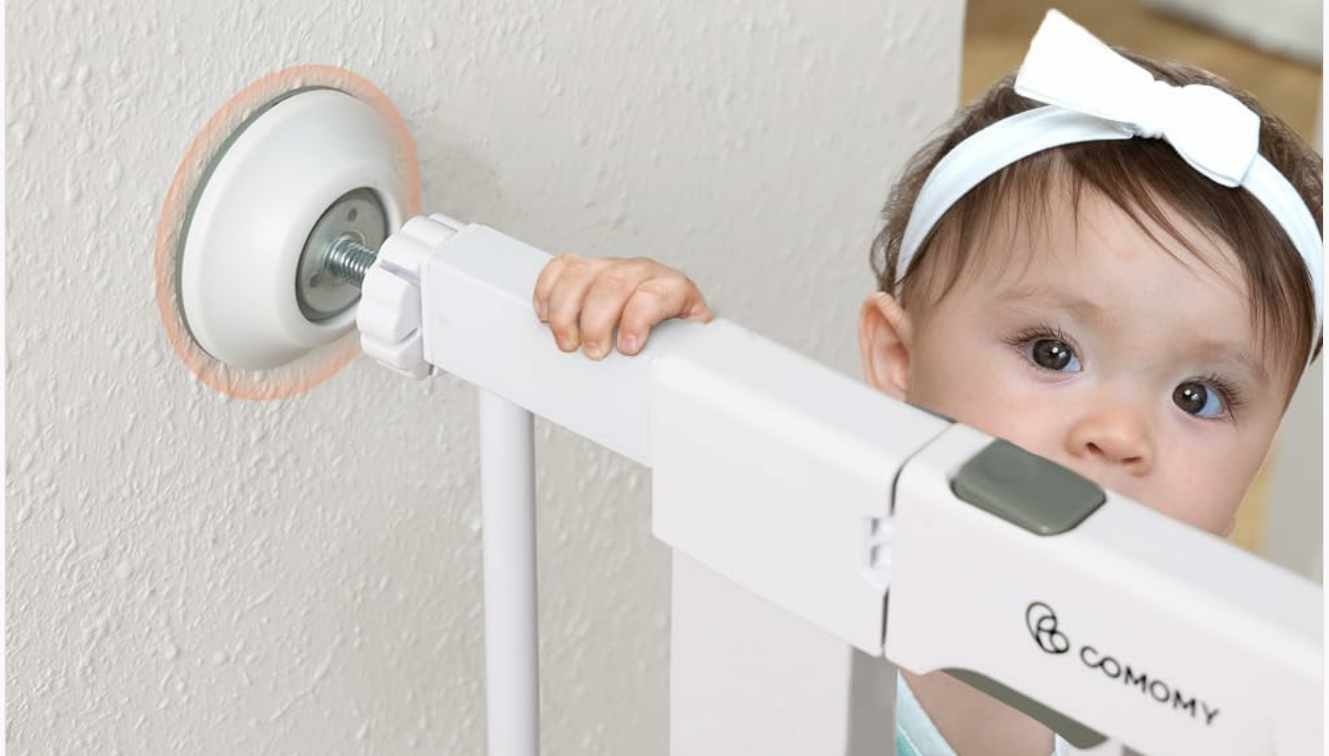
Image 4.1: The wall protectors are compatible with a wide range of pressure-mounted installations.

Always ensure the gate's pressure foot fits securely within the protector's recess. The 0.9-inch extender provides additional depth, but always check your doorway or baseboard for overall compatibility to achieve the best wall protection and gate stability.