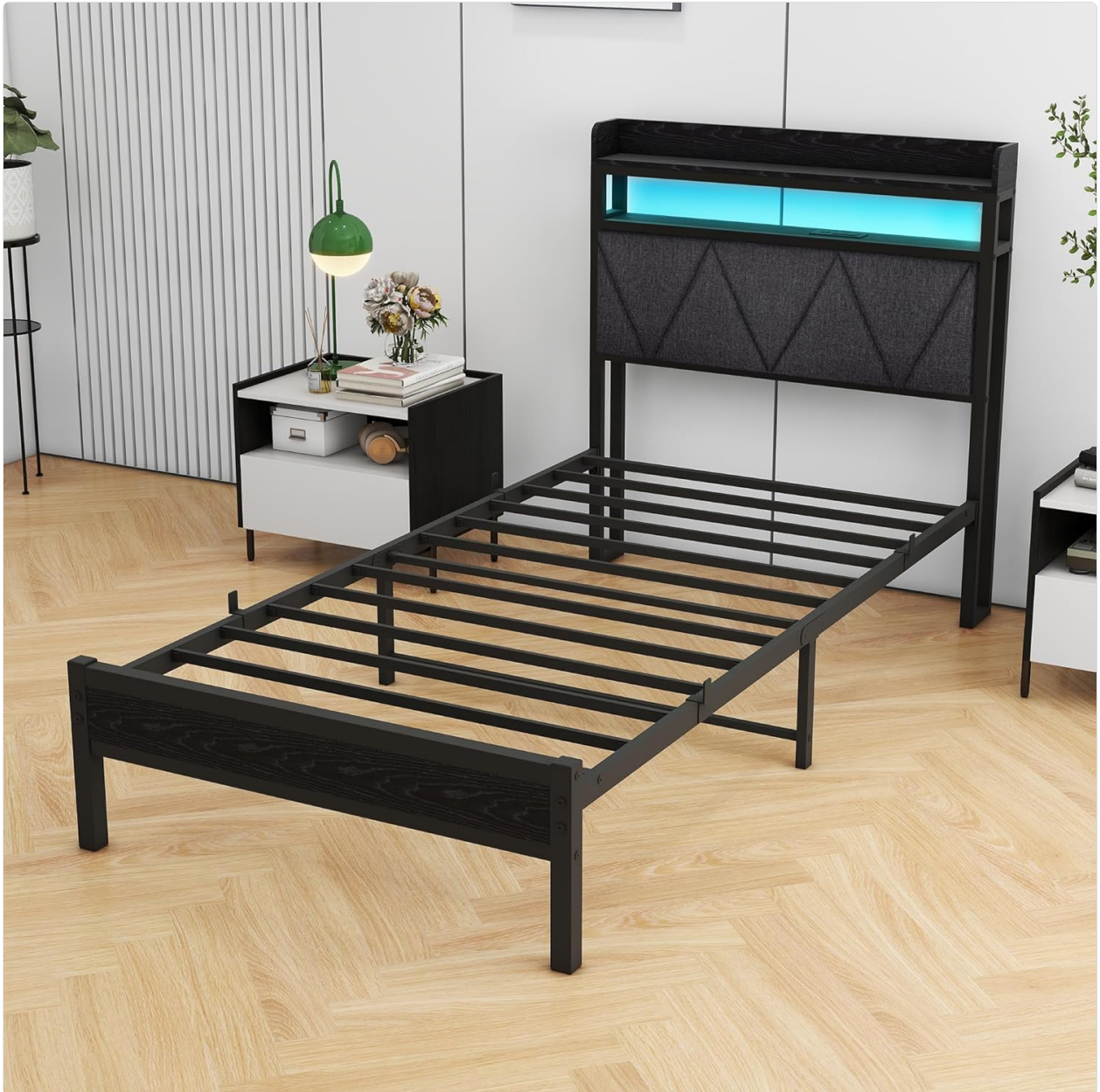
Image: The bed frame structure with metal slats, ready for mattress placement.