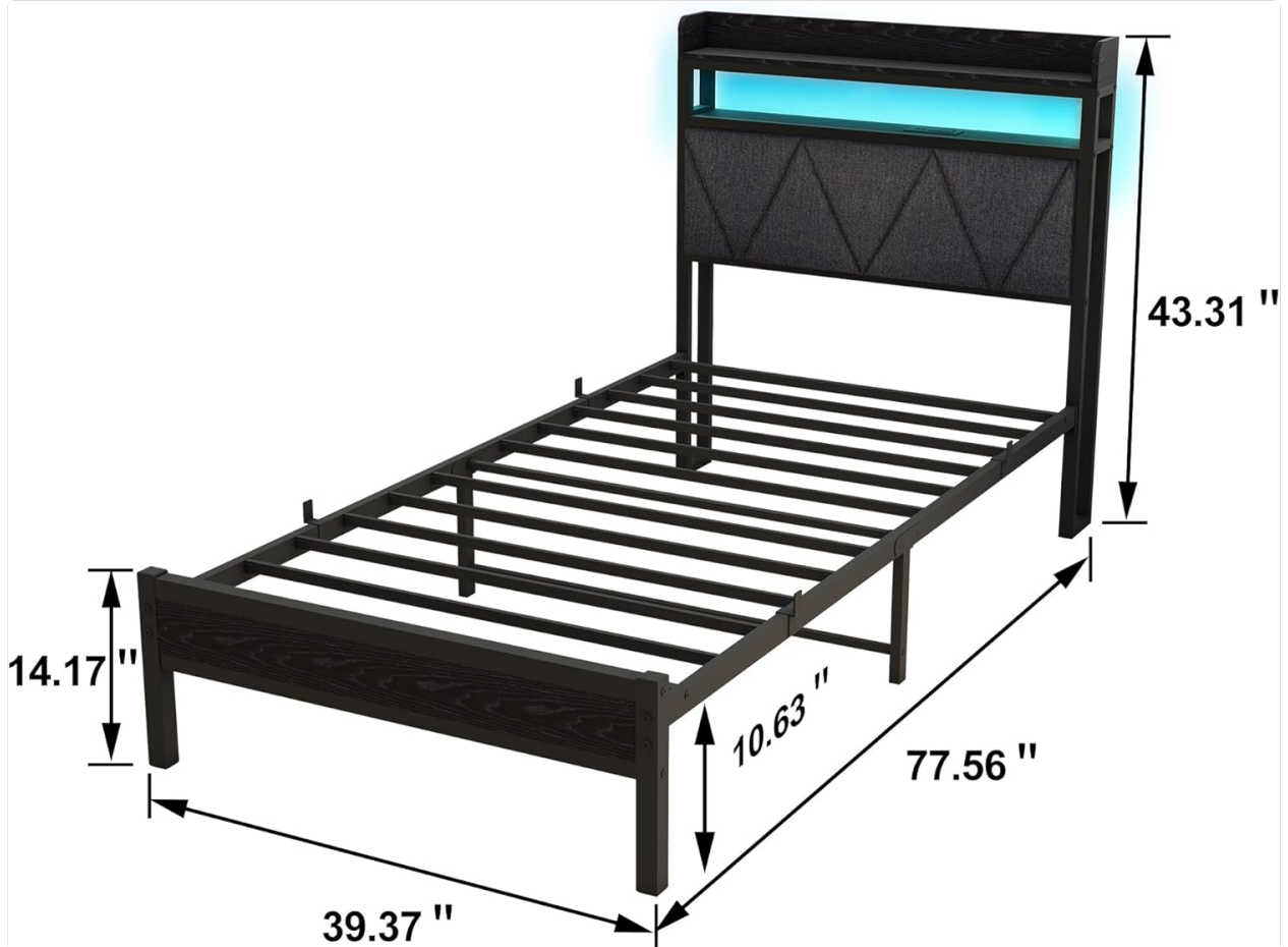
Image: Dimensional diagram of the bed frame, indicating length, width, and height.