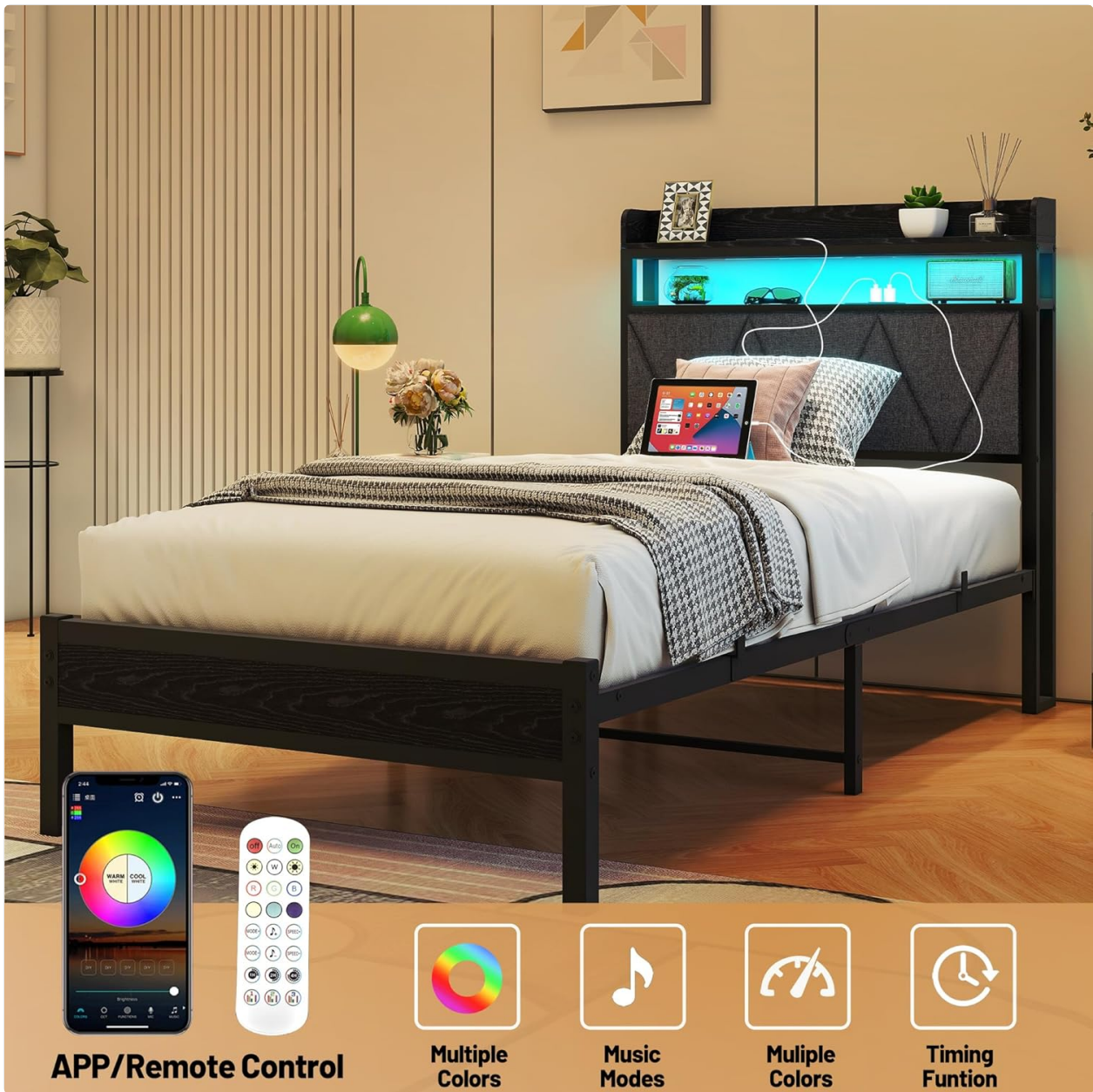
Image: The bed frame with its LED lights illuminated, illustrating control options via remote and mobile application.