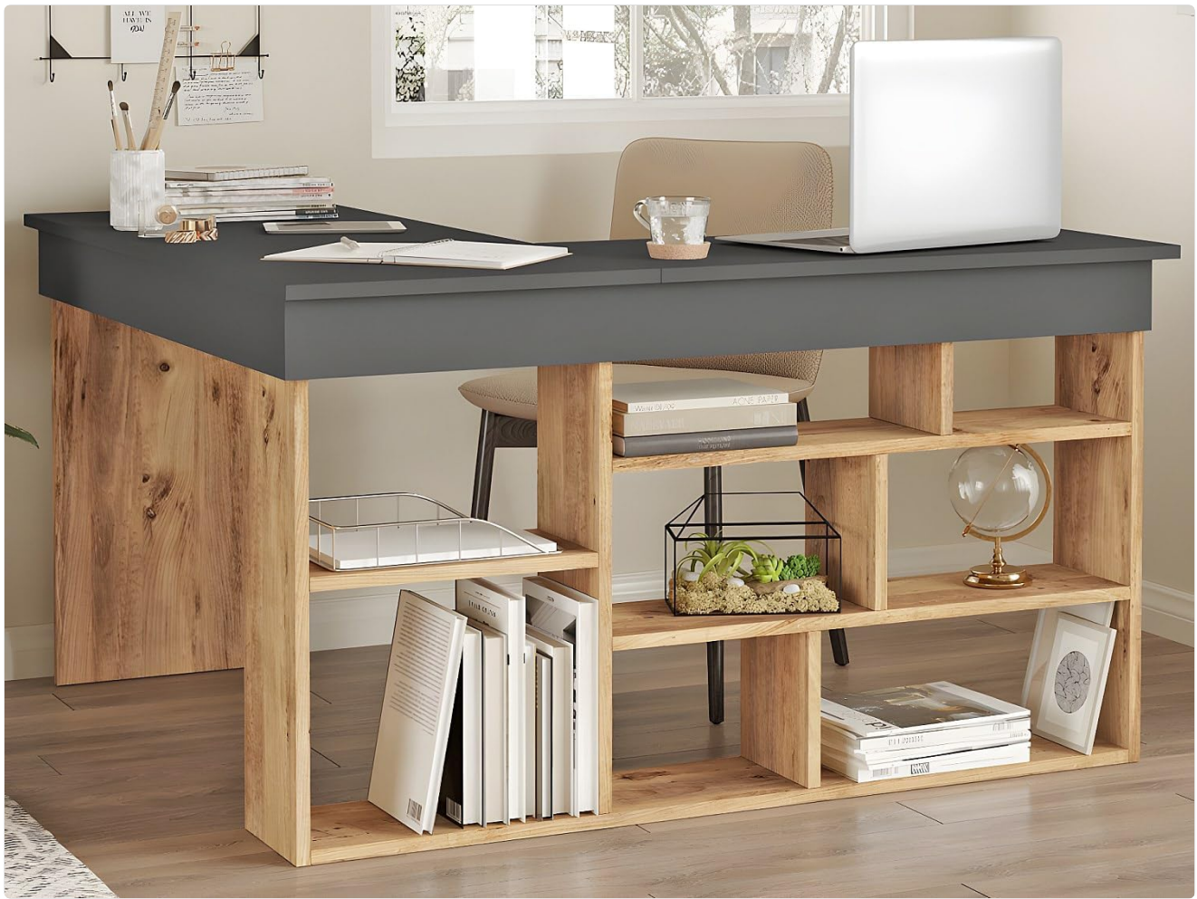
Image 2: Detailed view of the LILEUL Corner Desk, highlighting the eight integrated shelves for organized storage.