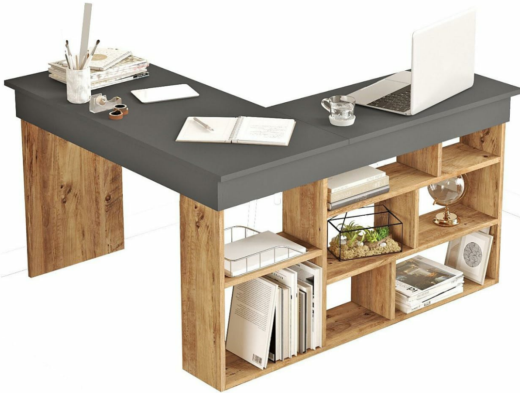
Image 1: Overview of the LILEUL Corner Desk, showcasing its L-shape and integrated storage shelves. A laptop and various office supplies are arranged on the desk.