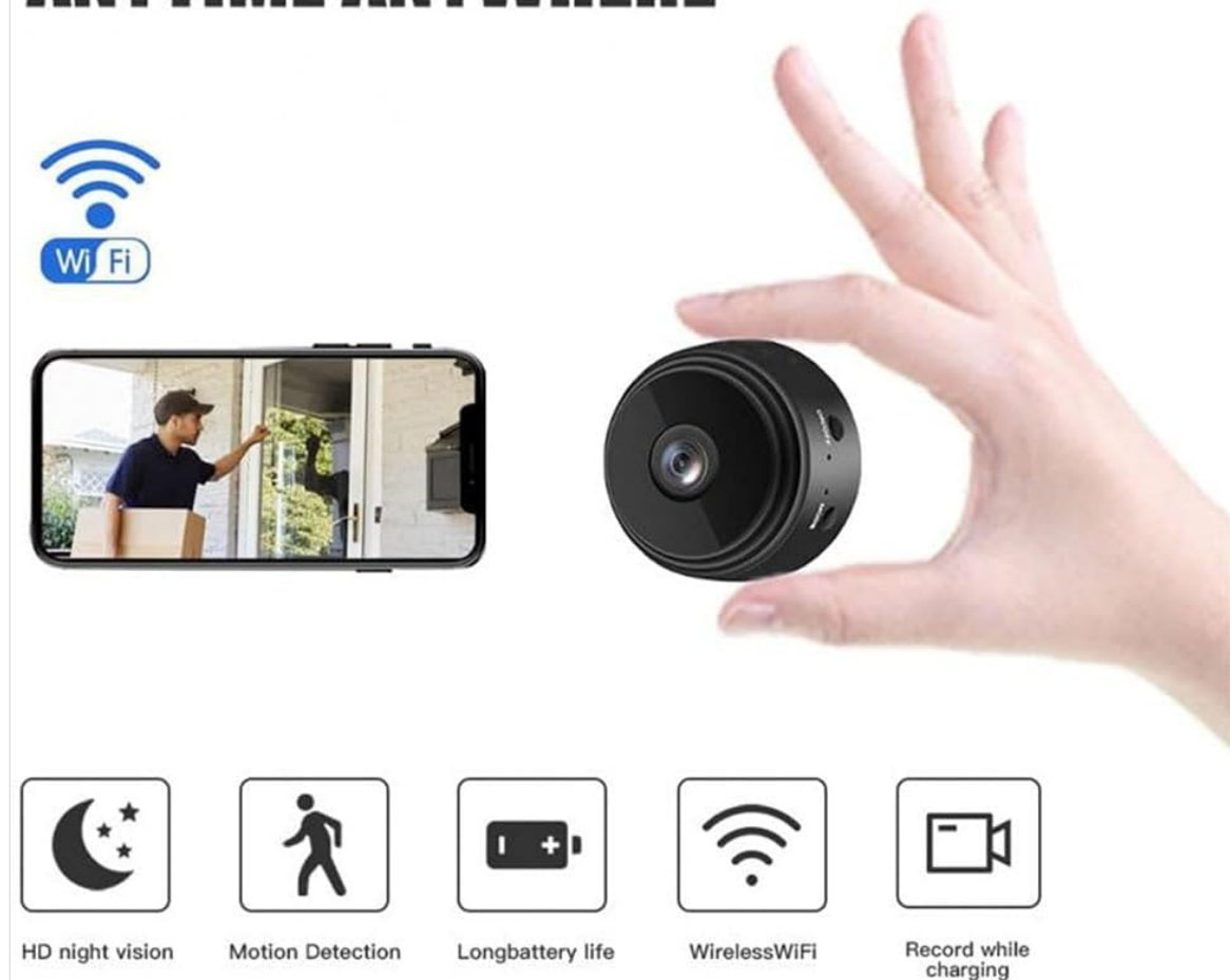
Image: Overview of security features including HD night vision and motion detection.