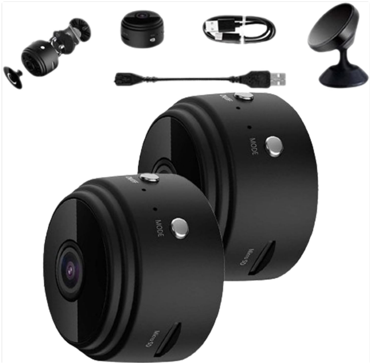
Image: Contents of the Magnetic Mini Security Camera package, showing two cameras, two magnetic mounts, and two USB charging cables.