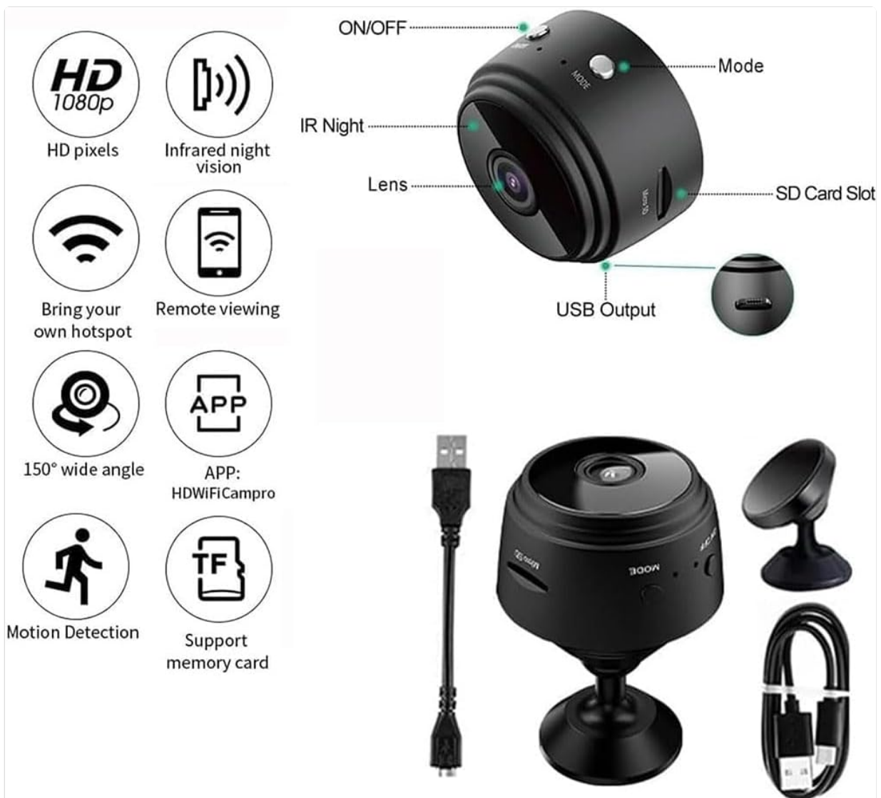
Image: Detailed diagram of the camera highlighting the ON/OFF button, Mode button, Lens, Micro SD card slot, USB output, and IR Night lights.