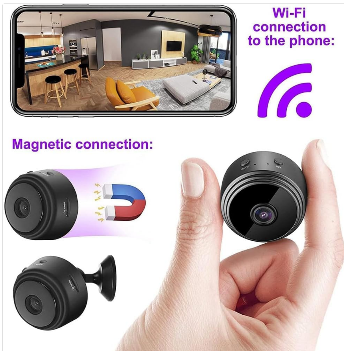
Image: Illustration of Wi-Fi connection to a smartphone and the camera's magnetic attachment feature.