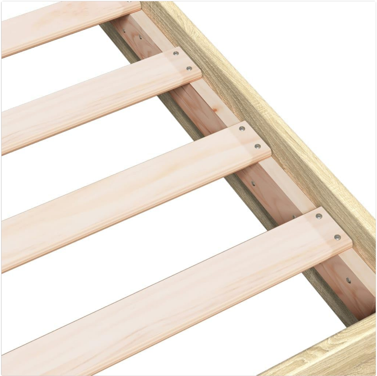
Figure 4: Close-up view of the sturdy plywood slats, designed for optimal mattress support and weight distribution.