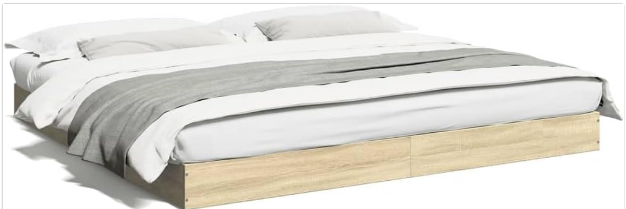
Figure 5: Angled view of the vidaXL Sonoma Oak Bed Frame, showcasing its low-profile design and readiness for a mattress.

Once assembled, your bed frame is ready for use. Place a mattress of 180 x 200 cm (W x L) directly onto the plywood slats. The sturdy slats are designed to provide proper weight distribution and ensure the mattress remains in place.