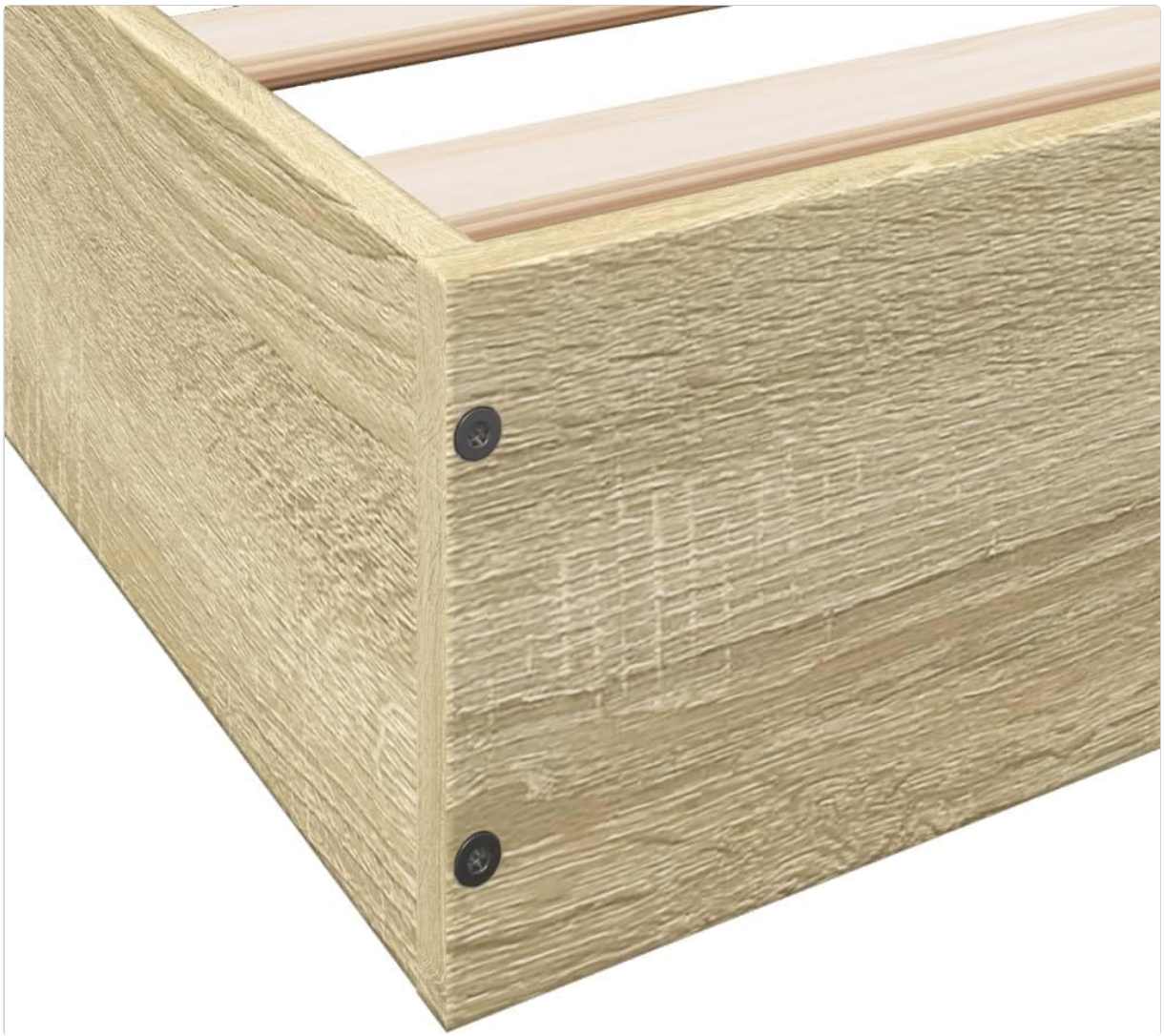
Figure 3: Close-up of a corner joint, demonstrating the secure fastening of the engineered wood panels during assembly.