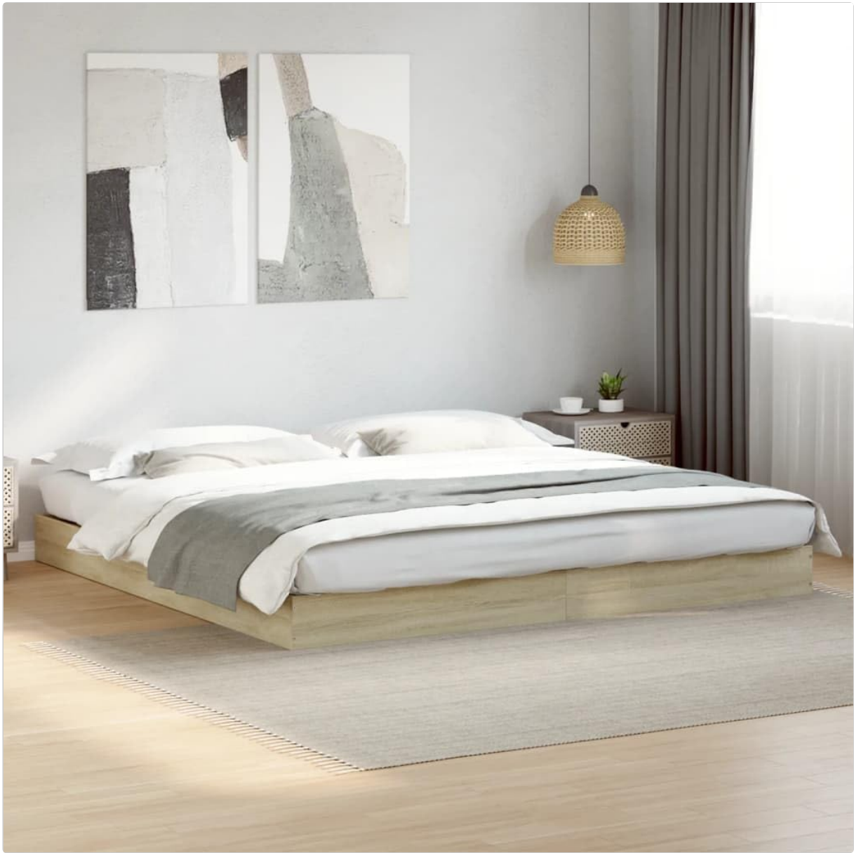
Figure 1: Assembled vidaXL Sonoma Oak Bed Frame with bedding, showcasing its modern design.