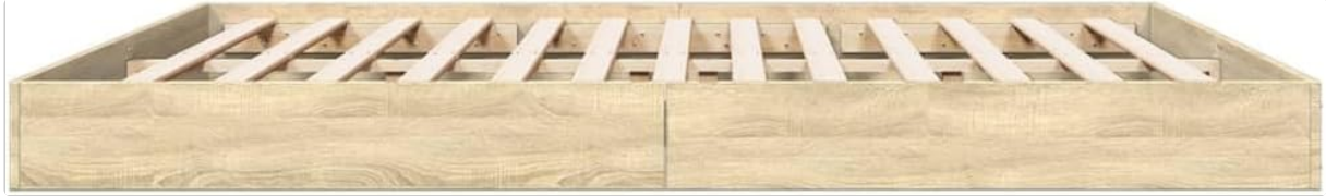
Figure 2: Front view of the bed frame, illustrating the main structural components and slat system.