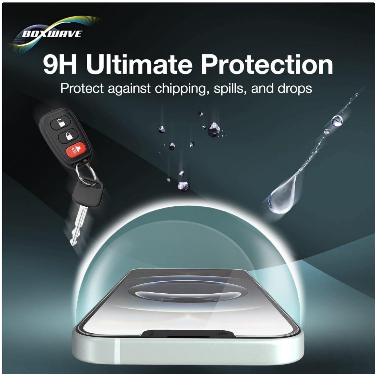
Image: Demonstrates 9H ultimate protection against various forms of damage.