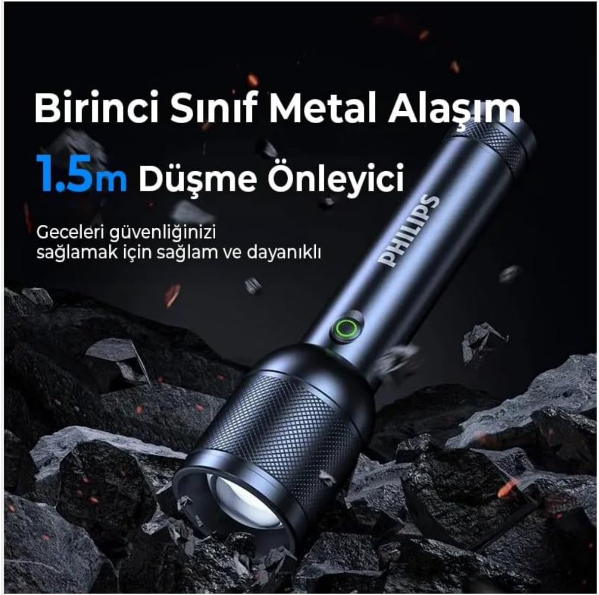
Figure 4.1: Philips SFL8168/93 LED Flashlight. This image highlights the flashlight's robust metal alloy construction, designed for durability and 1.5m drop protection.

Familiarize yourself with the components of your Philips SFL8168/93 flashlight.