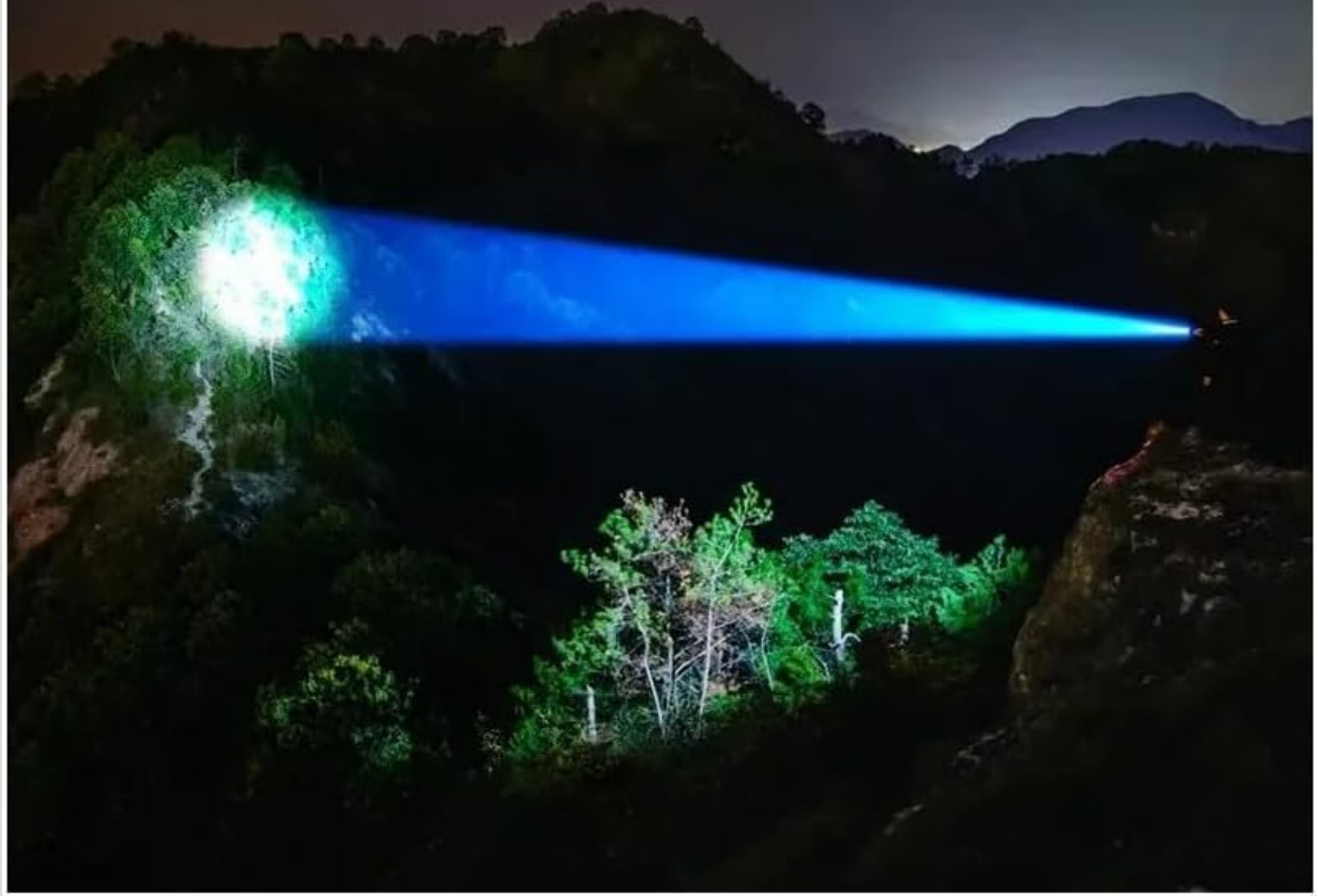
Figure 4.4: 1000m Illumination Distance. The flashlight projects a powerful beam over a long distance, capable of reaching up to 1000 meters.