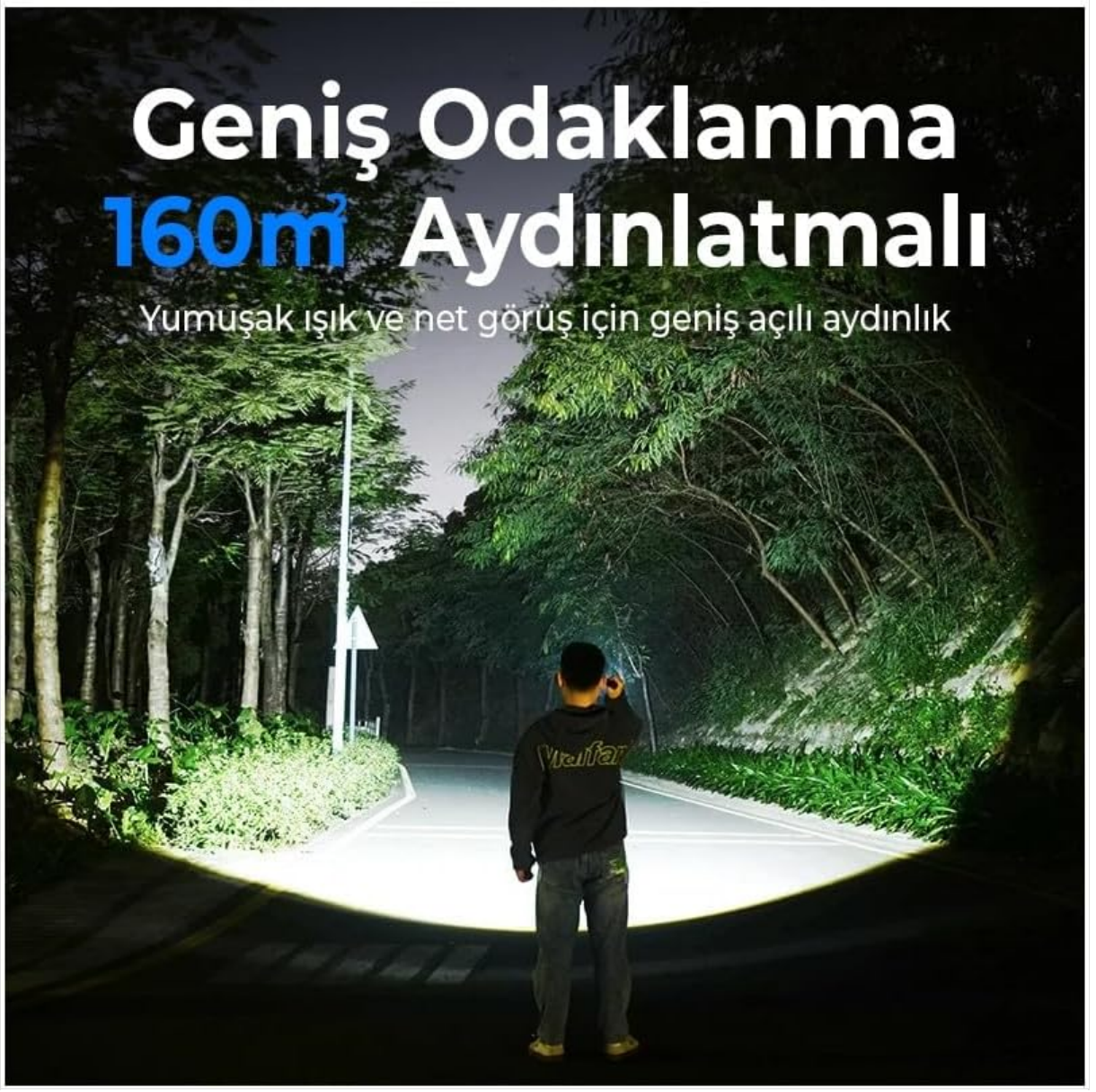
Figure 4.3: Wide Focus Illumination. This image depicts the flashlight providing a broad beam, suitable for illuminating a wide area up to 160 meters for soft light and clear vision.

Yumuřak ışık ve net görüř için geniř açılı aydınlık