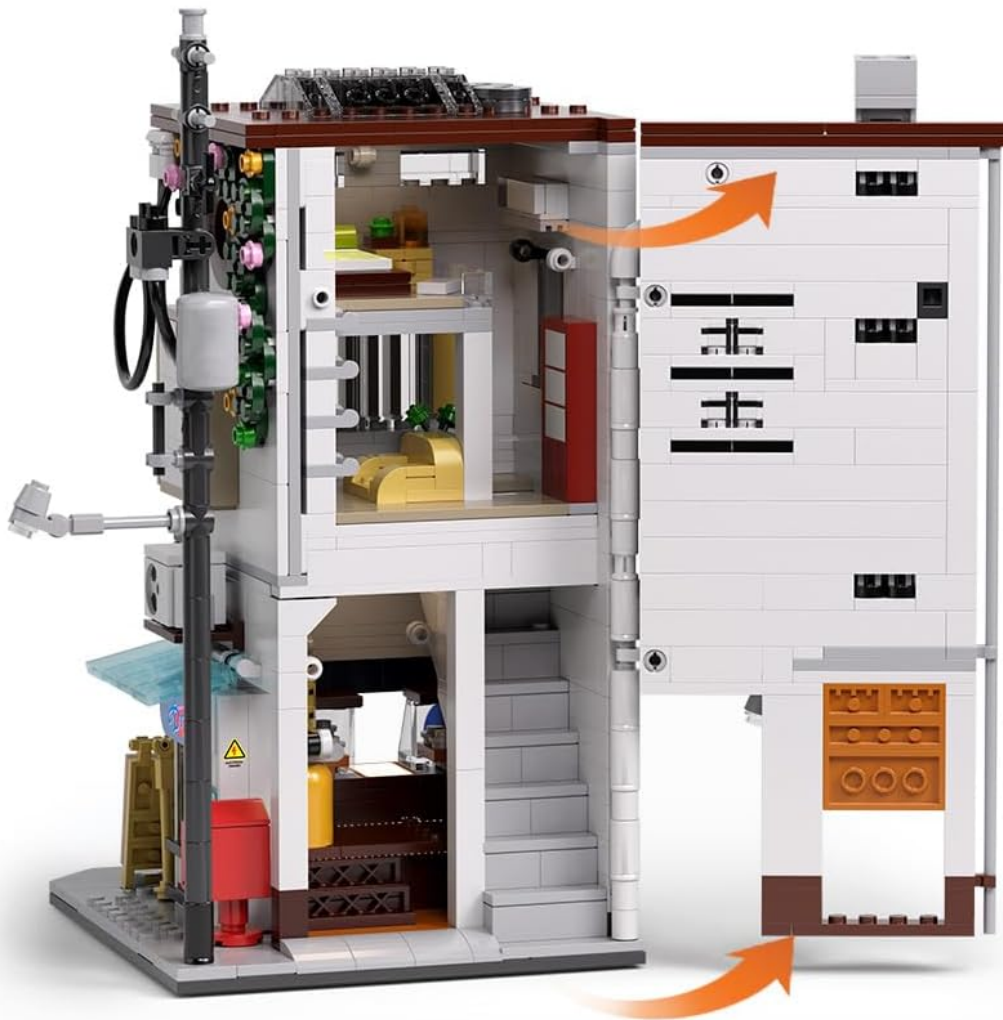
Figure 2: The Baozi Shop model with its side walls opened, revealing the detailed interior of both the ground floor shop and the second-floor accommodation.

The walls can be opened to appreciate the details of the house