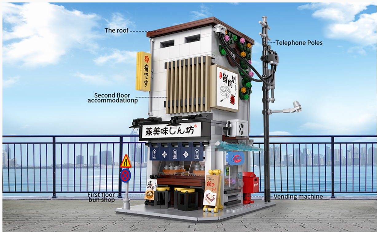
Figure 5: An annotated image of the Baozi Shop model highlighting key exterior features such as the roof,