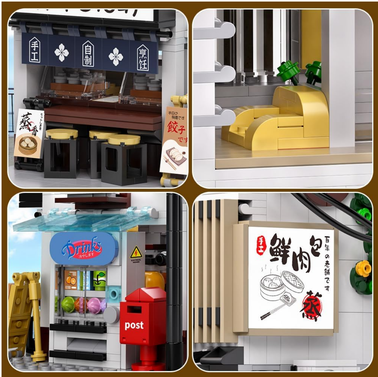
Figure 3: A collage of close-up images showing various intricate details of the Baozi Shop model, including the shop counter, vending machine, and interior elements.

Your browser does not support the video tag.