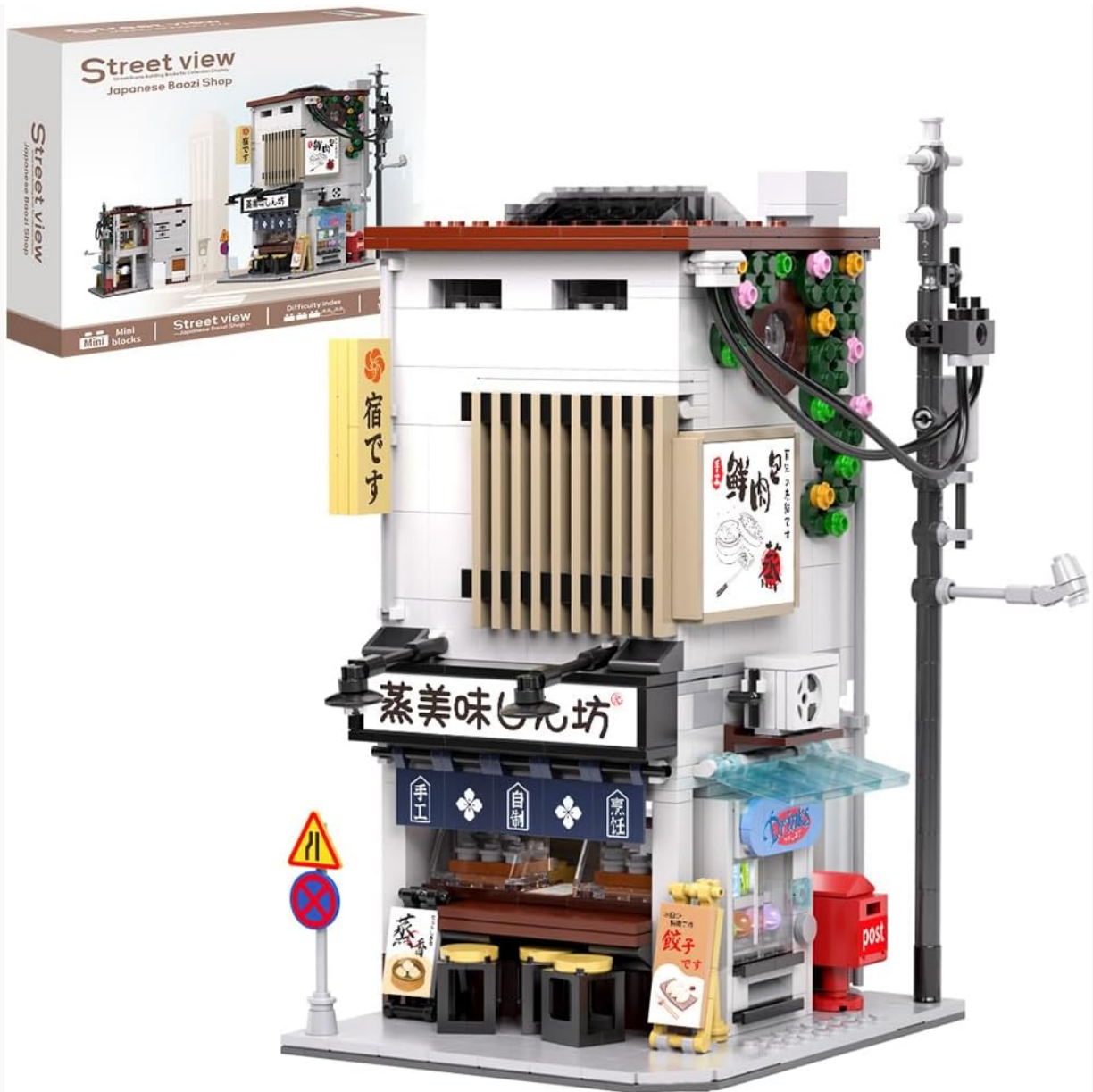
Figure 1: Fully assembled RAVAYO Japanese Street View Baozi Shop building blocks model, showcasing its detailed exterior.