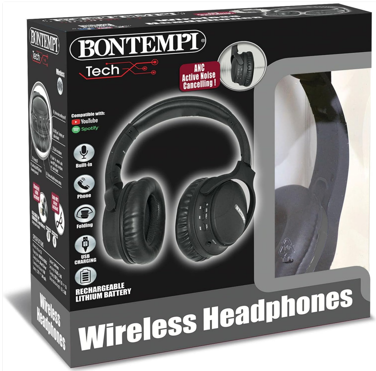
Image: The retail packaging for the Bontempi PlayPodsPro LED Wireless Headphones. The box highlights key features such as ANC, Bluetooth compatibility, folding design, and USB charging.