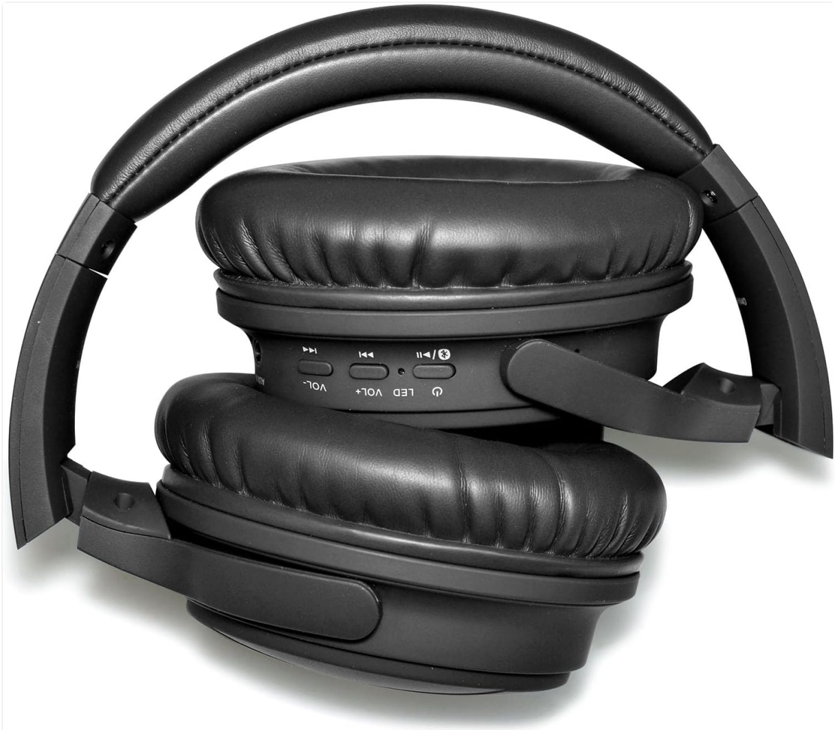
Image: The Bontempi PlayPodsPro LED Wireless Headphones in a folded position, clearly displaying the control buttons on the earcup, including power, volume, track control, and LED functions. This view is useful for identifying charging ports and control layout.