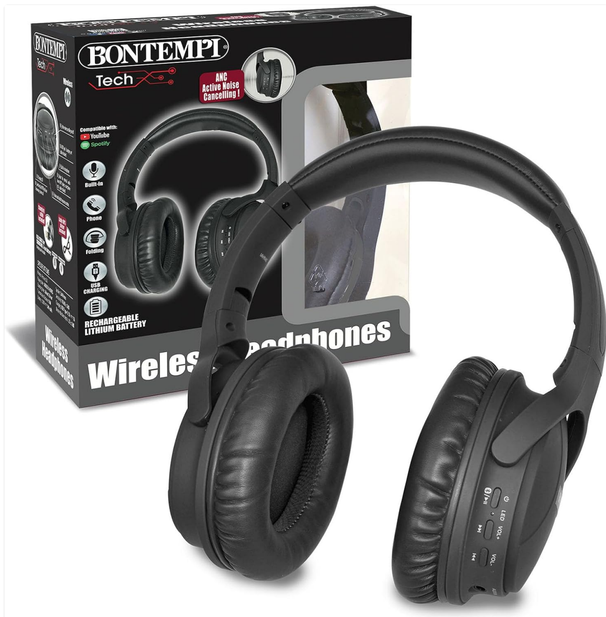
Image: Bontempi PlayPodsPro LED Wireless Headphones, unfolded and ready for use, with the product packaging visible in the background. This image illustrates the product's design and presentation.