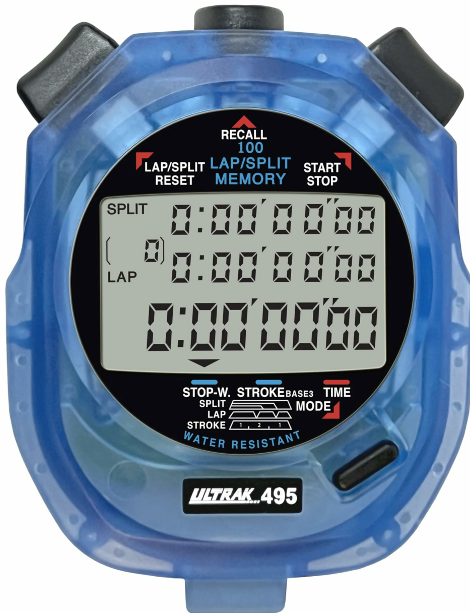
Figure 1: ULTRAK 495 Stopwatch in blue.