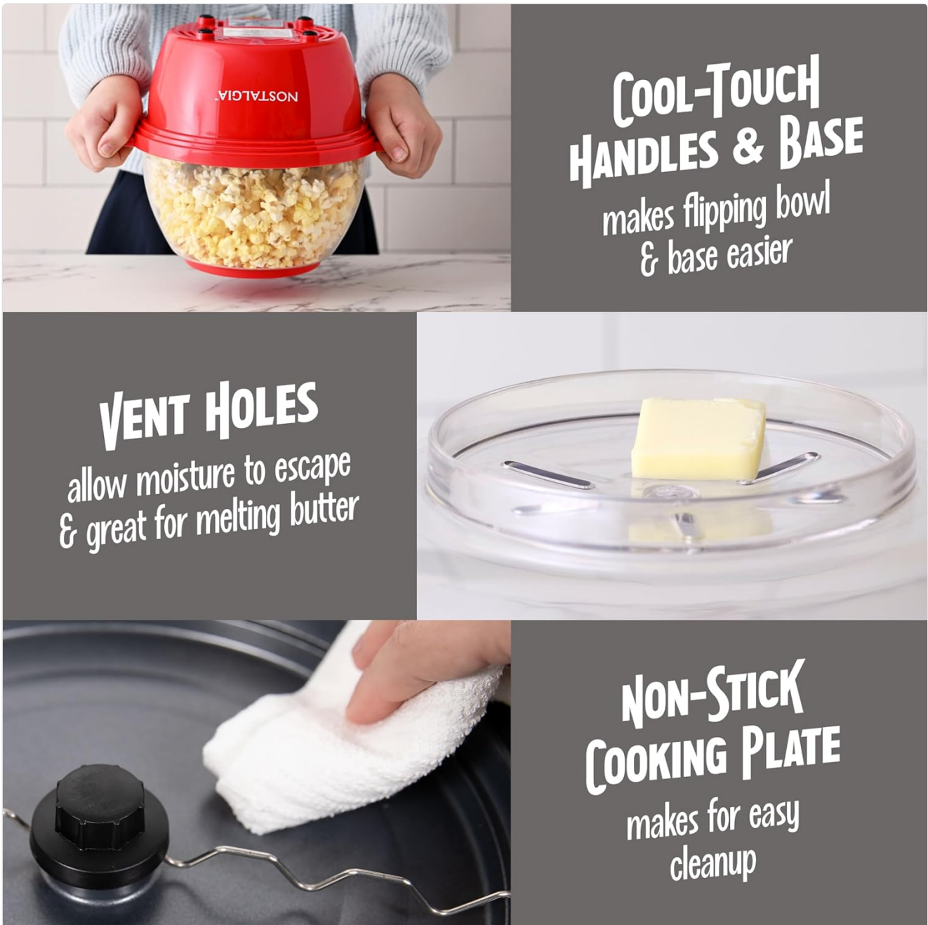
Image: A collage highlighting key features: cool-touch handles for safe handling, vent holes on the lid for moisture release and butter melting, and the non-stick cooking plate for easy cleaning.