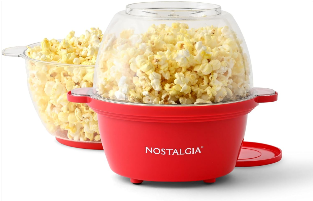
Image: The Nostalgia 8-Cup Red Electric Stirring Popcorn Maker, showing the red base unit with a clear lid full of popcorn, and a separate clear serving bowl also filled with popcorn.