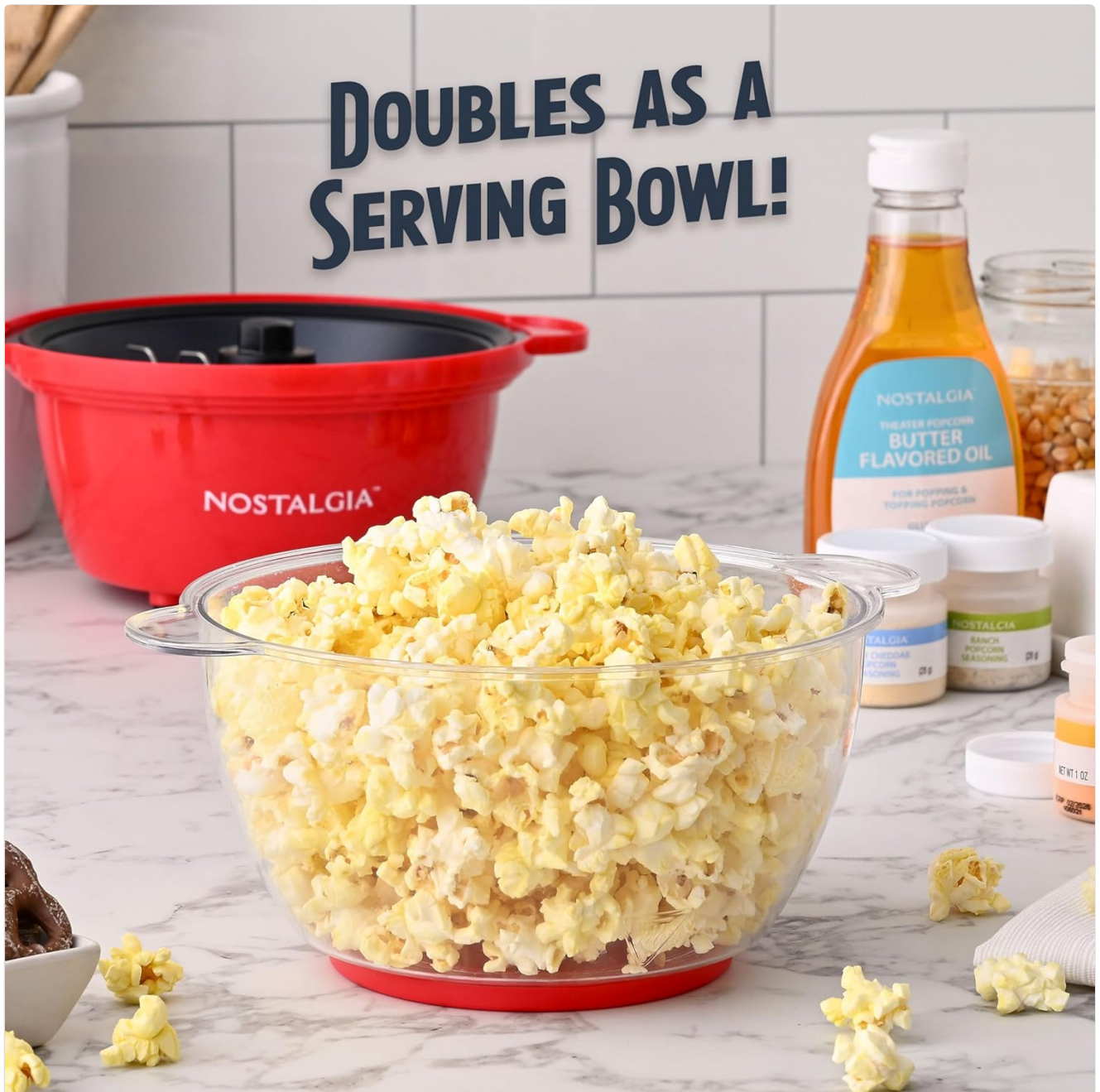
Image: The clear lid of the popcorn maker, now inverted and resting on its red base, filled with freshly popped popcorn, demonstrating its dual function as a serving bowl.